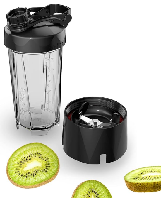
Image: The WildSide+ Jar detached from the motor base, illustrating ease of cleaning and maintenance.

BPA-free four-sided jar is a 75 ounce volume jar with 32 ounce blending capacity (wet or dry) ideal for blending beverages for 3-4 people.