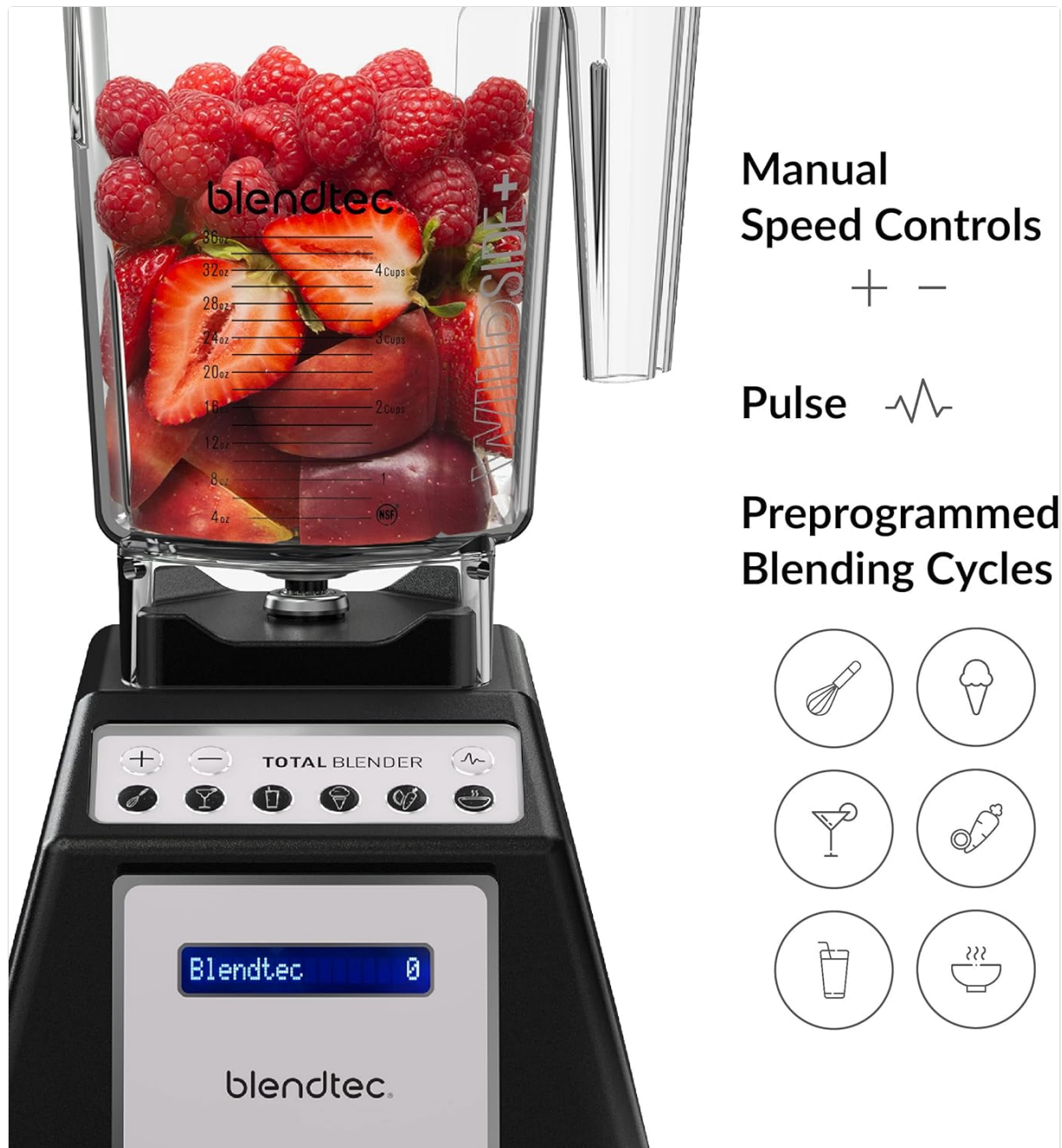
Image: Detailed view of the blender's control panel, highlighting the manual speed controls (+/- buttons) and the six preprogrammed blending cycle icons.