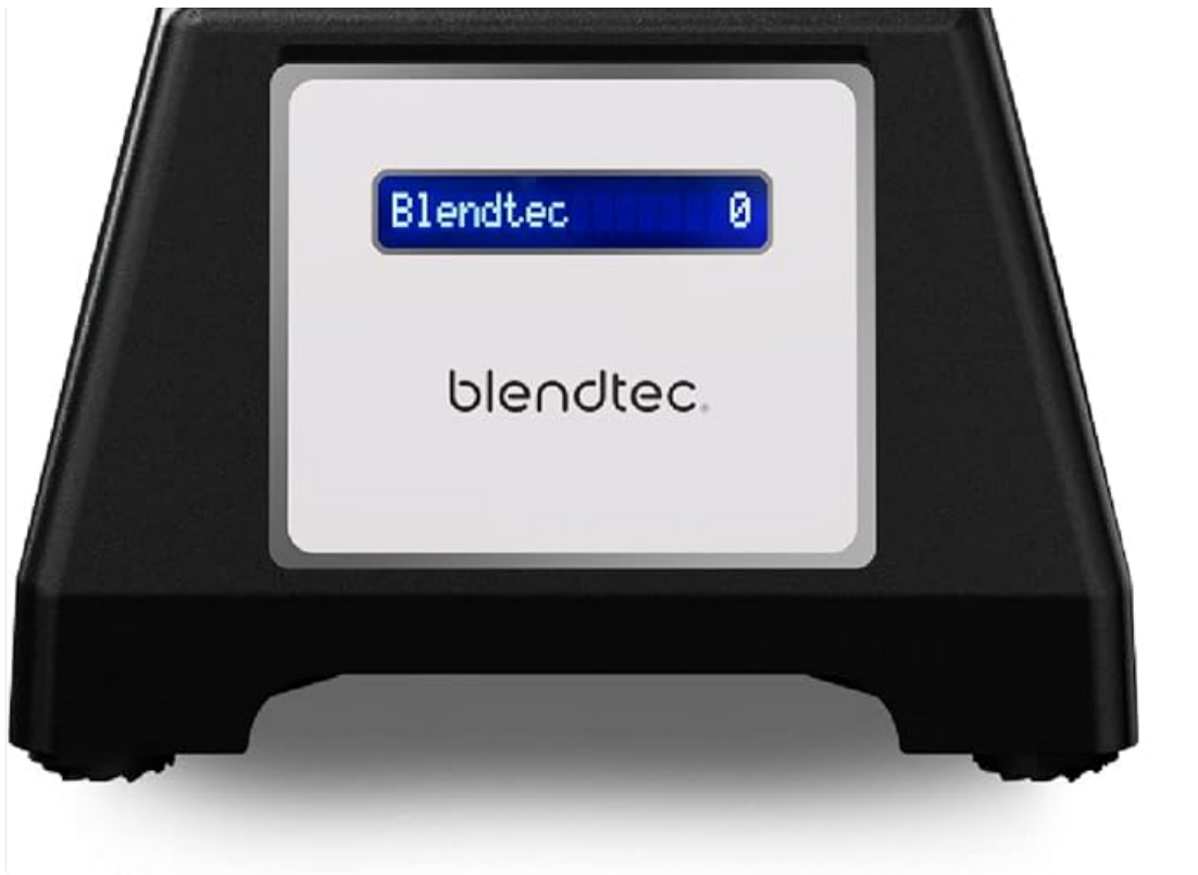
Image: The Blendtec Total Classic Original Blender with the WildSide+ Jar securely placed on the motor base, ready for operation.