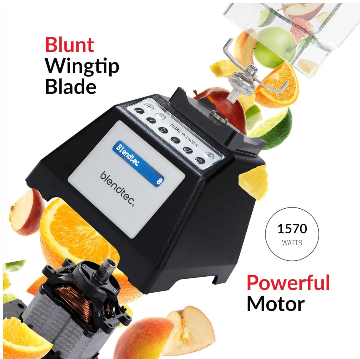
Image: The WildSide+ Jar filled with fruits and liquids, demonstrating the capacity and design for blending various ingredients.