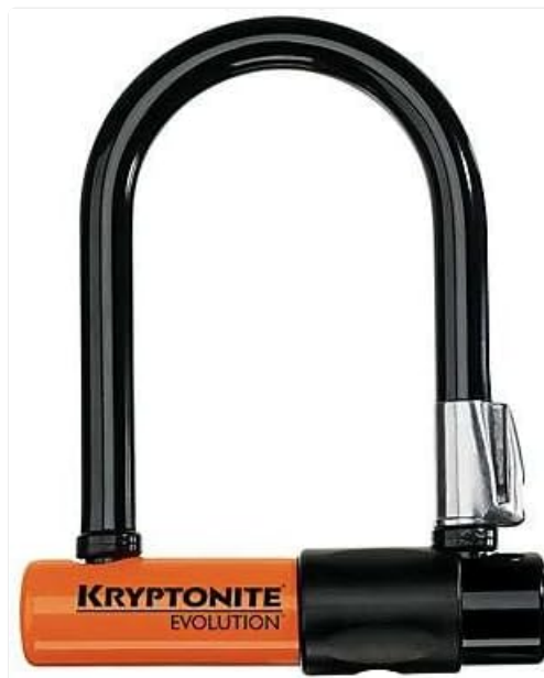
Image: The Kryptonite Evolution Mini-5 U-Lock, showcasing its compact design and orange and black color scheme.

Thank you for choosing the Kryptonite Evolution Mini-5 Bicycle U-Lock. This high-security U-lock is designed to provide robust protection for your bicycle against theft. Its compact size makes it ideal for quick stops in metropolitan areas, college campuses, and even overnight in suburban areas. This manual provides essential information on setting up, operating, maintaining, and troubleshooting your lock.