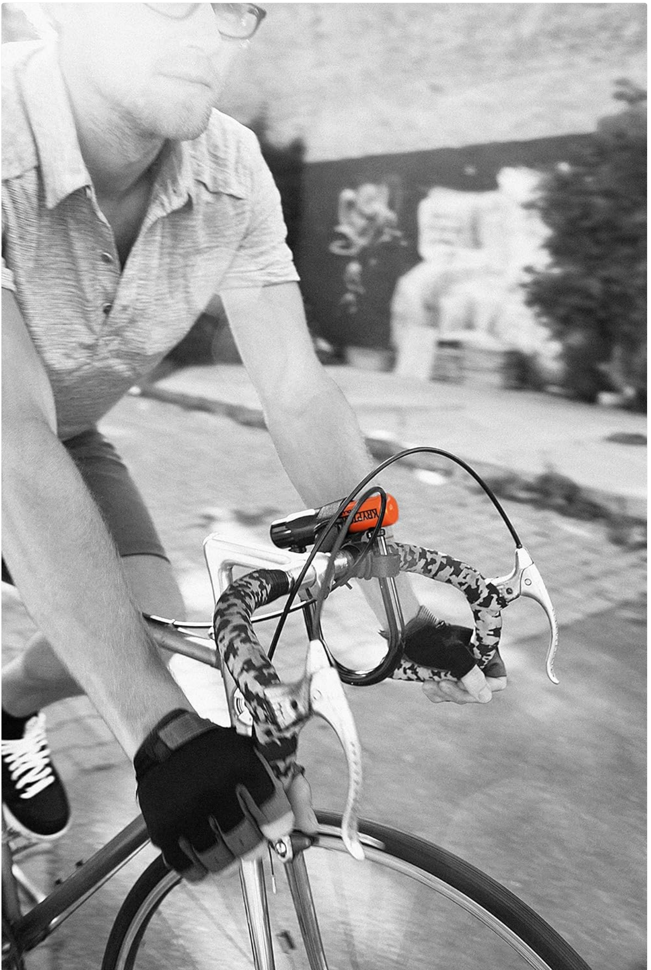
Image: A Kryptonite U-Lock mounted on a bicycle frame, demonstrating how the Transit FlexFrame-U system allows for convenient carrying.