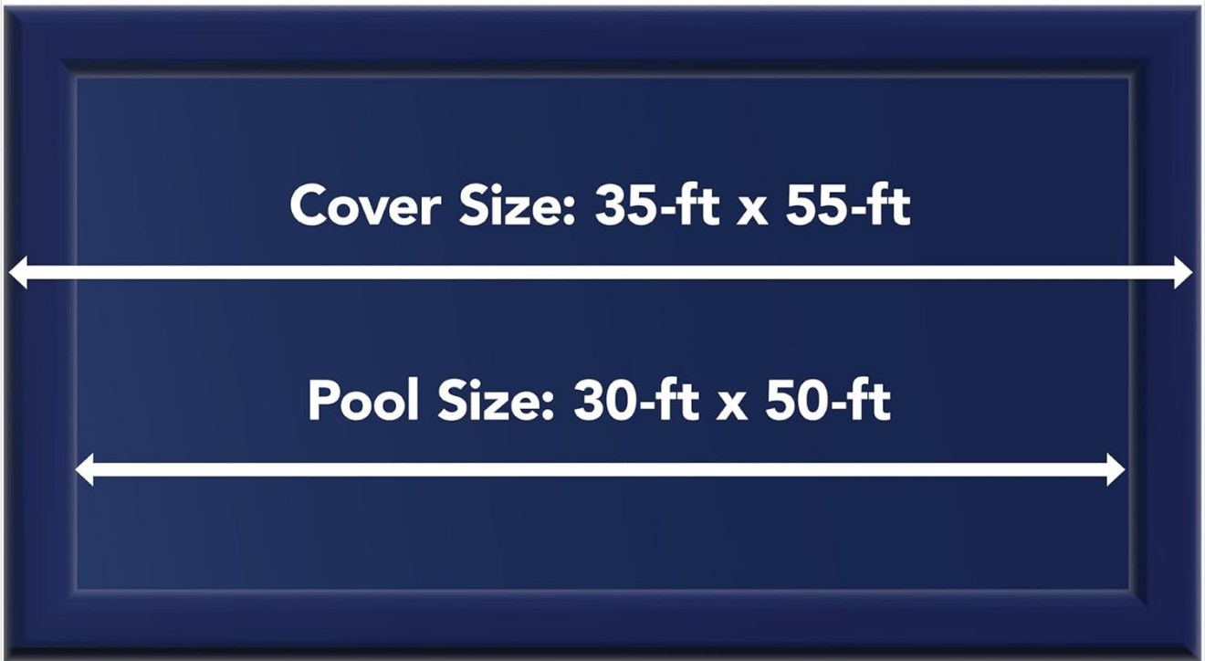
Image: Diagram illustrating the 5-foot overlap, showing the cover size (35 ft x 55 ft) for a 30 ft x 50 ft pool.