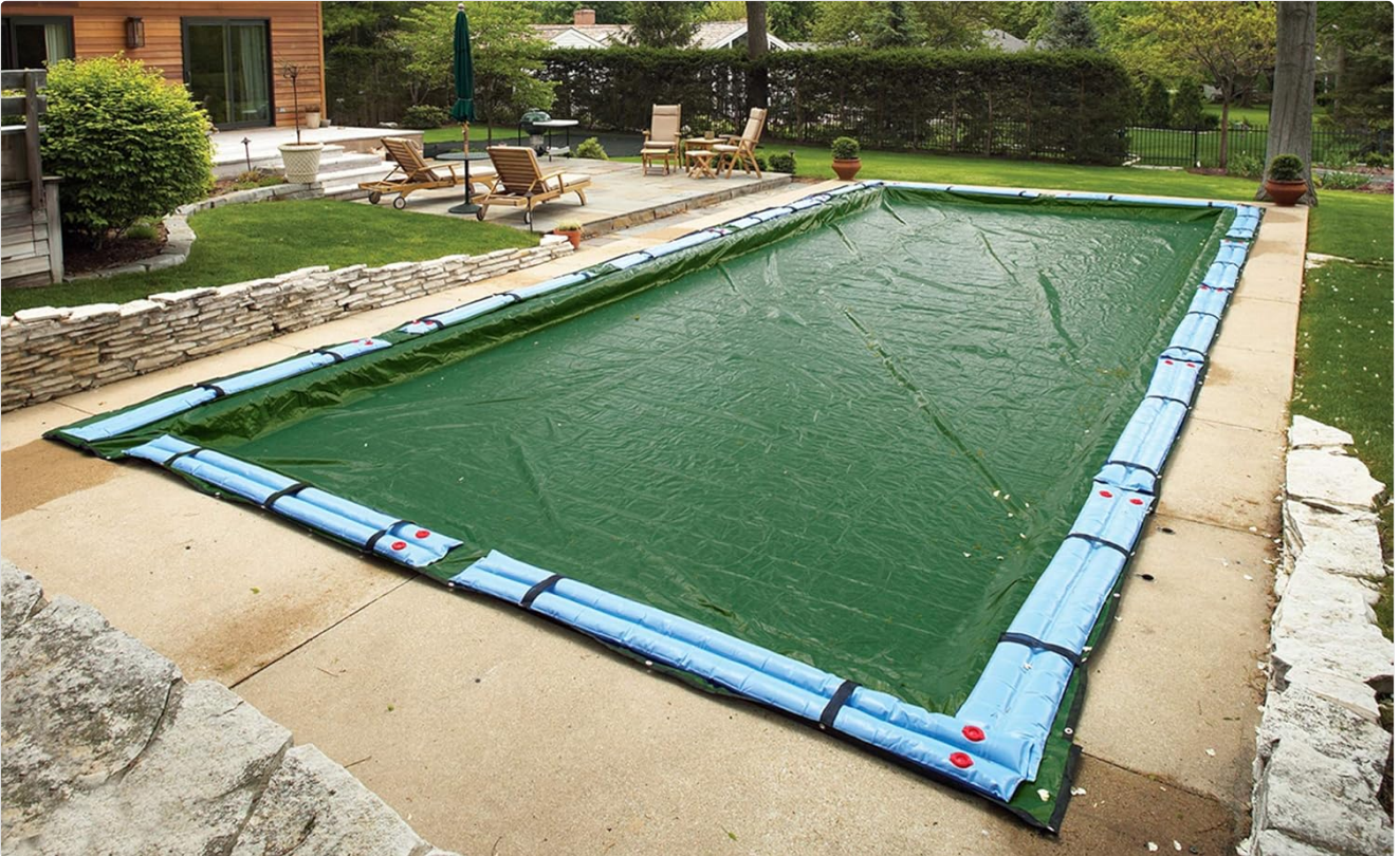
Image: Properly installed Blue Wave BWC864 winter cover on an in-ground pool, secured with water tubes.