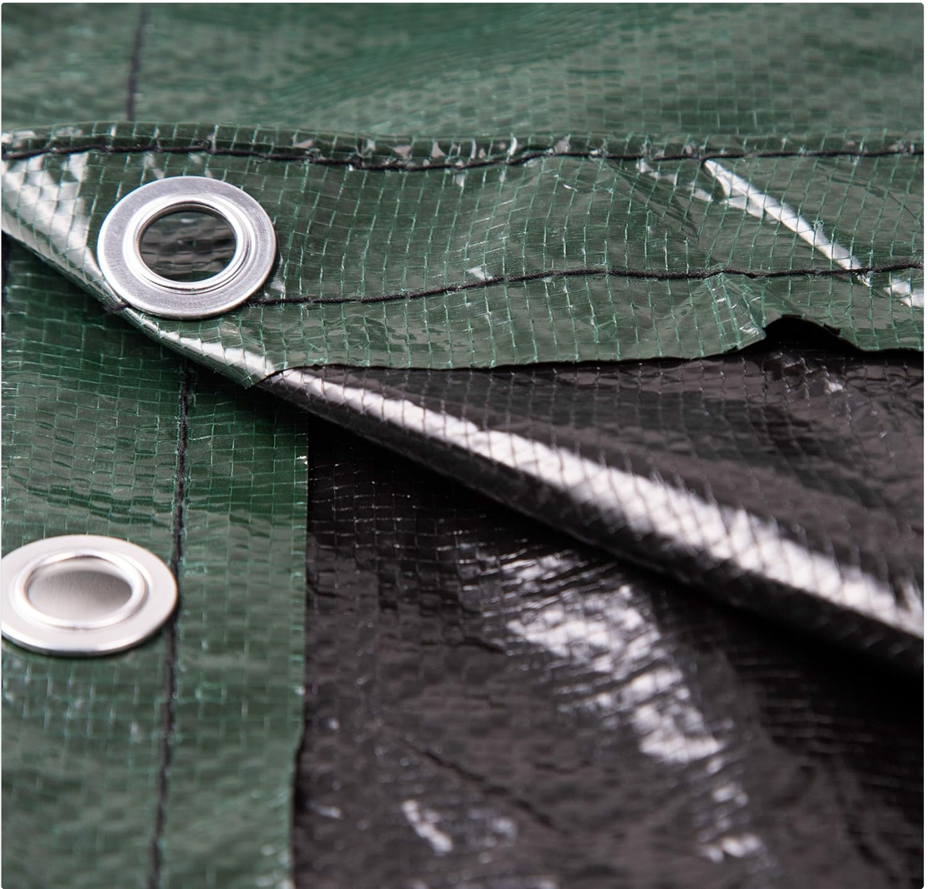
Image: Close-up of the durable polyethylene material and reinforced grommet construction.