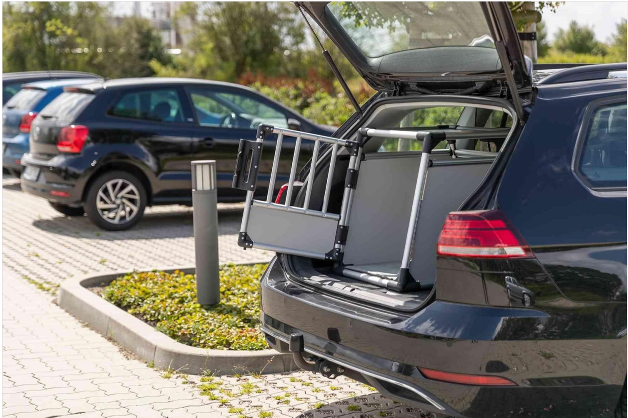
Image 5.1: The TRIXIE transport box positioned securely in the trunk of a car.

Place the transport box in the trunk or cargo area of your vehicle. Utilize the Velcro strip on the base to help prevent sliding. For optimal safety, consider using additional straps or restraints to secure the box firmly, preventing movement during sudden stops or turns.