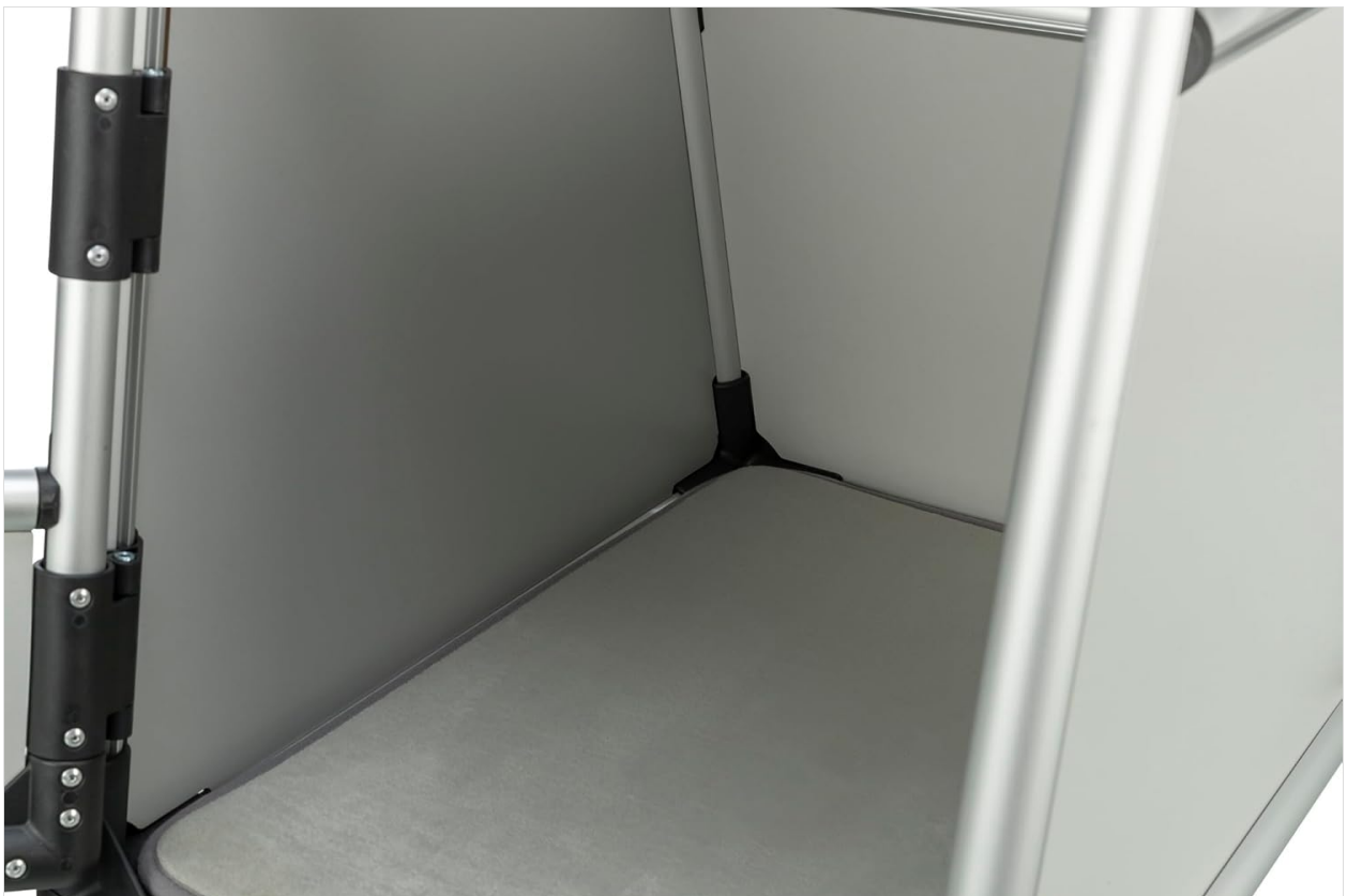
Image 4.3: Interior view of the transport box, showing the non-slip mat for pet comfort and stability.