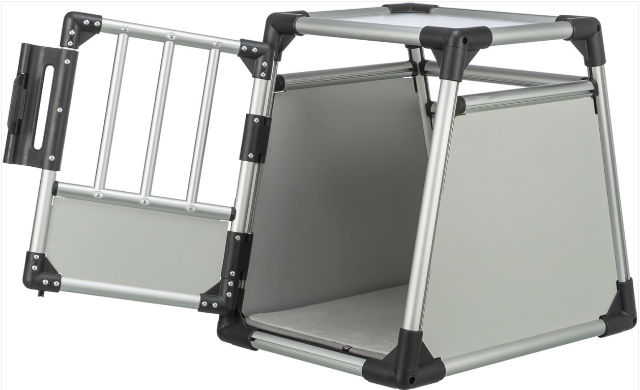
Image 4.1: The transport box with its door open, illustrating the entry point for the dog.