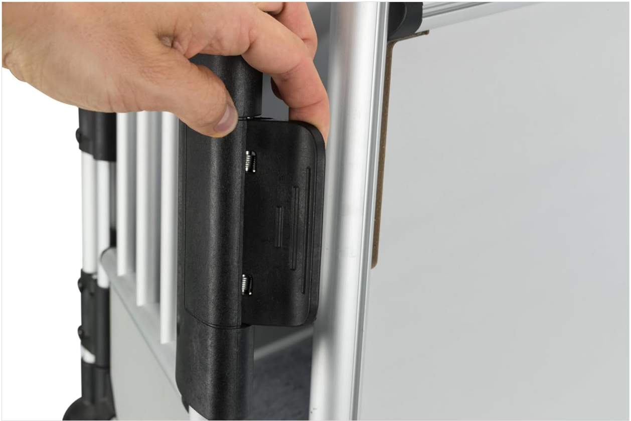
Image 4.2: A close-up view of the secure latch mechanism on the transport box door.