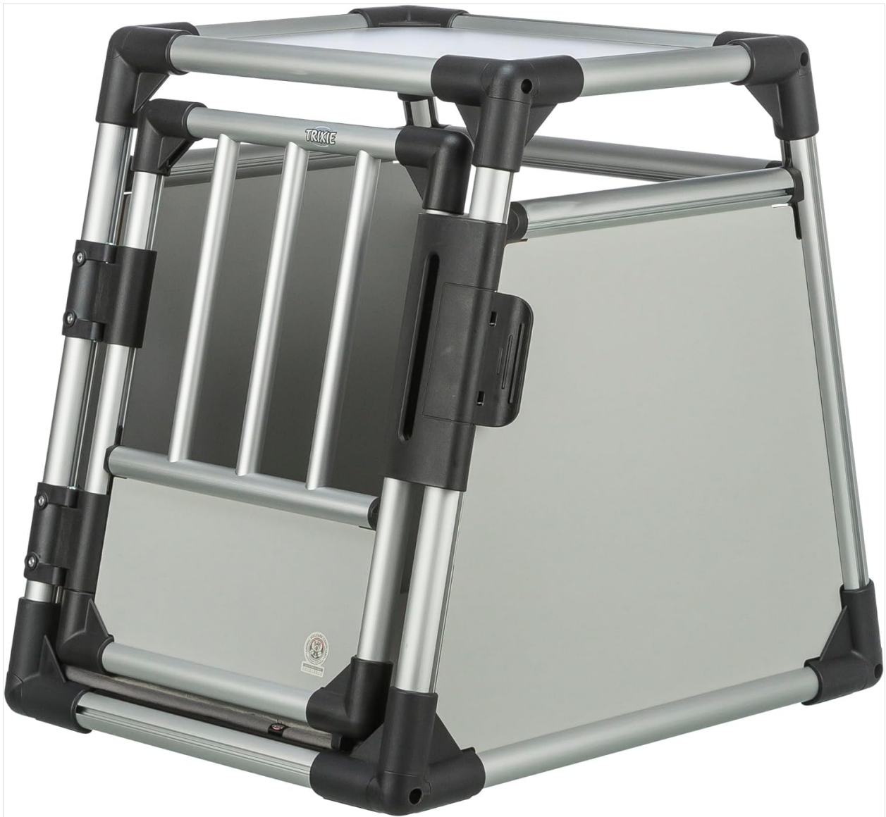
Image 1.1: Front-side view of the TRIXIE Aluminium Dog Transport Box, showcasing its sturdy construction and design.