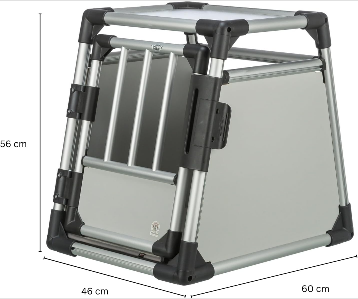
Image 8.1: The TRIXIE transport box with its key dimensions (length, width, height) indicated.