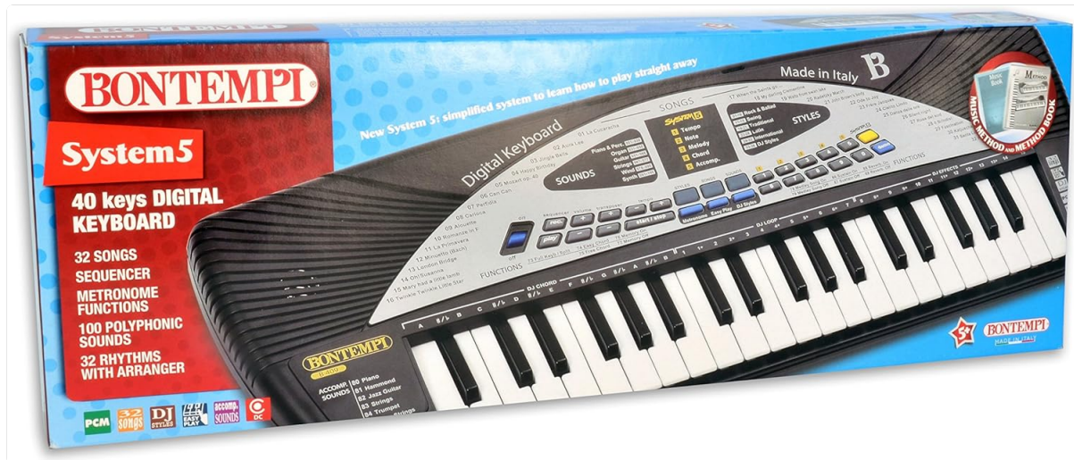
Image: The Bontempi B 409 keyboard shown within its retail packaging, highlighting the product's presentation and included music stand.

Note: 6 x 1.5V R6/AA batteries are not included and must be purchased separately.