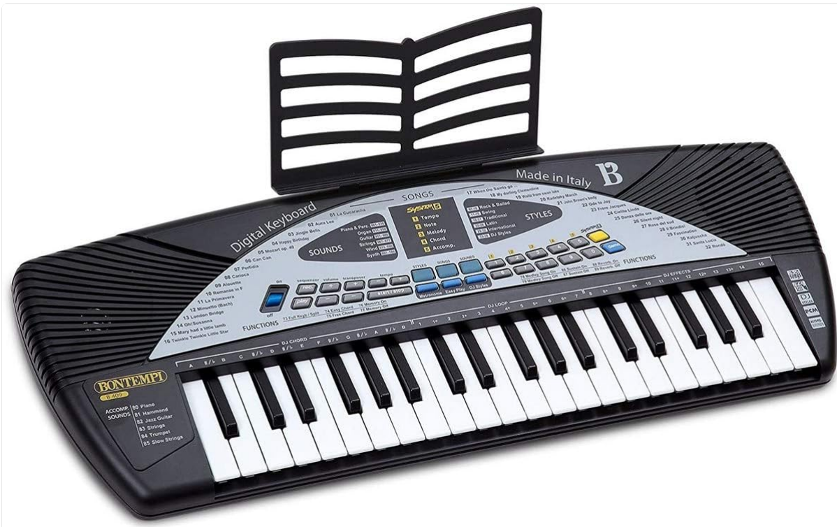
Image: An overhead view of the Bontempi B 409 keyboard, showcasing its 40 Midi keys, control panel, and integrated speaker.