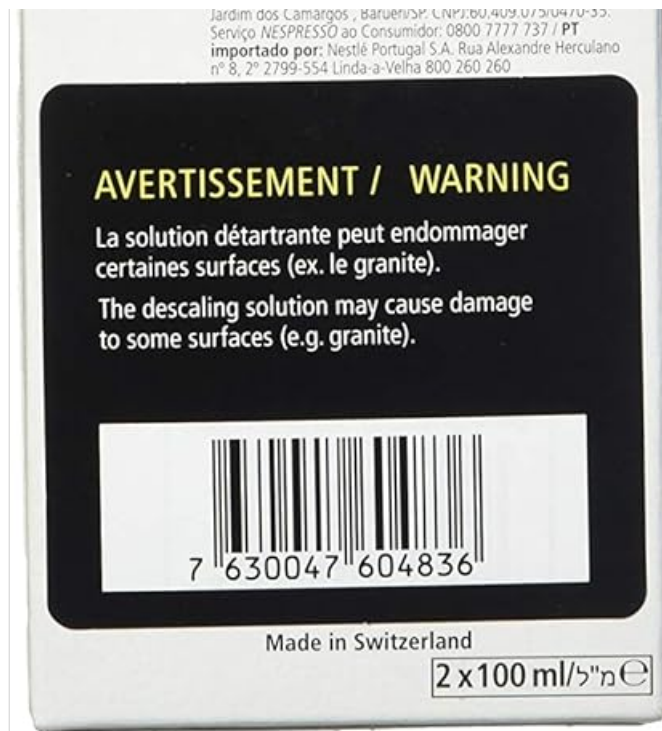
Figure 2: Safety warnings and usage instructions as printed on the product packaging.