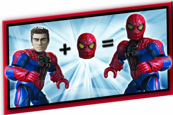
Image: A visual representation of how to interchange the heads on the micro action figure to transform Peter Parker into Spider-Man.