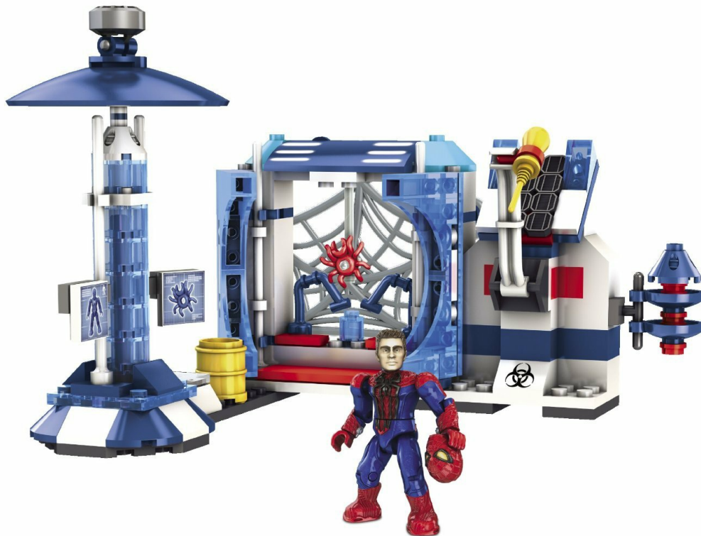
Image: The assembled Oscorp Spider Lab, featuring the Peter Parker micro action figure.