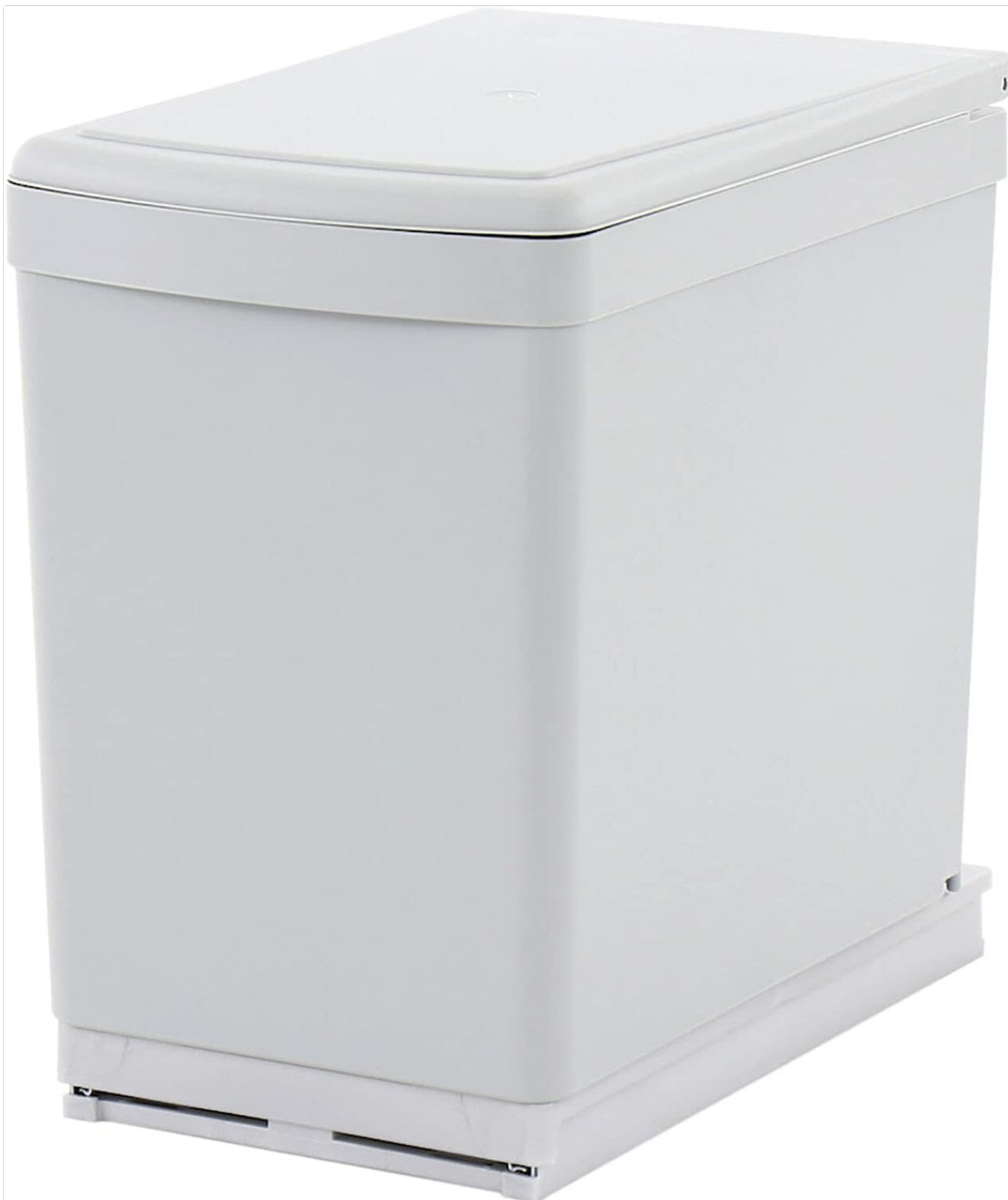
Image 0.1: The Wesco 16L Automatic Pull-Out Waste Bin. This image displays the complete waste bin unit in a closed position, showcasing its compact design and grey color.