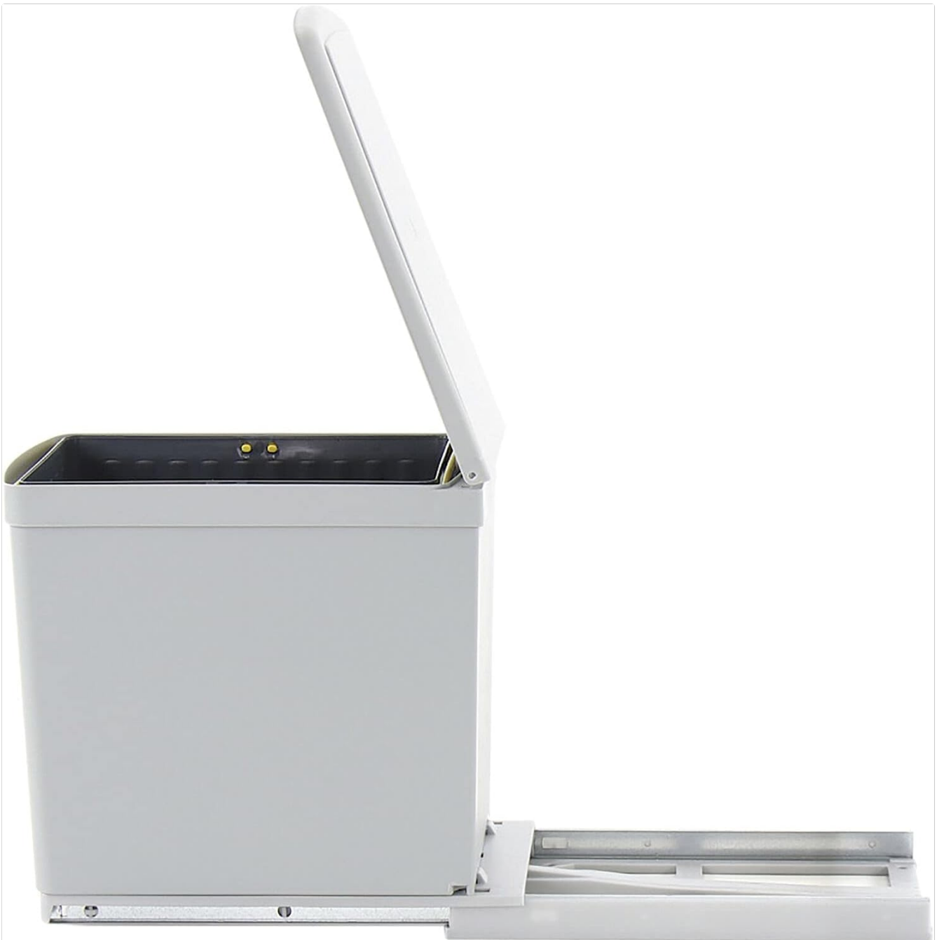
Image 2.1: Waste bin in open position. This image shows the side profile of the waste bin fully extended from the cabinet, with its lid