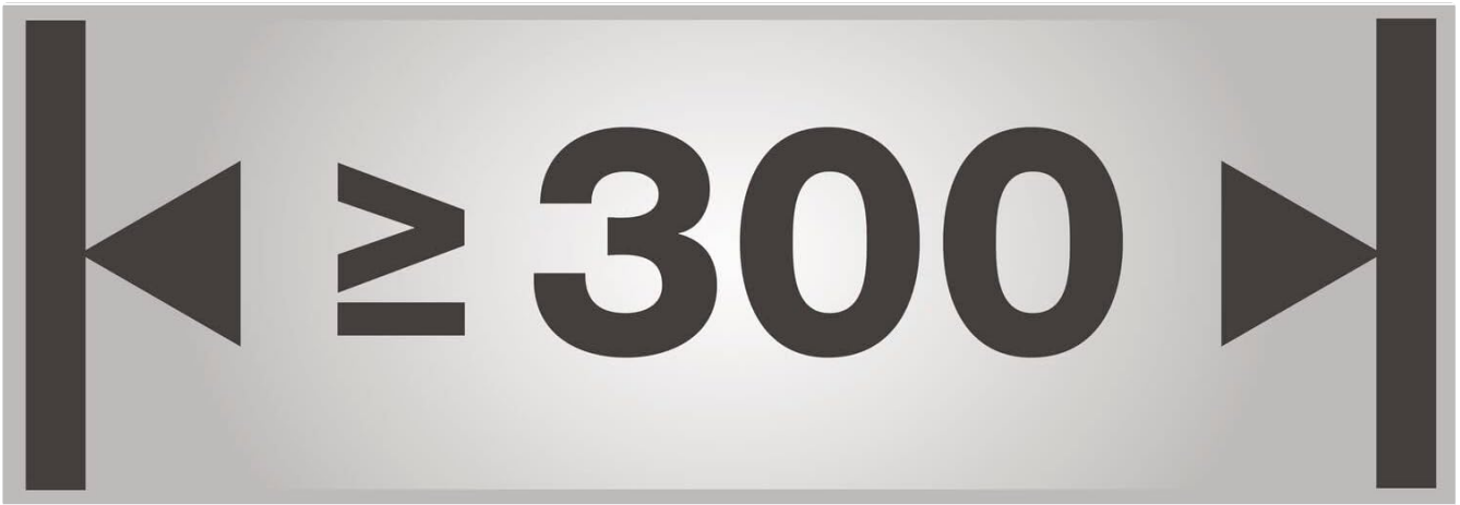
Image 1.1: Minimum cabinet width requirement. The diagram indicates a minimum width of 300mm (30cm) for installation.