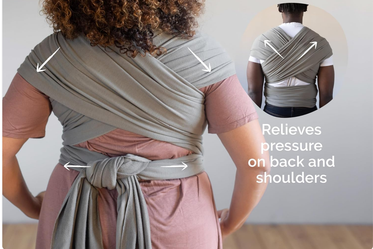
Image: Mother wearing a baby in a Boba Baby Wrap Carrier, with arrows indicating optimal weight distribution across her back and shoulders.