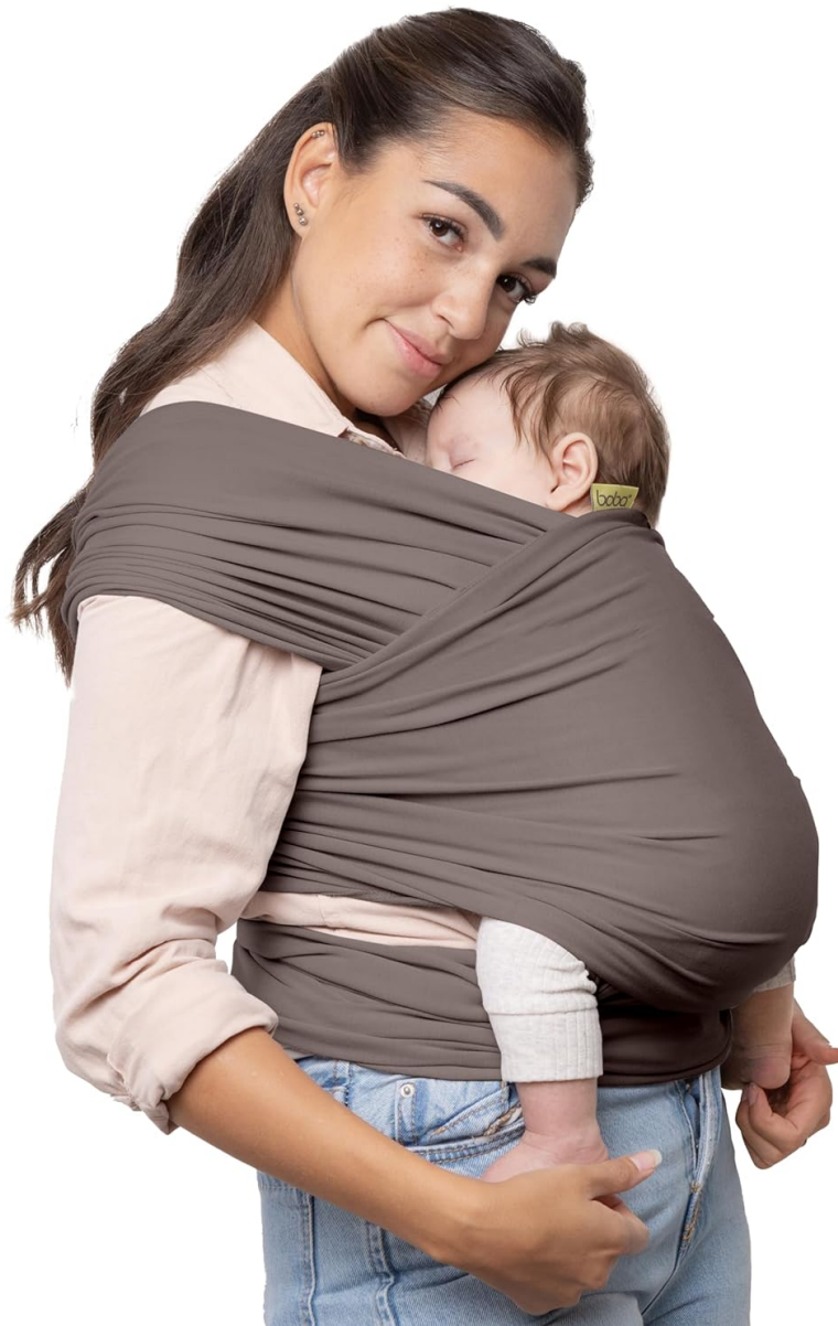
Image: Mother holding a sleeping baby in a grey Boba Baby Wrap Carrier, demonstrating close bonding.