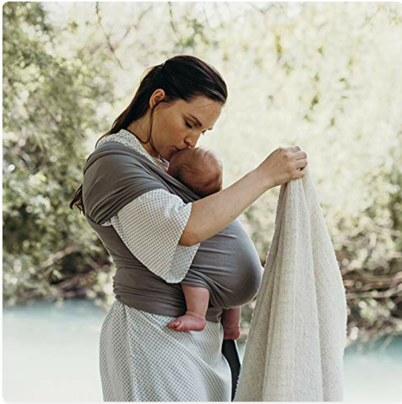
Image: Mother holding a baby in a grey Boba Baby Wrap Carrier, adjusting the fabric for a secure fit.