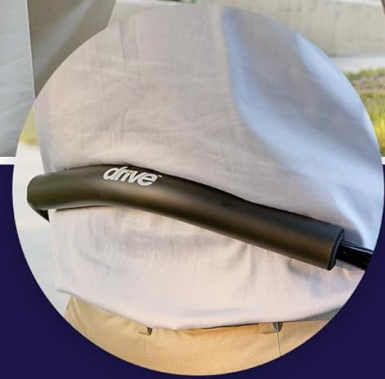
Image: Ergonomic hand brakes provide secure stopping and parking capabilities.

Rest comfortably with fold-down backrest