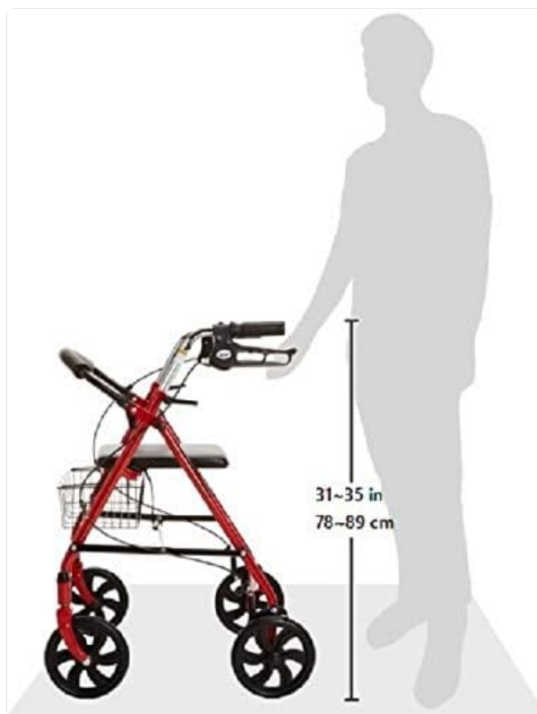
Image: Adjusting the handle height for personalized comfort and proper posture.