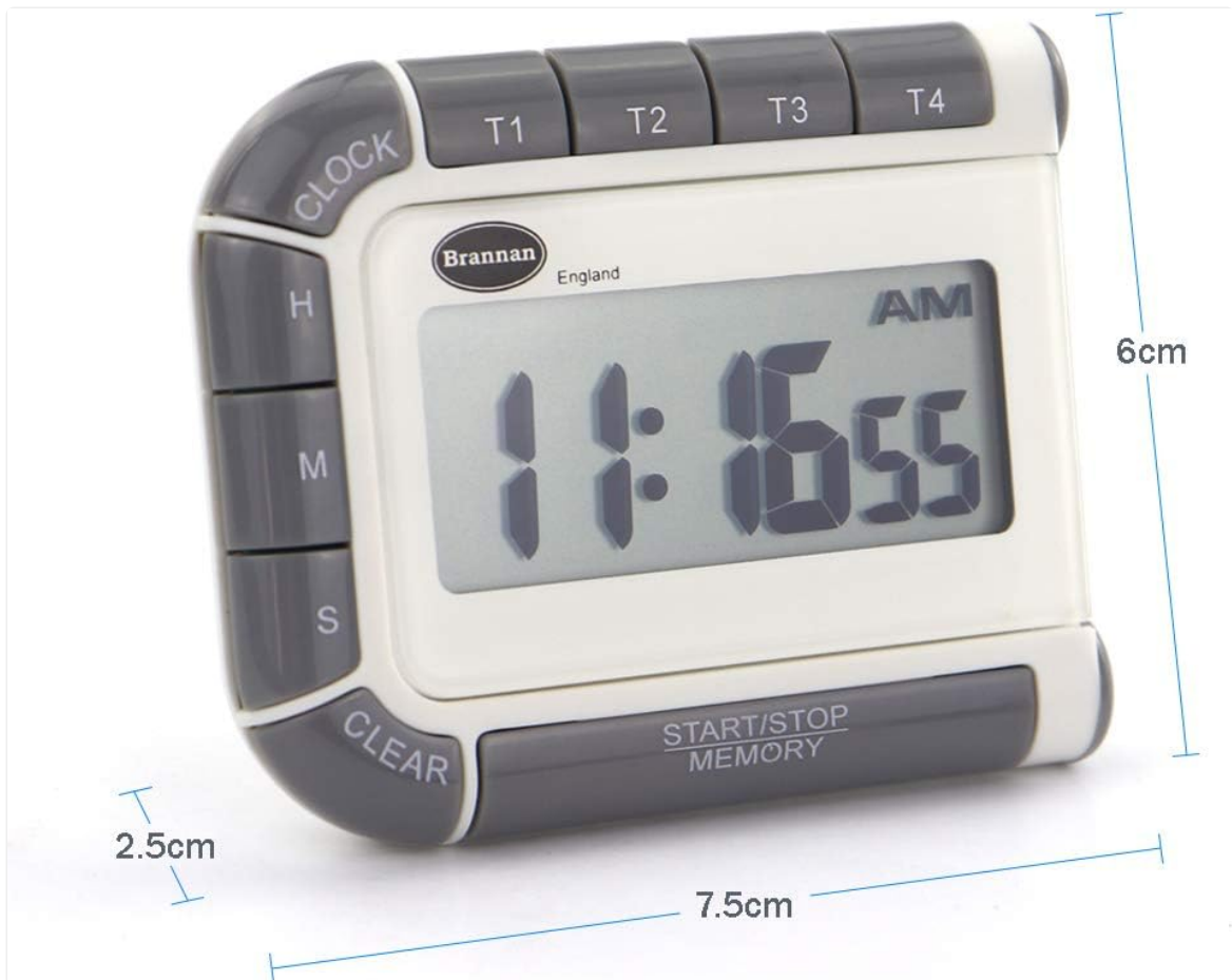
Image: Side view of the timer illustrating its dimensions.