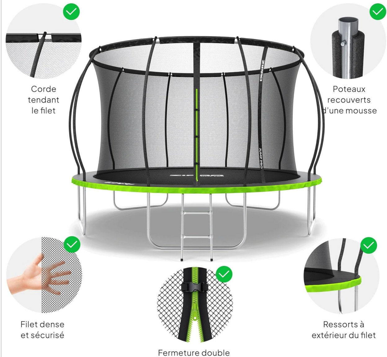
Image 3.3: Secure inner net features including dense net, double zipper, tension rope, foam-covered poles, and springs located outside the net.