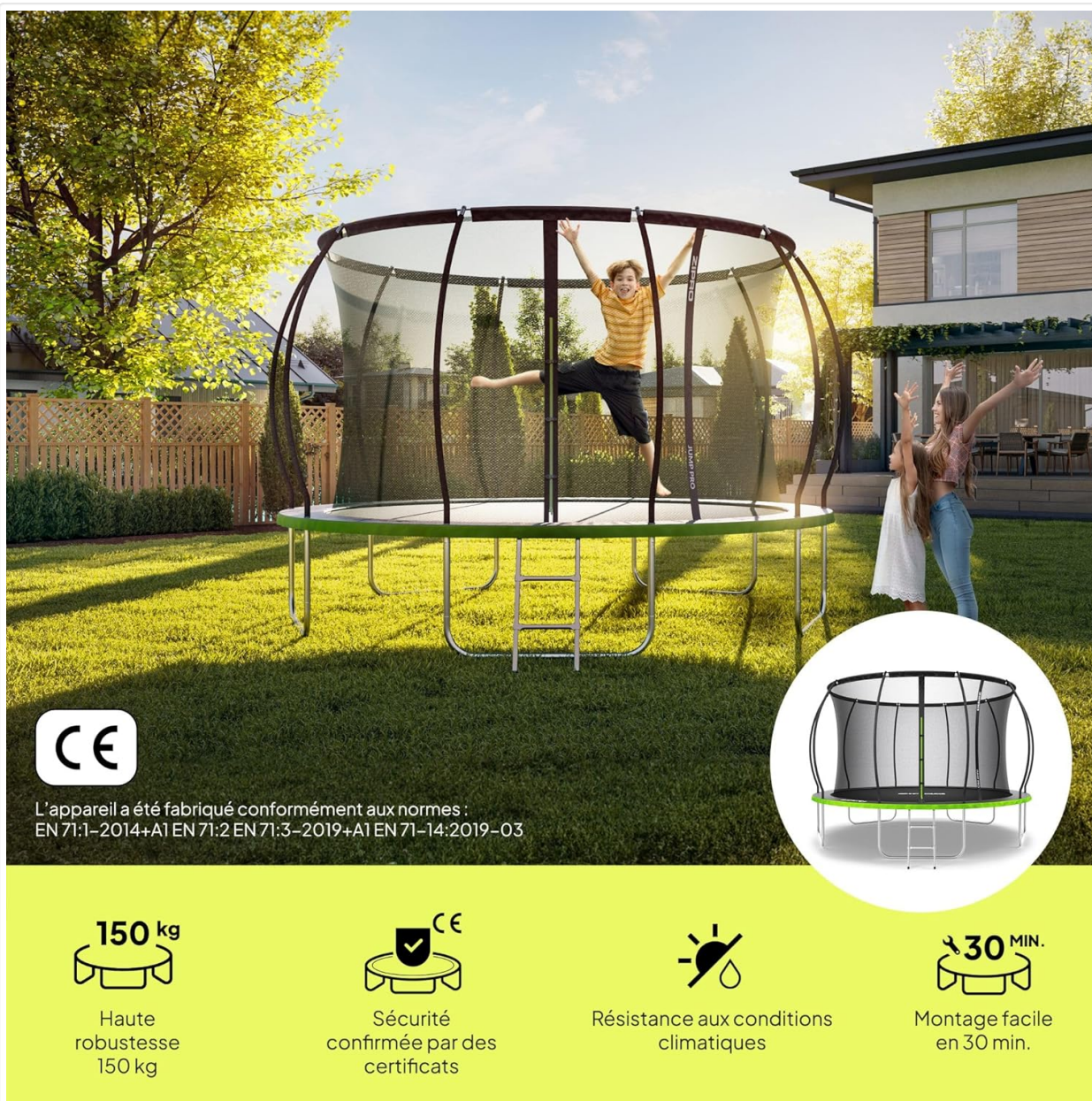
Image 3.4: The assembled ZIPRO JumpPro Premium Trampoline in a garden setting, highlighting its safety certification, 150 kg capacity, weather resistance, and quick assembly.