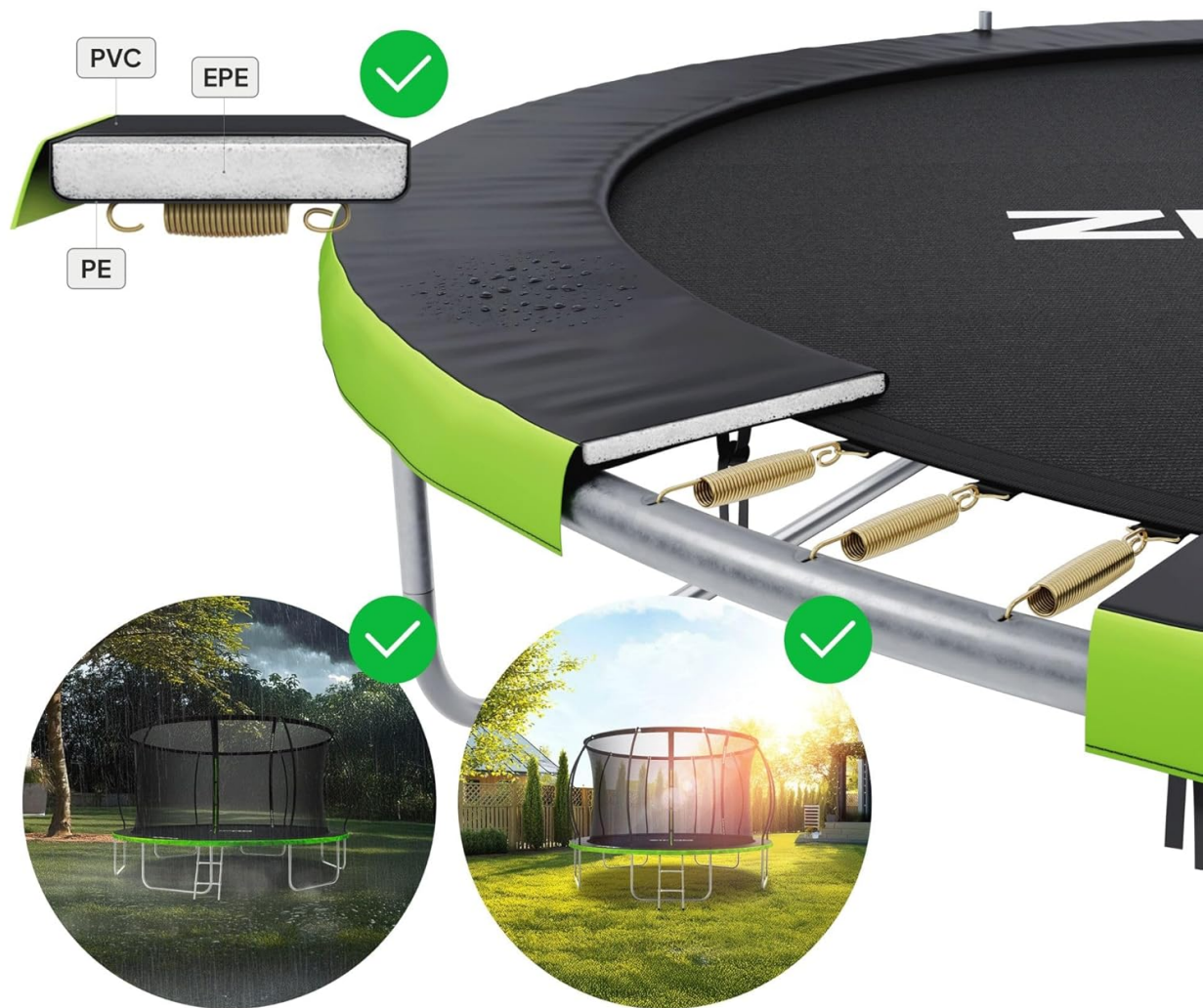
Image 5.1: The trampoline is constructed with high-quality, weather-resistant materials (PVC, EPE, PE) designed to withstand both sun and rain.