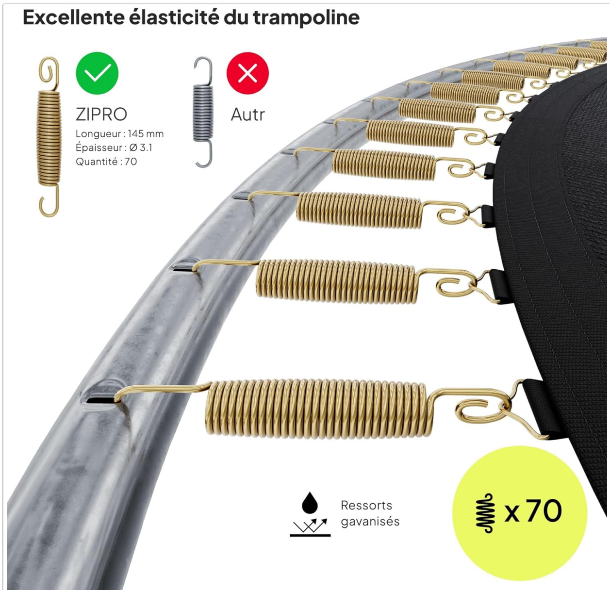
Image 3.2: Detail of galvanized springs connecting the jumping mat to the frame, highlighting the excellent elasticity.

Install the jumping mat and attach the 70 galvanized springs.