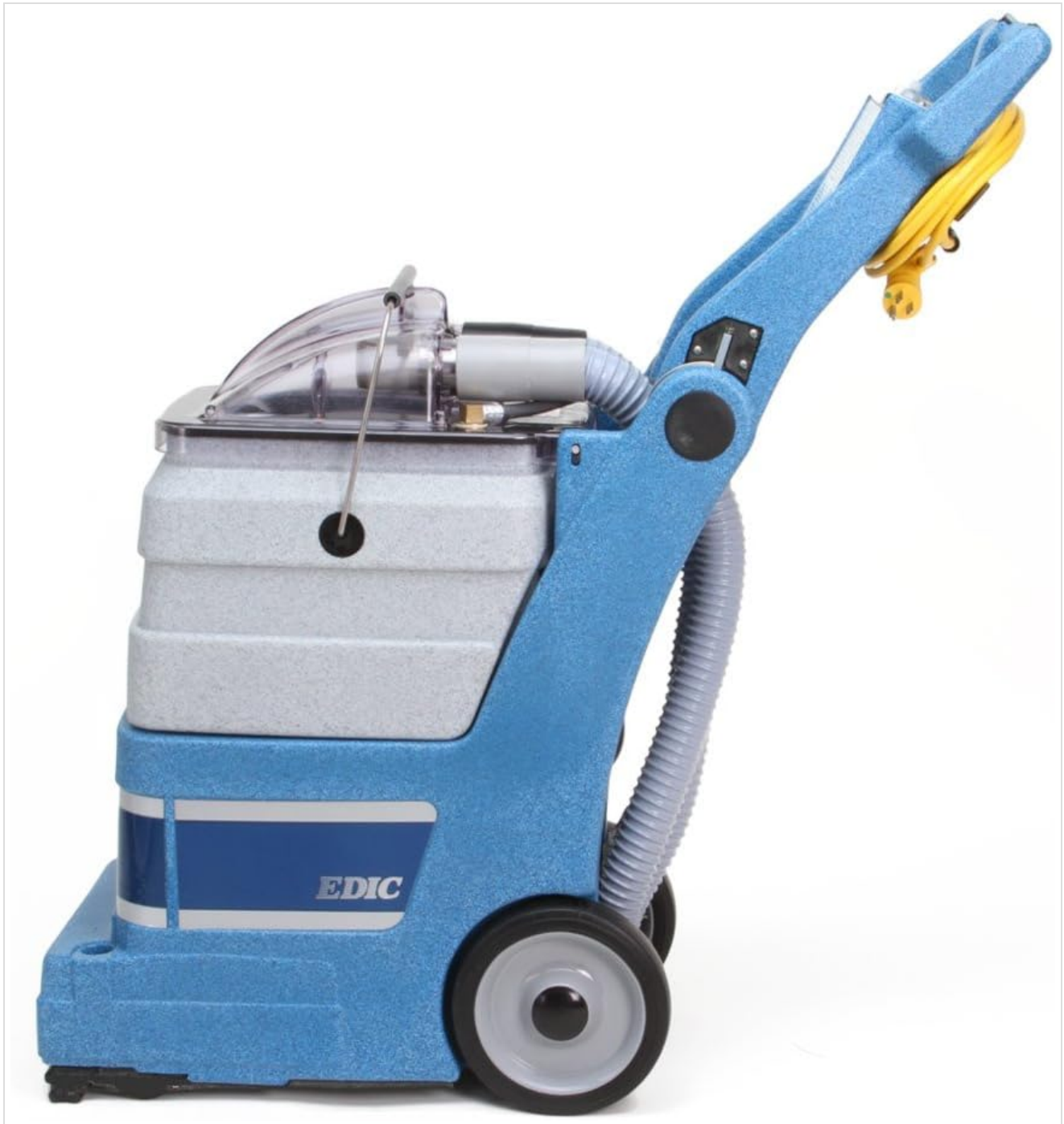
Figure 4: Side view of the Fivestar, showing the mode switch location.

Before beginning, ensure the mode switch on the lower right side of the Fivestar is set to the correct position for the surface you are cleaning (e.g., Carpet or Floor).