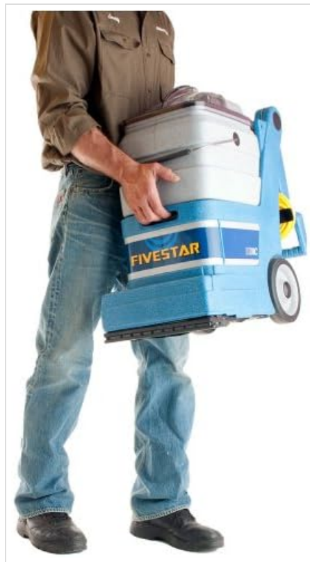
Figure 2: The Fivestar's compact design allows for easy transport by a single person.