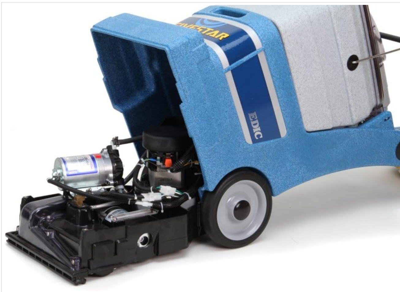
Figure 6: View of the Fivestar's internal components, including the pump and motor.