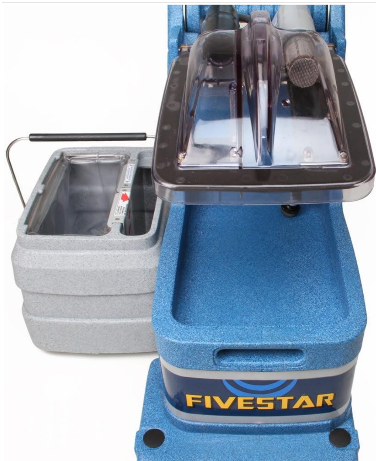
Figure 3: Top view of the Fivestar showing the solution and recovery tanks.