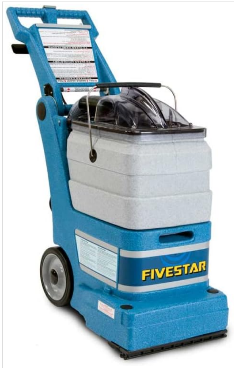
Figure 1: The EDIC Fivestar Self-Contained Carpet Extractor 401TR.