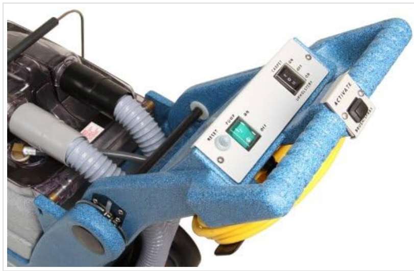
Figure 5: Close-up of the Fivestar's control panel on the handle.