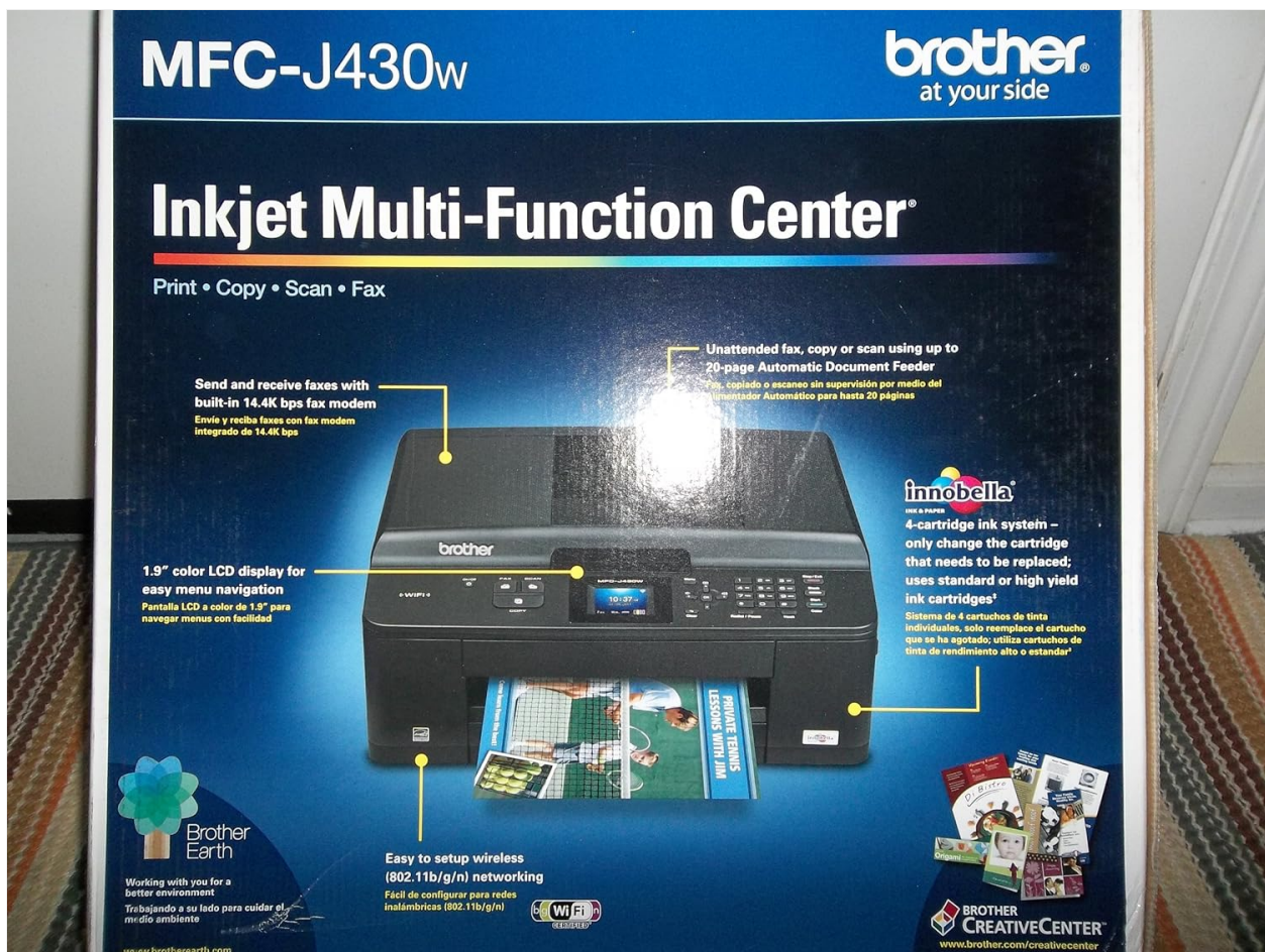
Figure 1.1: Front view of the Brother MFC-J430W packaging, highlighting key features like wireless connectivity and the 1.9-inch color LCD.