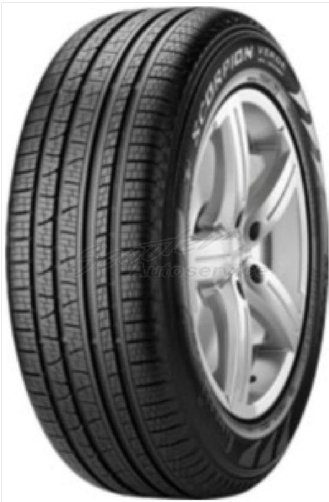
Image: Pirelli Scorpion Verde All Season tire mounted on a wheel, illustrating the tire's appearance when installed.