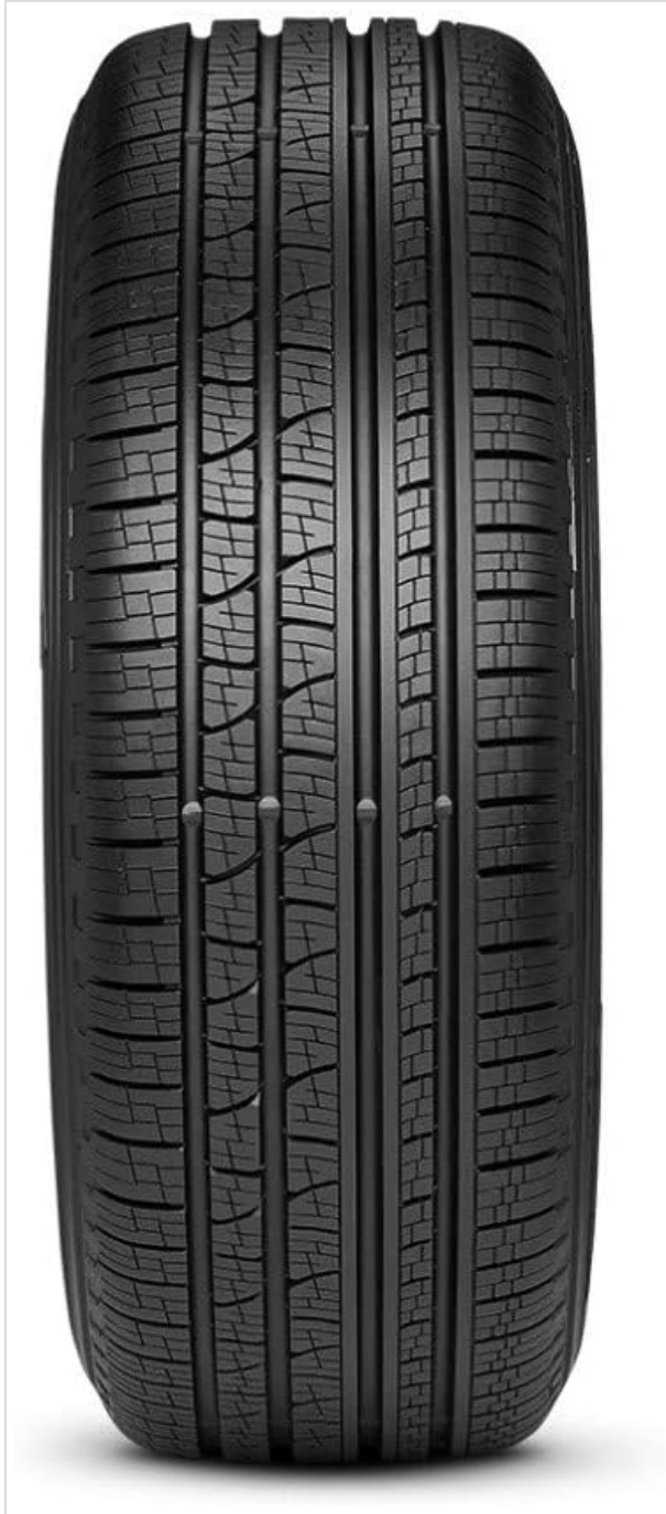
Image: Detailed view of the Pirelli Scorpion Verde All Season tire tread pattern, highlighting the asymmetrical design for optimal performance.