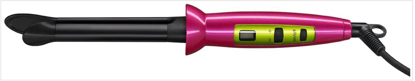
Image: Full view of the Bosch ProSalon S-Wave Styler PHC9590, showing the fuchsia-apple green handle, control panel, and black ceramic styling plates.

Familiarize yourself with the components of your Bosch ProSalon S-Wave Styler PHC9590.