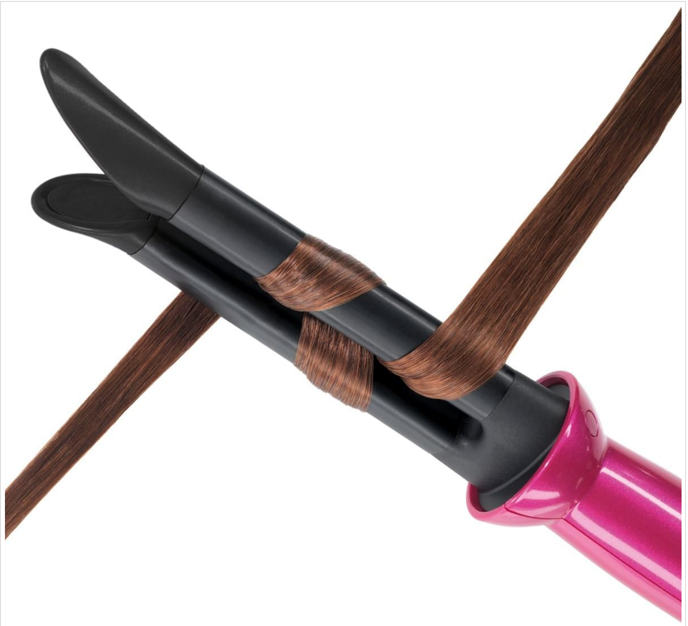
Image: A section of brown hair being clamped between the S-wave styling plates of the Bosch styler to create a wave pattern.