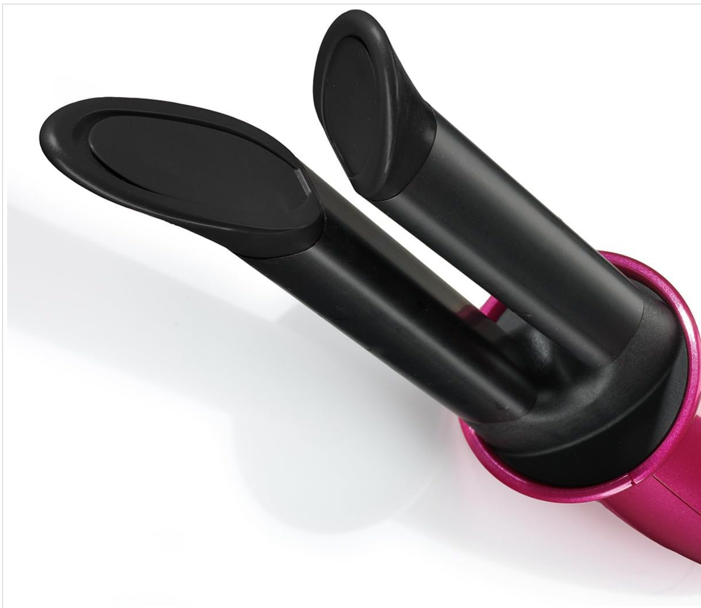
Image: Close-up view of the ceramic styling plates of the Bosch S-Wave Styler, showing their unique S-wave shape.