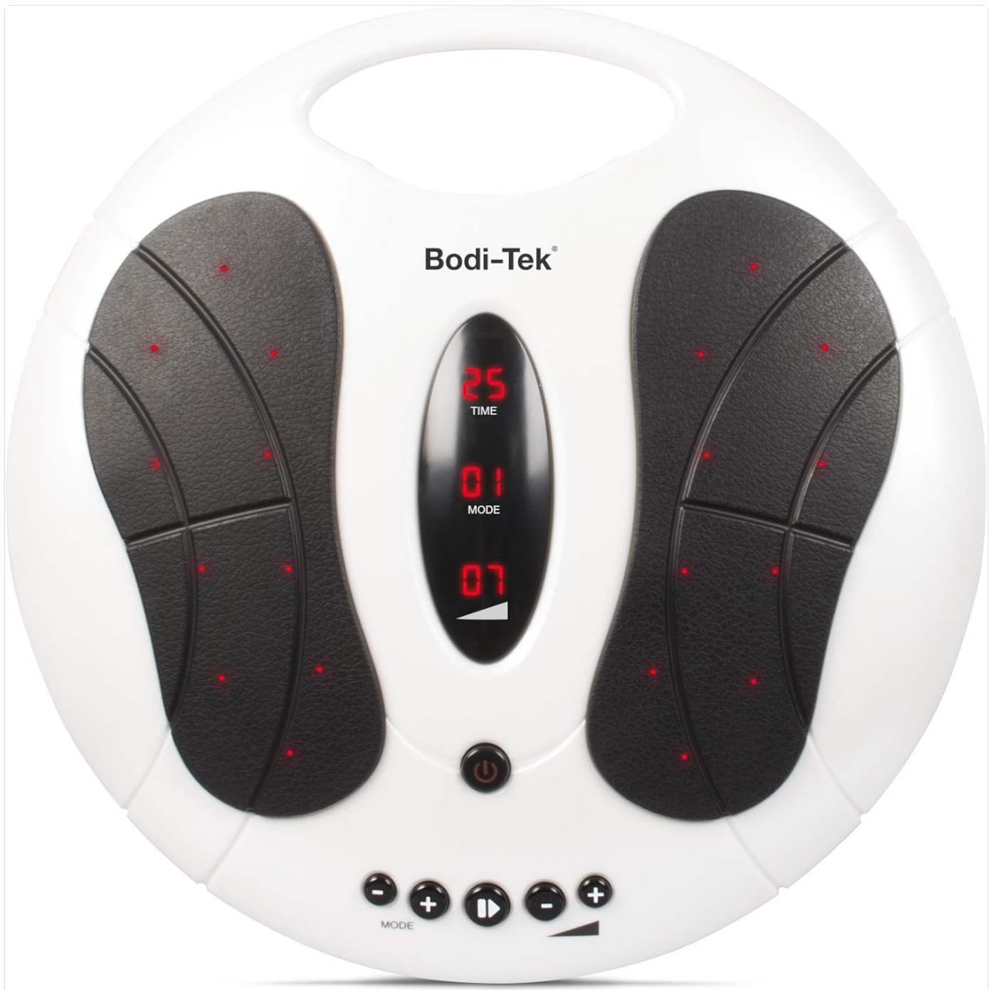
Image 1.1: The Bodi-Tek BT-CRBO3 Circulation Plus device, showing its circular design with two large footpads and a central control panel with a digital display.

Regular use of the Circulation Plus can contribute to improved comfort and well-being in your lower extremities. Please read this manual thoroughly before first use and retain it for future reference.