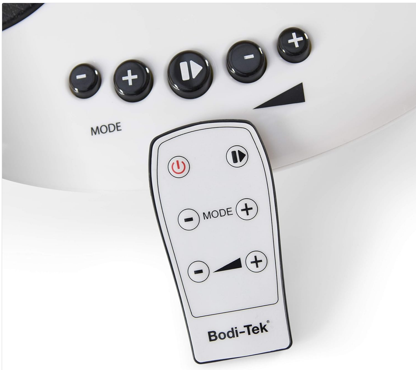
Image 4.2: A detailed view of the device's control panel buttons and the accompanying remote control, showing power, mode, and intensity adjustment buttons.

The remote control allows for convenient adjustment of settings without bending down.