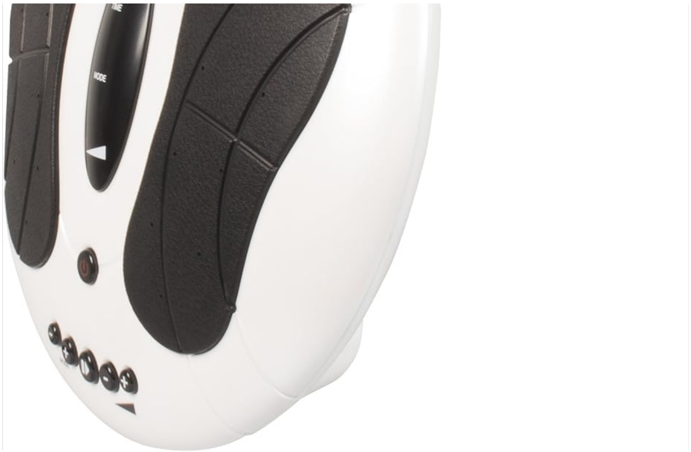
Image 4.1: The Bodi-Tek Circulation Plus device being held by its integrated handle, demonstrating its portability and compact design.