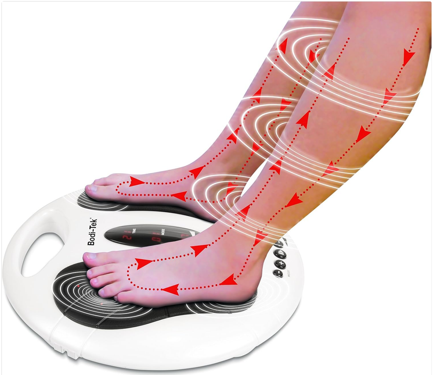
Image 6.1: An illustrative diagram depicting how the electrical impulses from the footpads travel up the legs, stimulating muscles and