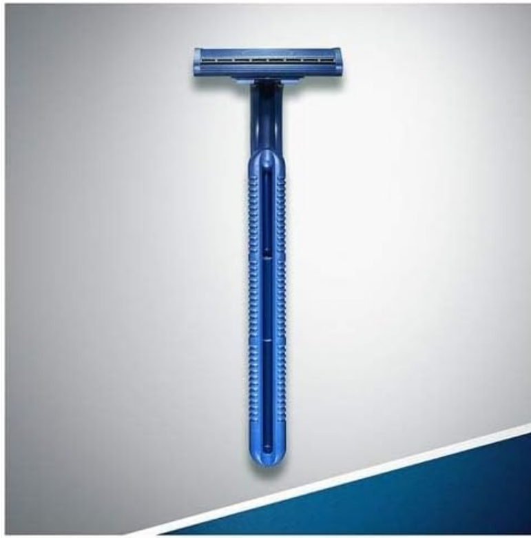
Image 4.2: Razor blades detail. A magnified view of the Gillette 2 razor's twin blades, emphasizing their design for effective hair removal.