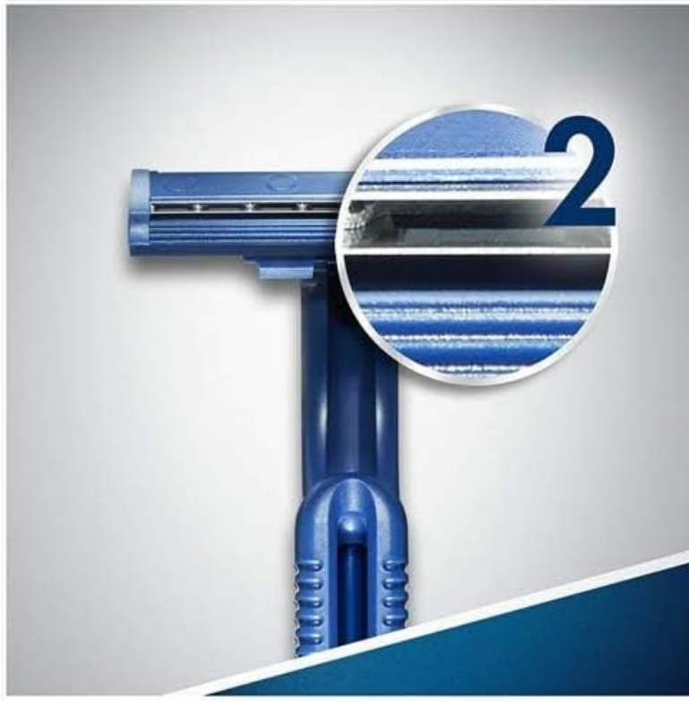
Image 5.1: Razor side profile. This image provides a clear side view of the Gillette 2 disposable razor, showing the angle of the head and the handle's design.