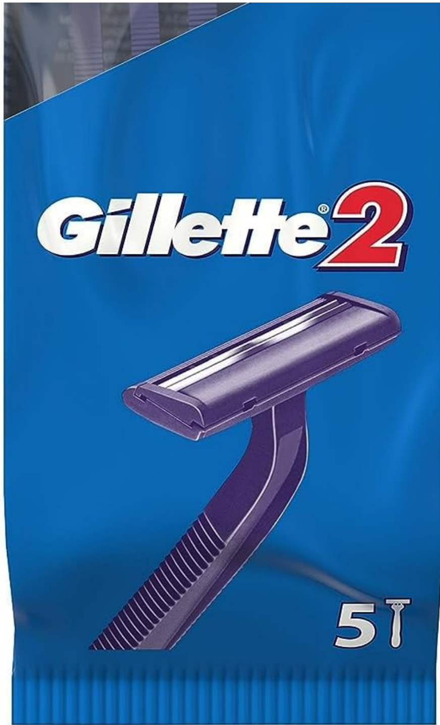
Image 1.1: Gillette 2 Men's Disposable Razor. This image displays a single blue disposable razor alongside a package containing five similar razors, highlighting the product's design and packaging.