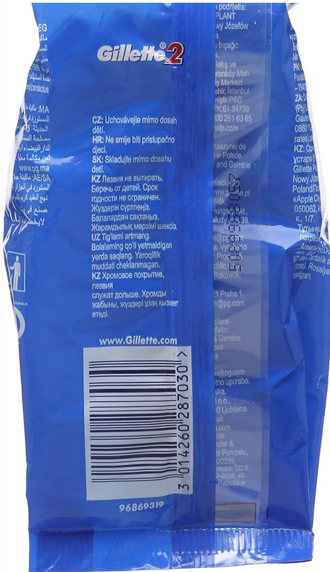
Image 1.2: Gillette 2 Men's Disposable Razor packaging. A clear view of the product's retail packaging, showing a pack of five Gillette 2 disposable razors.