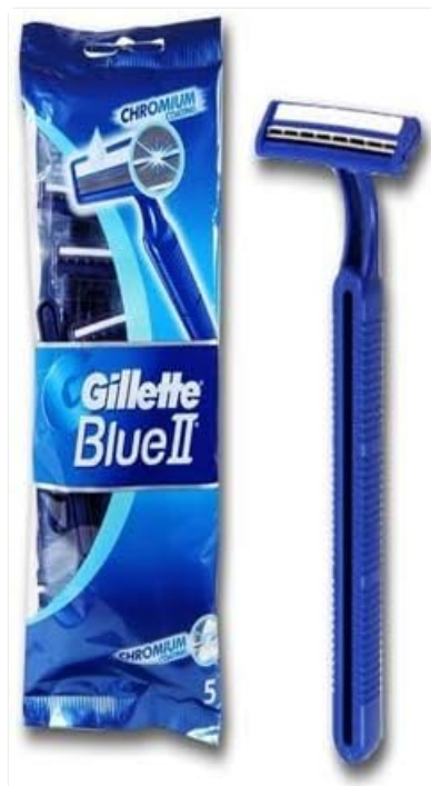
Image 3.1: Razor and packaging. This image shows a single Gillette 2 disposable razor next to its individual packaging, illustrating how the product is presented.