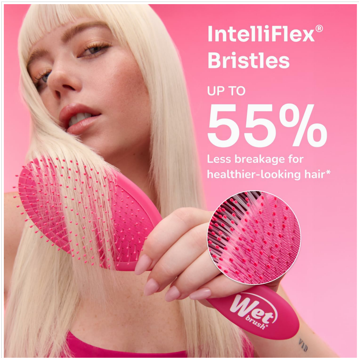
Figure 3: Detail of the IntelliFlex bristles designed for gentle detangling.