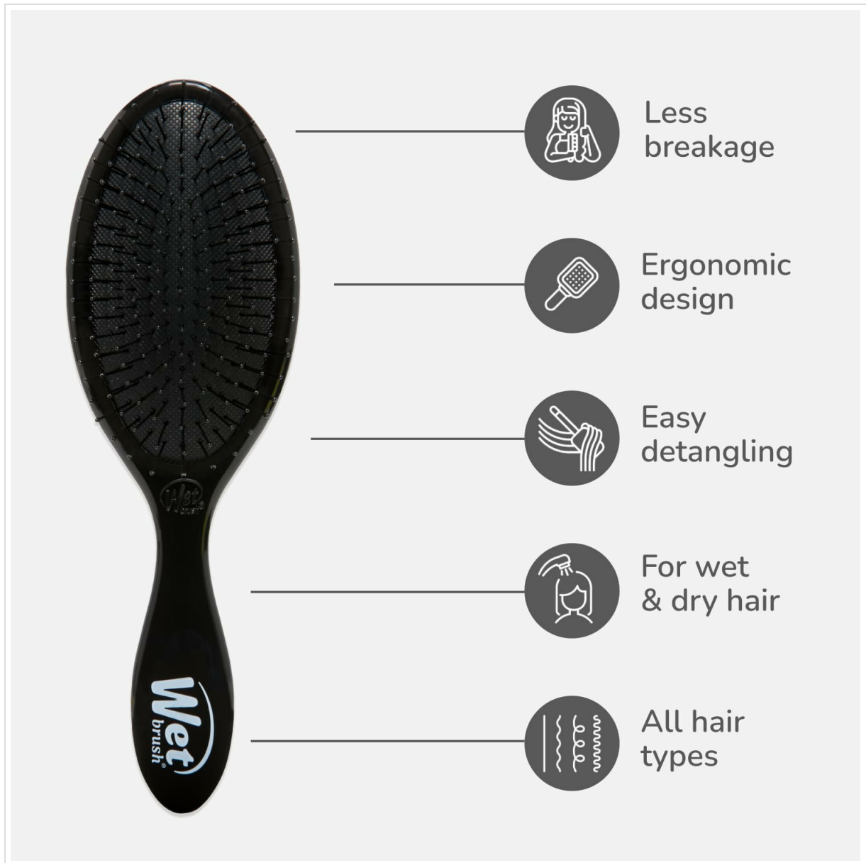
Figure 2: Visual representation of the brush's key features.