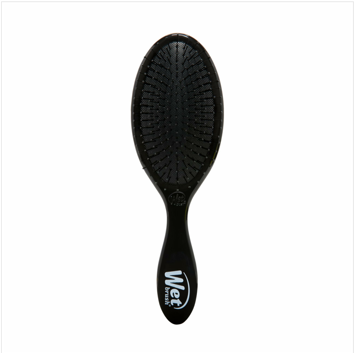
Figure 1: Wet Brush Original Detangler Hair Brush, Classic Black.