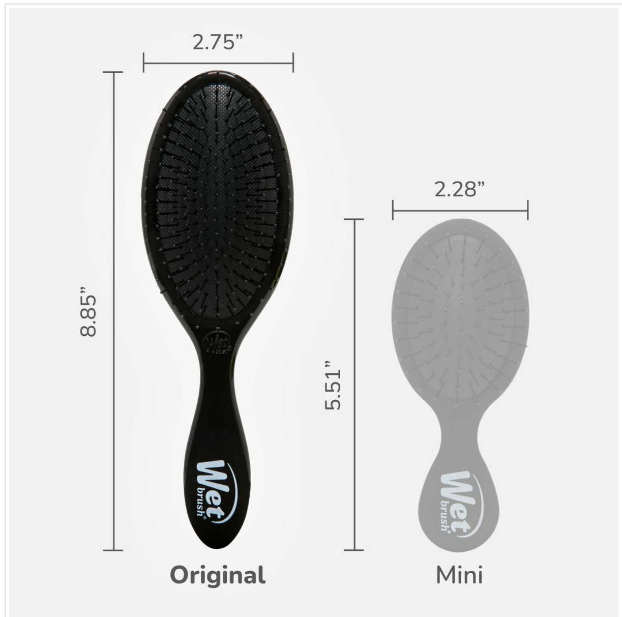
Figure 5: Size comparison between the Original Detangler and Mini Detangler.