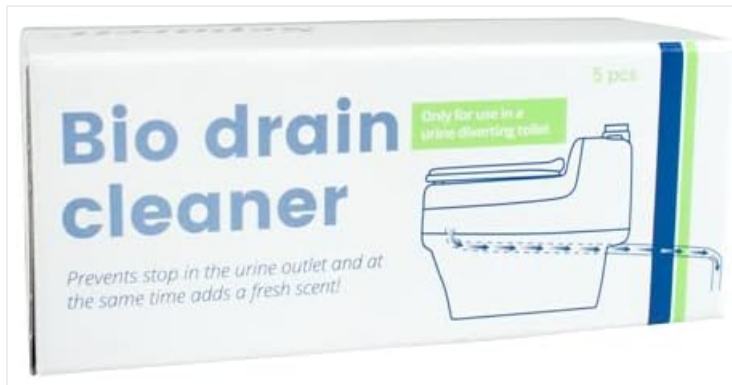
Image: Separett Bio-Drain Cleaner 5-pack box, showing the product packaging with English labeling.

The primary benefits of using Bio-Drain Cleaner Tablets include preventing crystallization, ensuring suitability for all urine-separating toilets, and extending the lifespan of the urine drain.