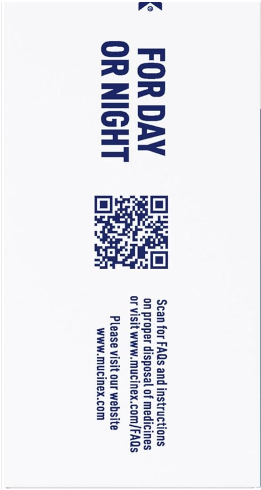
Image: Side panel of the Mucinex packaging, displaying a QR code and URL for product FAQs and proper disposal instructions.