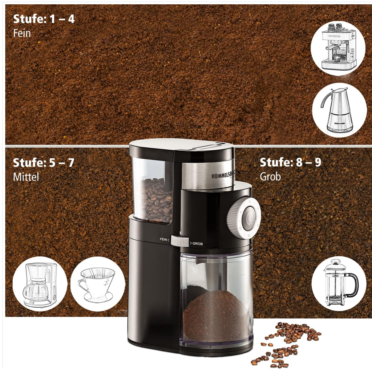
Image: Visual guide to grind settings and their recommended uses.