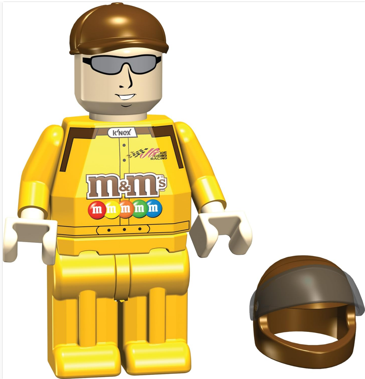
Image: A detailed view of the K'NEXman figure, representing Kyle Busch, wearing his M&M's team uniform and sunglasses, with his helmet placed beside him.

For detailed visual guidance, refer to the full-color step-by-step instructions included in your K'NEX set.