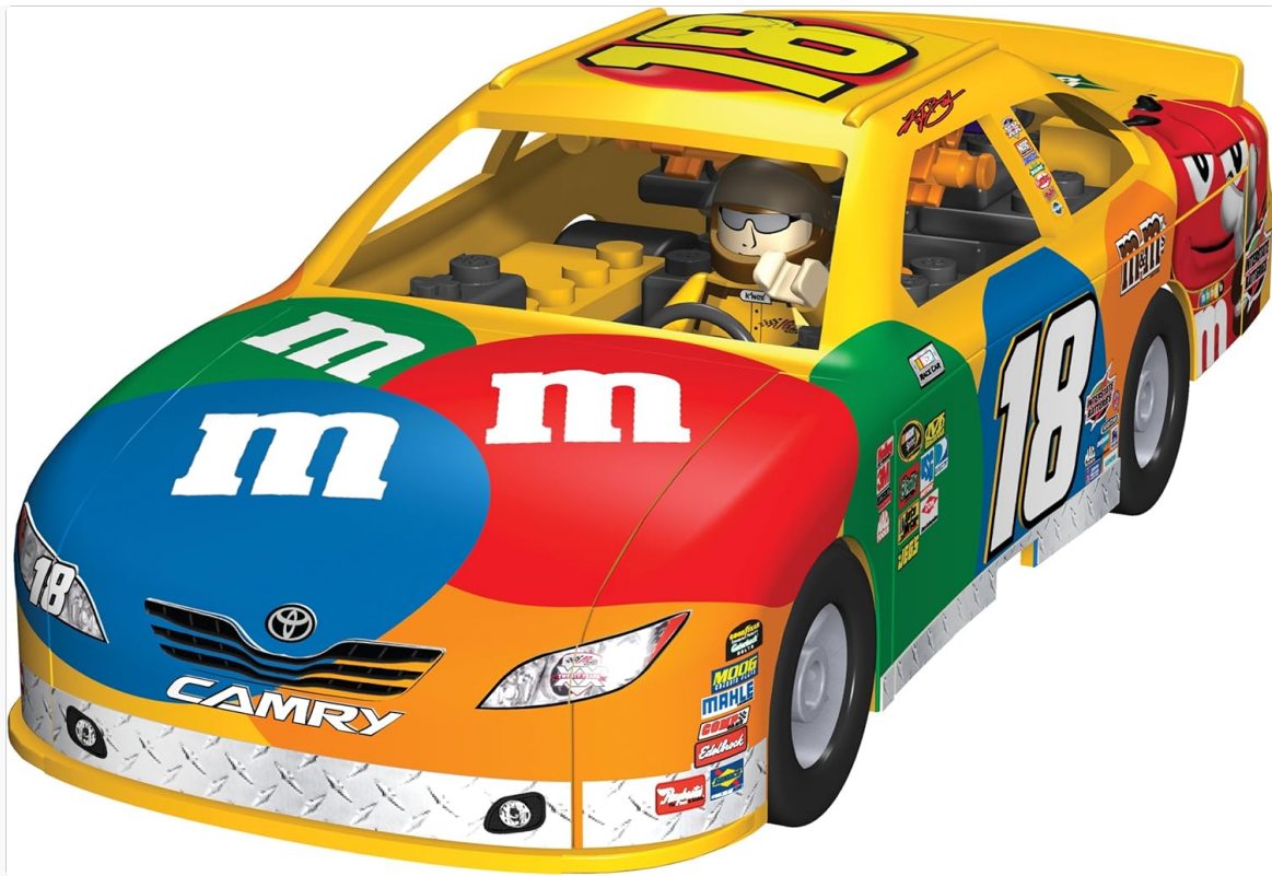
Image: The fully assembled K'NEX NASCAR #18 M&M's Car, viewed from the front-right, showcasing its complete design and applied decals.