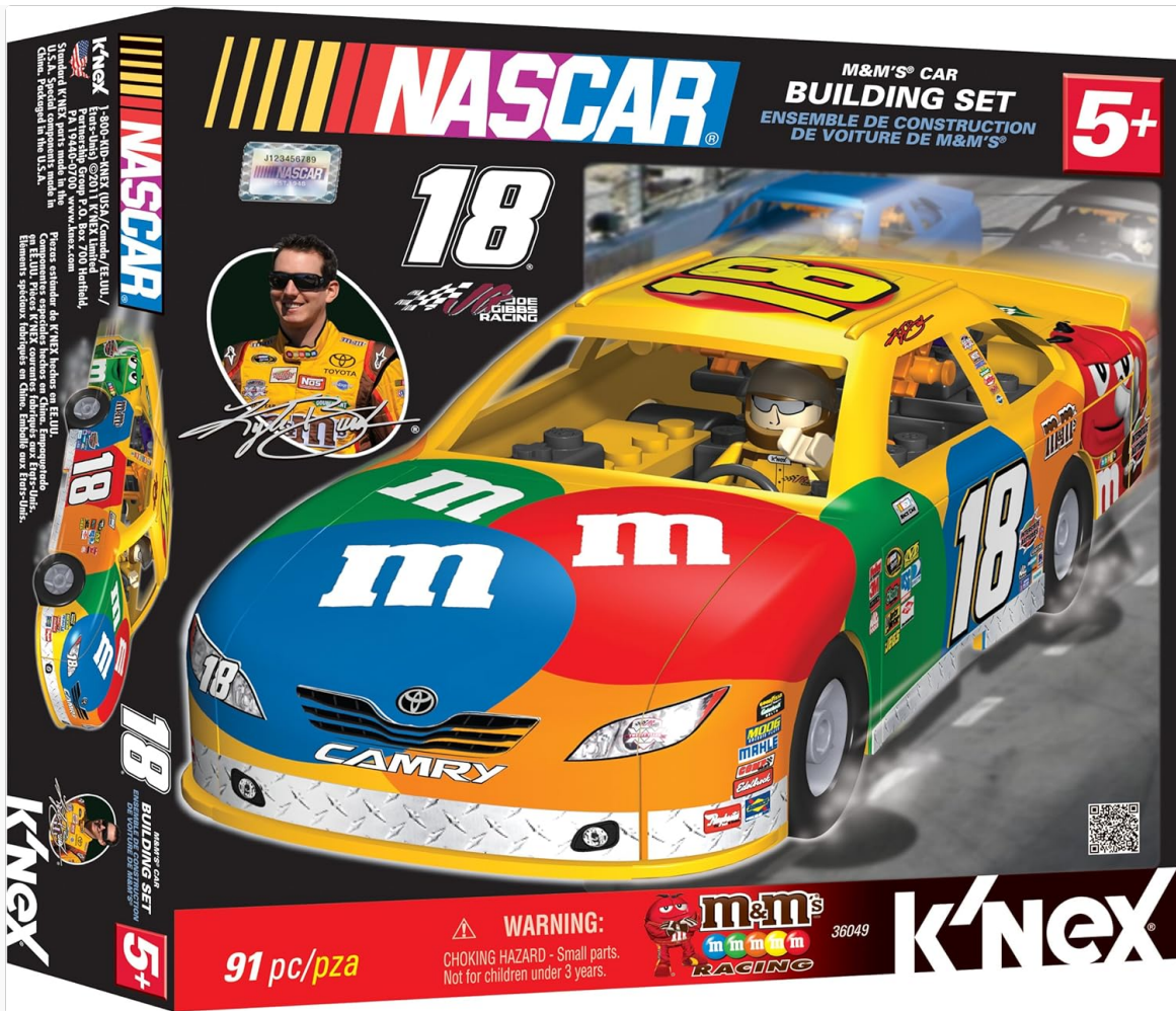
Image: The product box, showing the assembled car, Kyle Busch, and the K'NEX logo. This image represents the complete set as packaged.