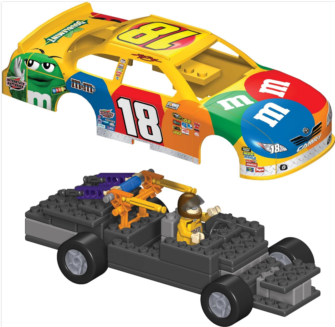
Image: The K'NEX NASCAR car body shell is shown separately above the assembled chassis, which includes the K'NEXman figure in the driver's seat. This illustrates the two main sub-assemblies before final integration.