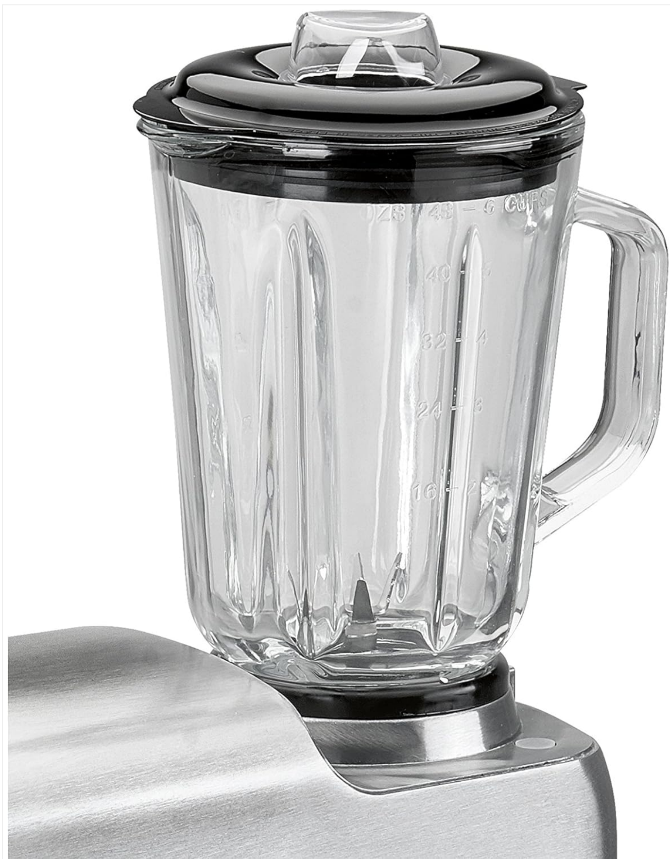
Image: The robust glass blender attachment positioned on the top part of the ProfiCook PC-KM 1004 food processor. It includes a lid with a removable cap for adding ingredients during blending, ideal for smoothies and sauces.