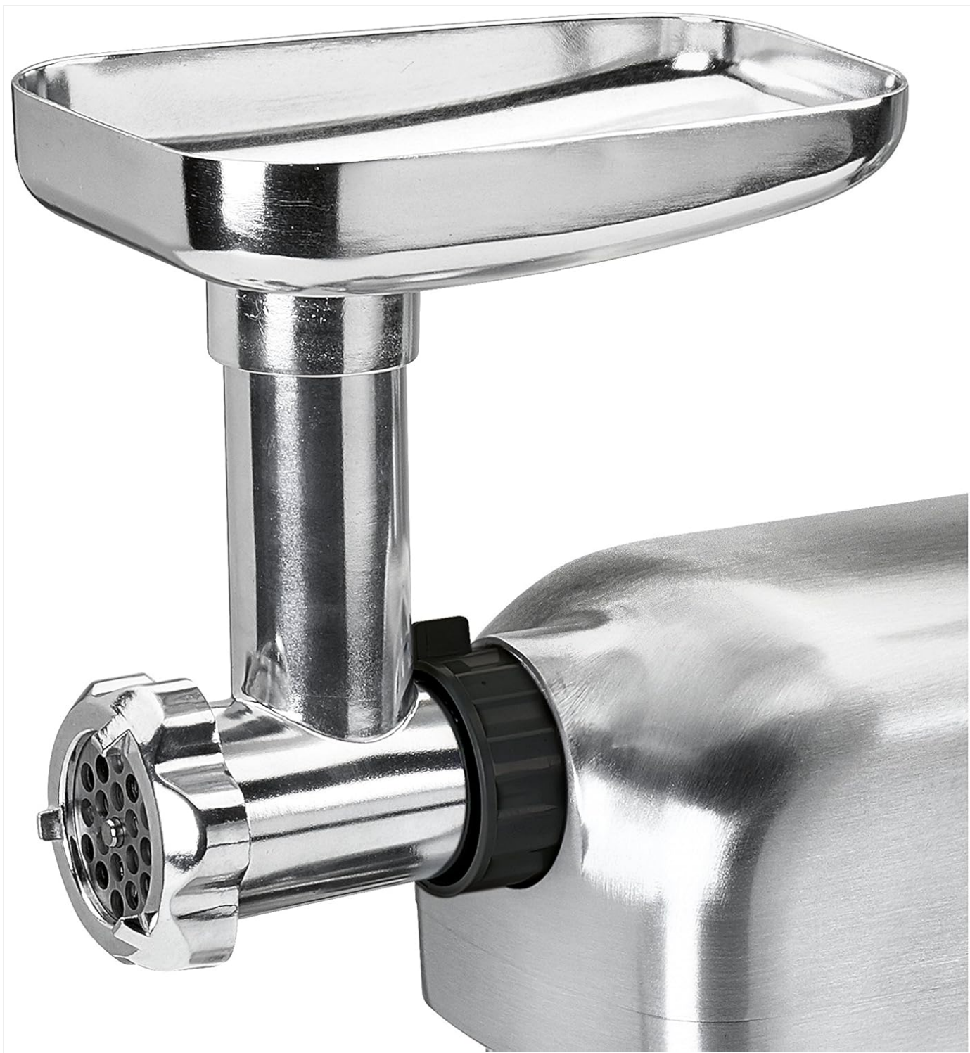
Image: The meat grinder attachment securely mounted on the front port of the ProfiCook PC-KM 1004 food processor. It features a feeding tray, a grinding screw, and a cutting plate, ready for processing meat.