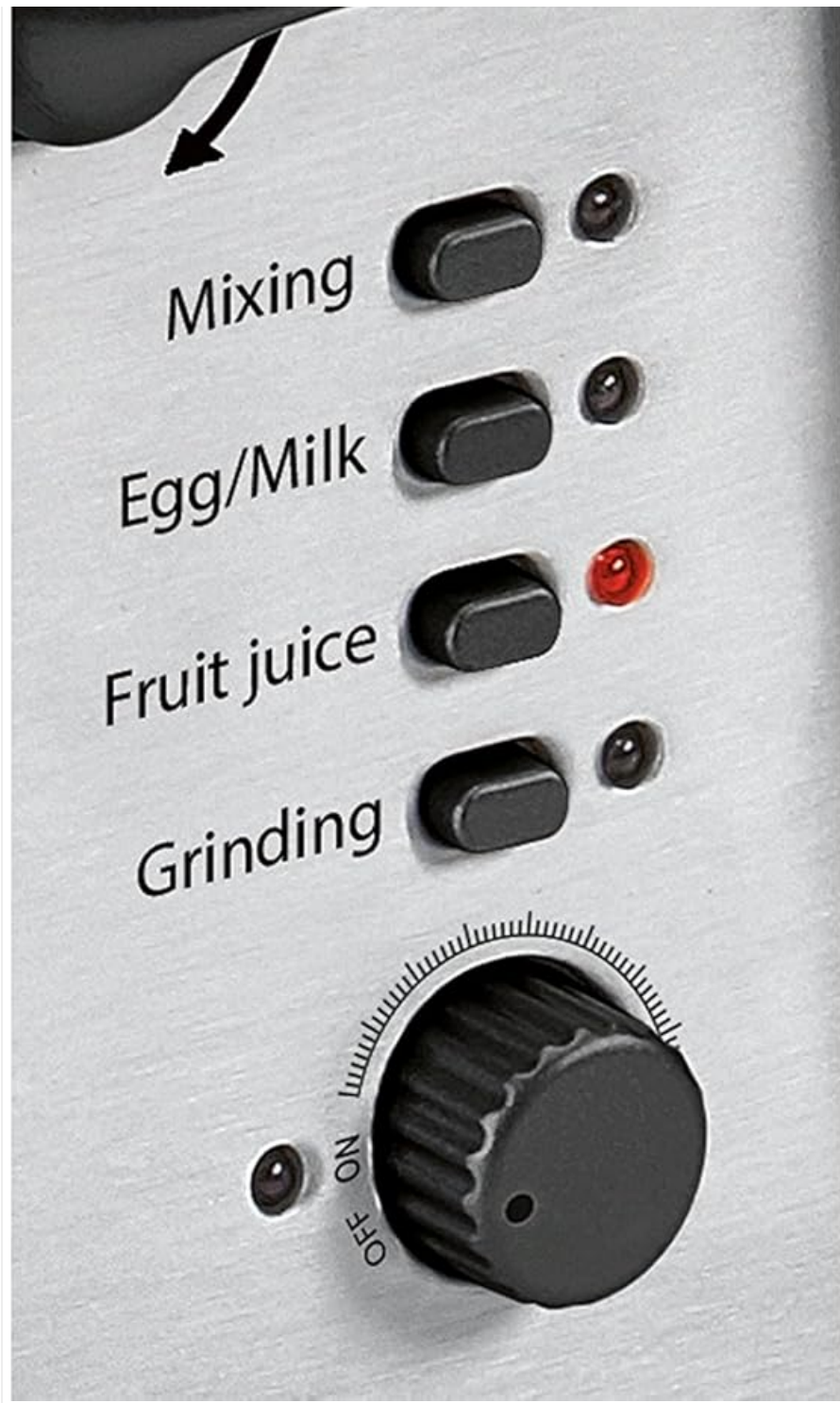
Image: Close-up of the ProfiCook PC-KM 1004 control panel, showing the continuous speed adjustment dial and illuminated buttons for specific functions like Mixing, Egg/Milk, Fruit Juice, and Grinding. The lever for releasing the mixing arm is also visible.

The control panel includes a continuous speed adjustment dial and specific function buttons for optimized performance. The lever allows for easy lifting and lowering of the mixing arm.