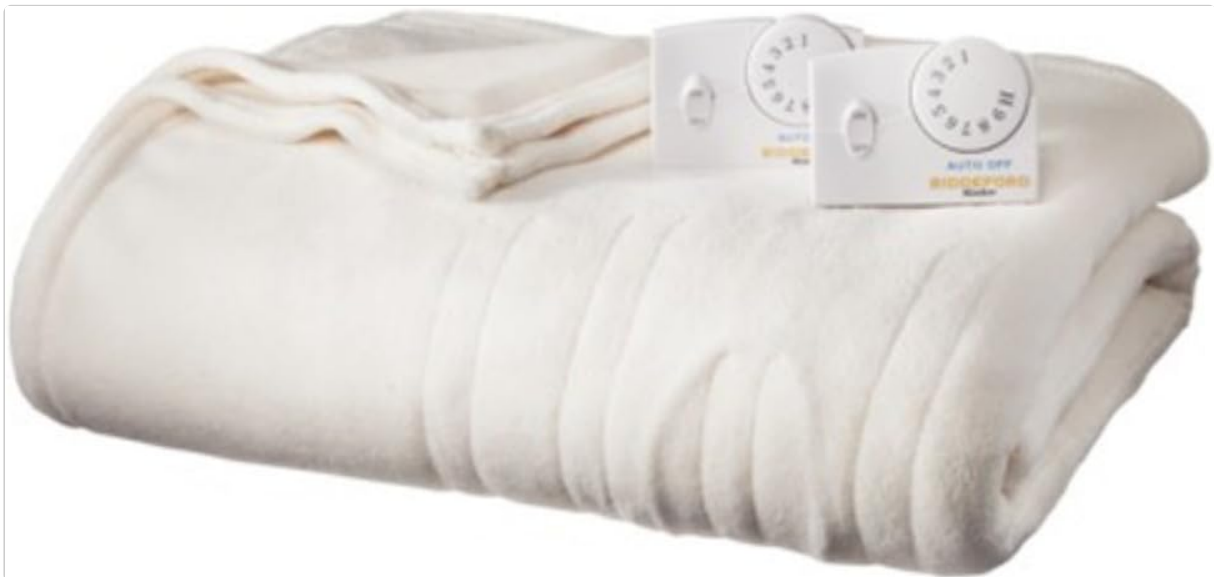
Image: Biddeford Comfort Knit Heated Blanket in natural color, shown with two analog controllers.

Thank you for choosing the Biddeford Blankets Comfort Knit Heated Blanket. This manual provides essential information for the safe and effective use, care, and maintenance of your new heated blanket. Please read all instructions carefully before use and retain this manual for future reference.