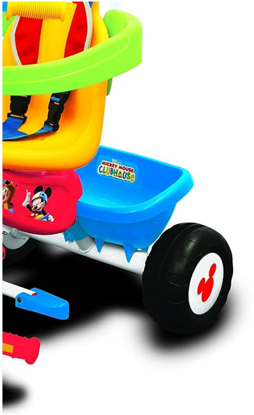
Figure 2: Rear-side view of the Kiddieland Disney Mickey Mouse Clubhouse Push N' Ride Trike with push handle and storage. This image displays the back and side of the trike, showcasing the removable sun-screen, the rigid support seat, the adjustable push handle for adult control, and the rear storage bucket, along with the front basket.