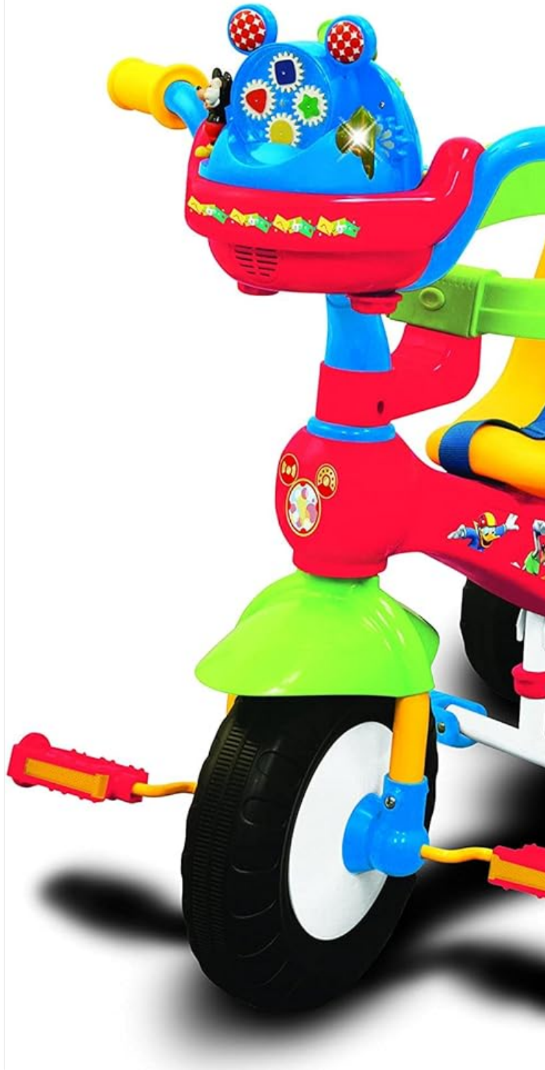
Figure 1: Front-side view of the Kiddieland Disney Mickey Mouse Clubhouse Push N' Ride Trike. This image provides an overall perspective of the product's design, highlighting its vibrant colors, pedals, front wheel, and the interactive console.