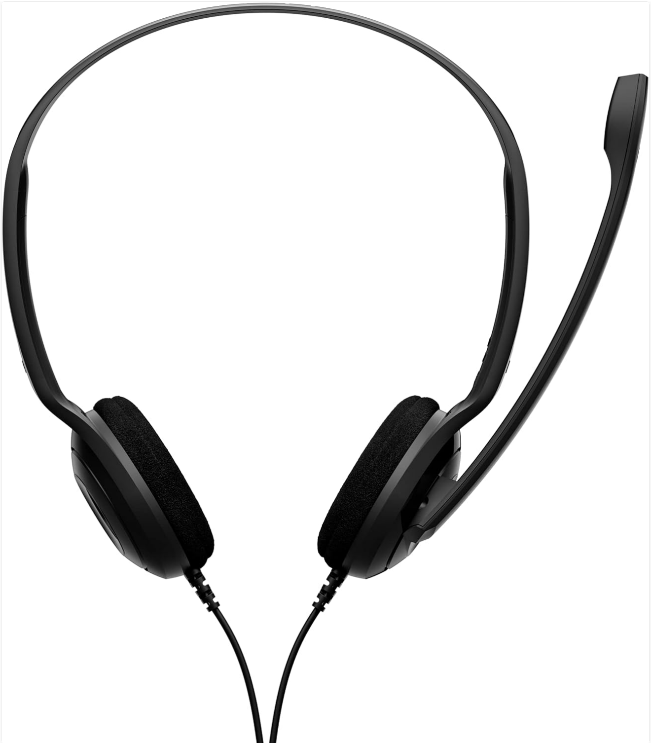
Figure 2.1: Front view of the EPOS PC 8 USB Headset.

The image above shows the EPOS PC 8 USB Headset from the front, highlighting its lightweight design and on-ear speakers. The microphone boom is visible on the left earcup.