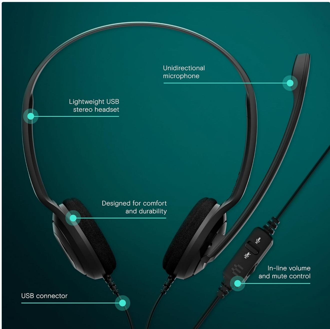
Figure 3.1: Key components of the EPOS PC 8 USB Headset, including the unidirectional microphone, lightweight design, USB connector, and in-line volume and mute control.

4. Adjust Microphone Position: Position the flexible microphone boom so that the microphone is approximately 1-2 inches (2.5-5 cm) from your mouth for optimal voice pickup.