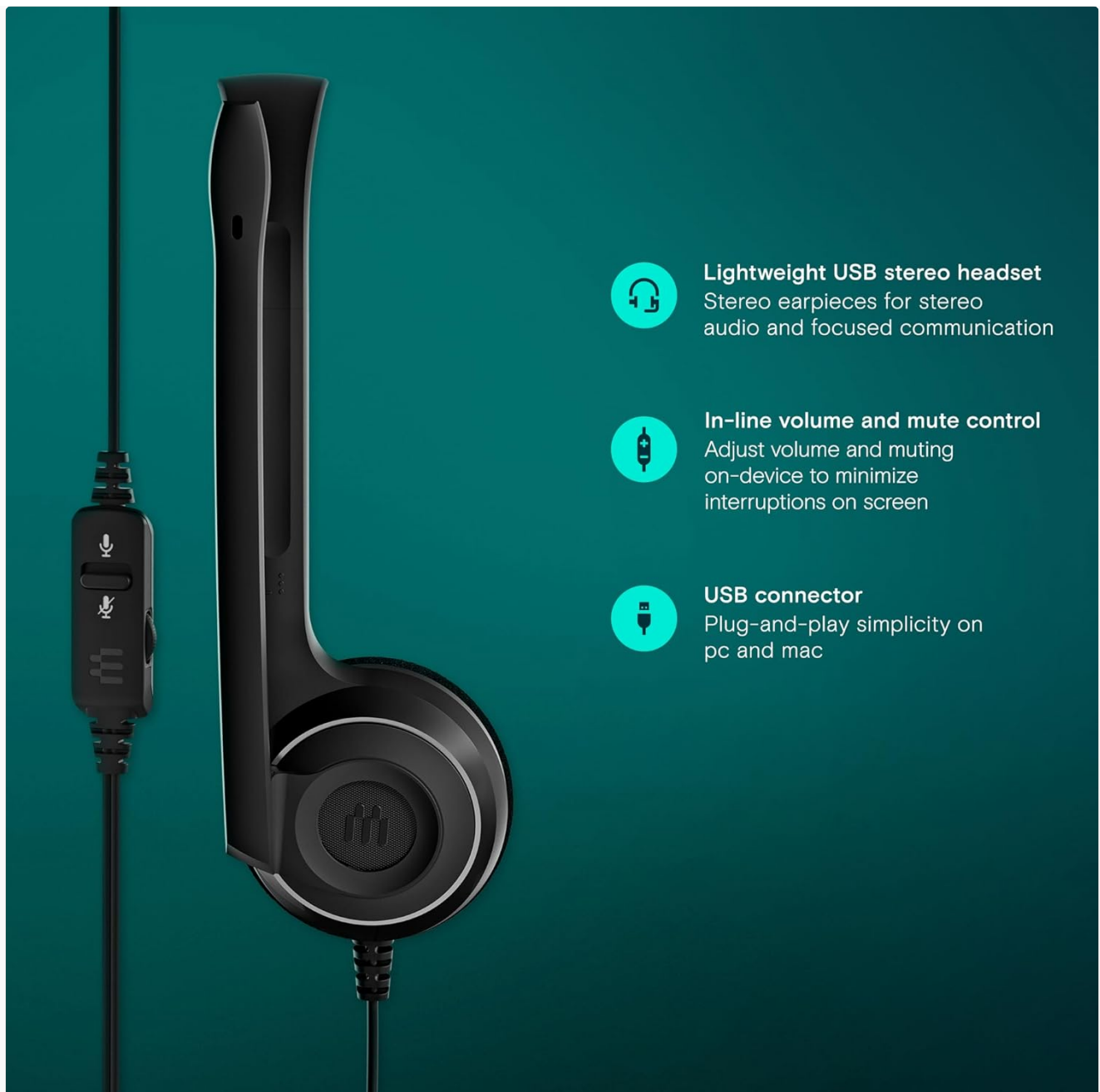
Figure 3.2: Detailed view of the EPOS PC 8 USB Headset's features, emphasizing the lightweight stereo earpieces, in-line volume and mute control, and USB connector for PC and Mac compatibility.

The image provides a closer look at the headset's design, highlighting the lightweight stereo earpieces for comfortable audio, the in-line control for adjusting volume and muting the microphone directly on the device, and the USB connector for simple plug-and-play setup on both PC and Mac.