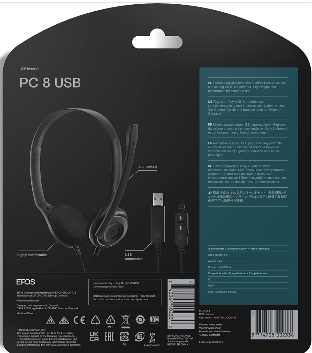
Figure 2.2: Back view of the EPOS PC 8 USB Headset packaging, detailing features and specifications.

This image displays the back of the headset packaging, detailing key features such as its lightweight design, USB connection, and in-line controls. Technical data and compatibility information are also visible.