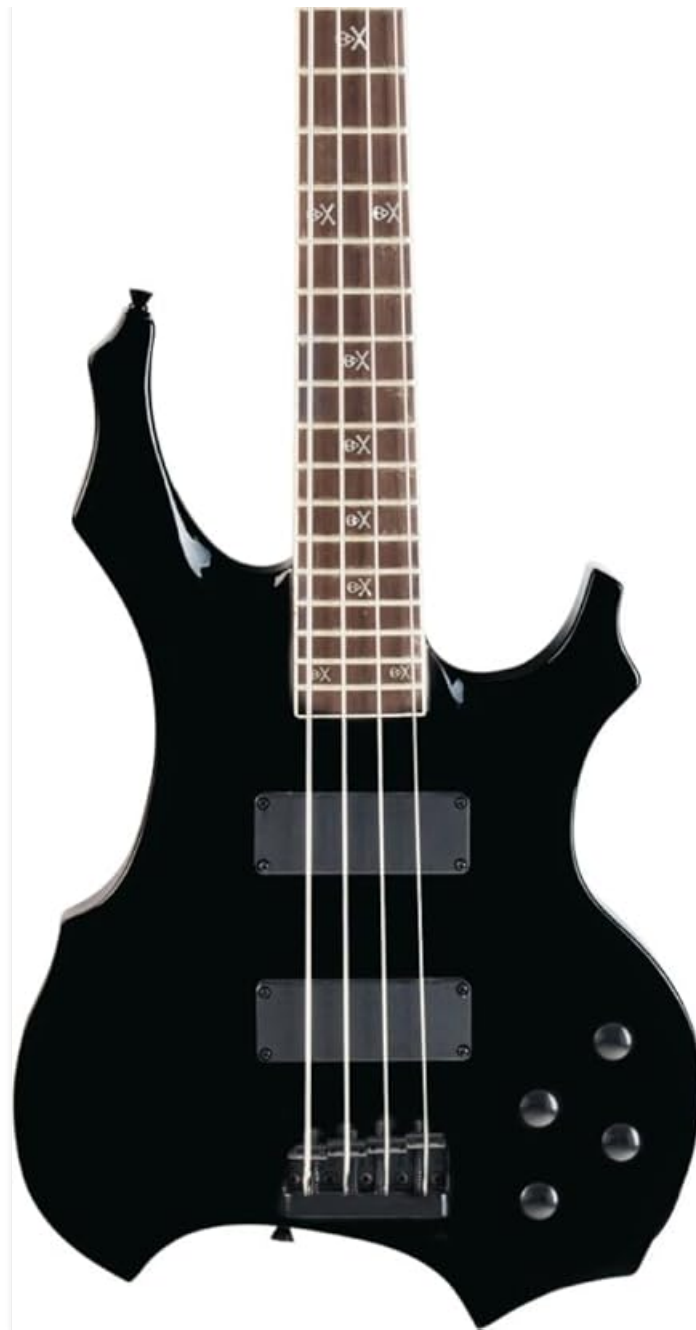
Figure 1: Front view of the Rocktile Pro BB104-B BattleBone Electric Bass Guitar.

The Rocktile Pro BB104-B BattleBone features a unique body shape, a basswood body, a maple neck, and a rosewood fretboard with distinctive skull-shaped inlays. It is equipped with two Humbucker pickups, offering a versatile sound controlled by two volume and two tone knobs. The instrument comes with dark black hardware and 24 frets, providing a comfortable playing experience with a scale length of 87 cm and a nut width of 43 mm. Its total weight is approximately 3.7 kg, ensuring good balance and playability.