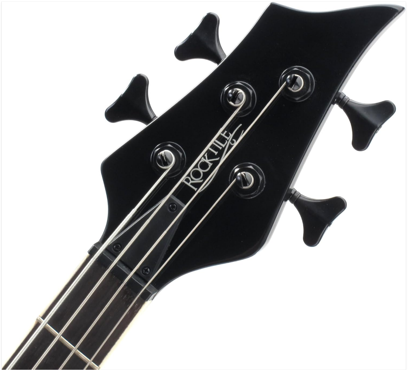
Figure 3: Headstock with tuning pegs and Rocktile logo.