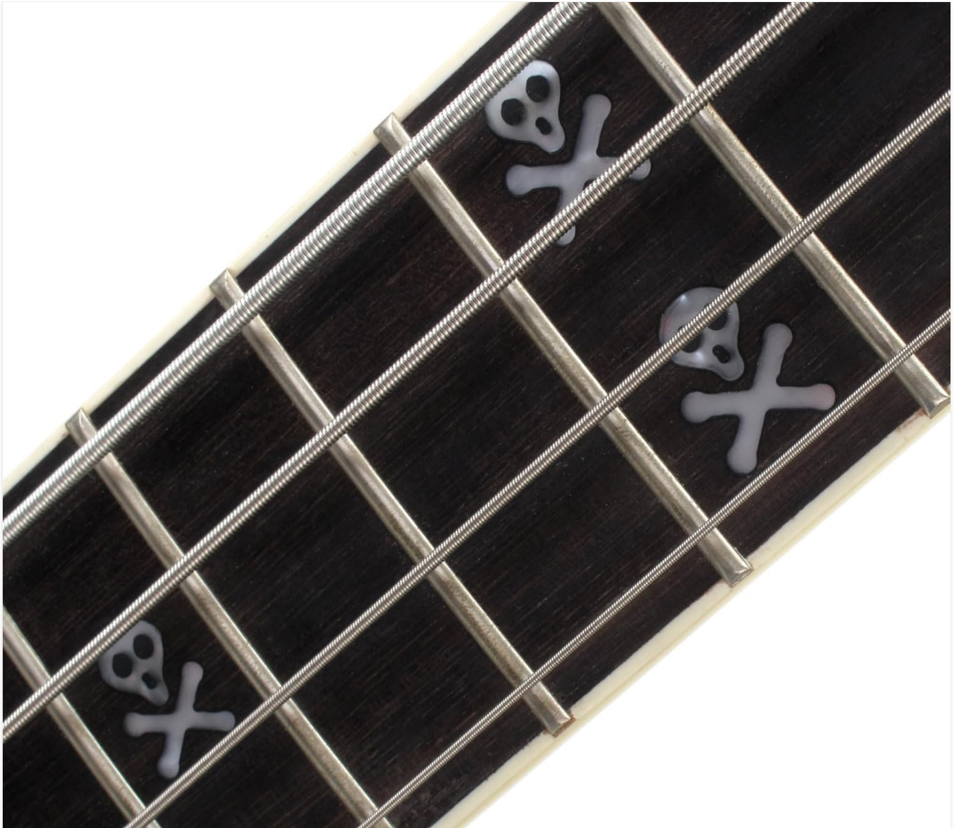
Figure 4: Fretboard detail showing skull-shaped inlays.

The bass guitar is designed for dynamic playing across various musical genres. Its balanced weight distribution ensures comfortable playing whether seated or standing. Experiment with different pickup combinations and tone settings to find your desired sound. The 24 frets and rosewood fretboard with skull inlays provide a smooth playing surface.