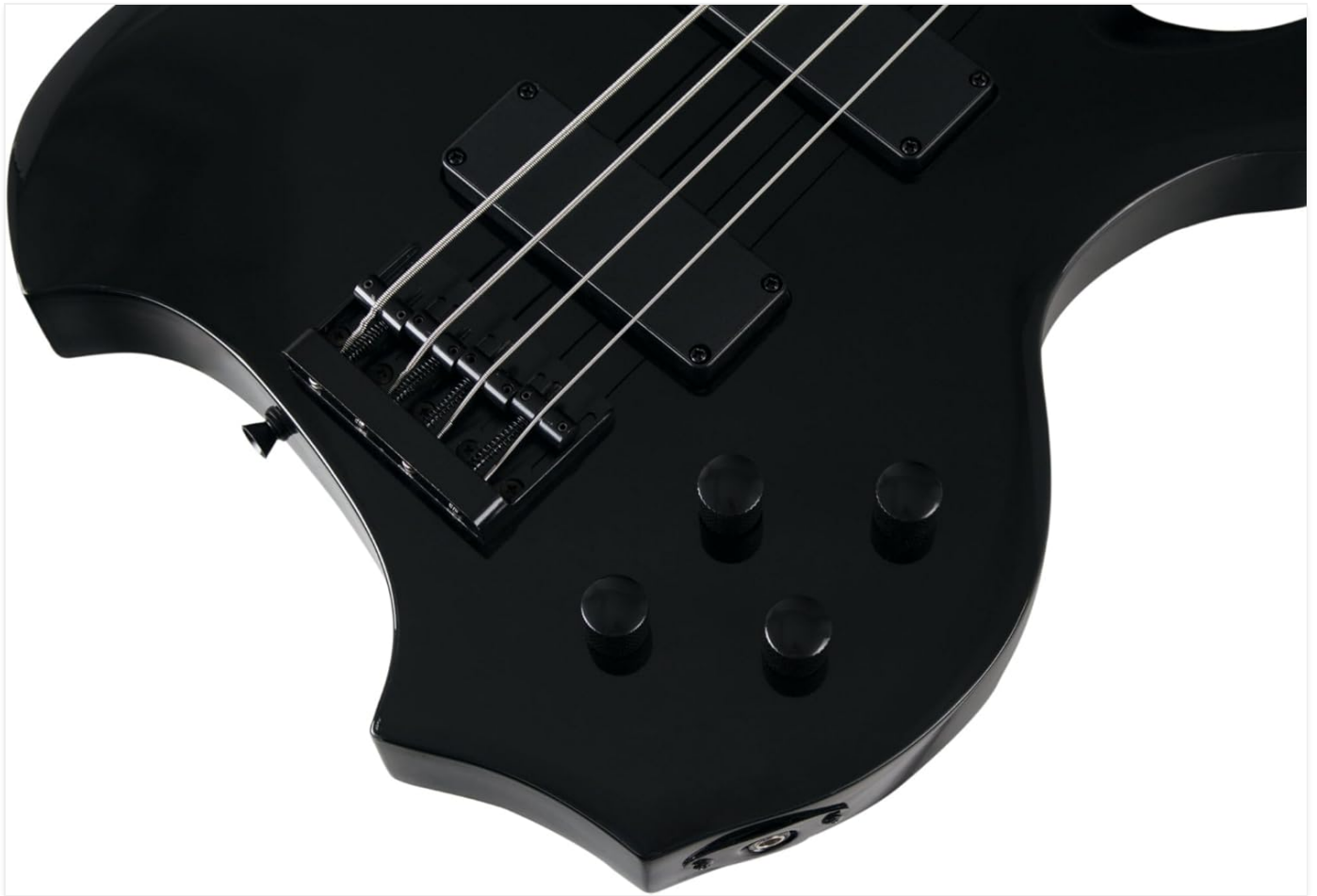
Figure 2: Detail of the control knobs and output jack.

amplifier is turned off or at a low volume before connecting or disconnecting the cable to prevent sudden loud noises.