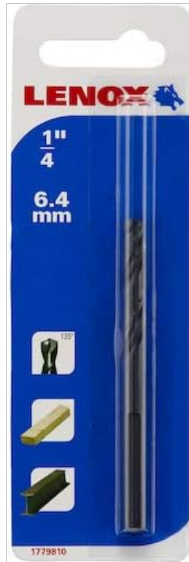
Image 4: The Lenox 1779810 Pilot Drill Bit in its retail packaging, indicating its 1/4-inch size.