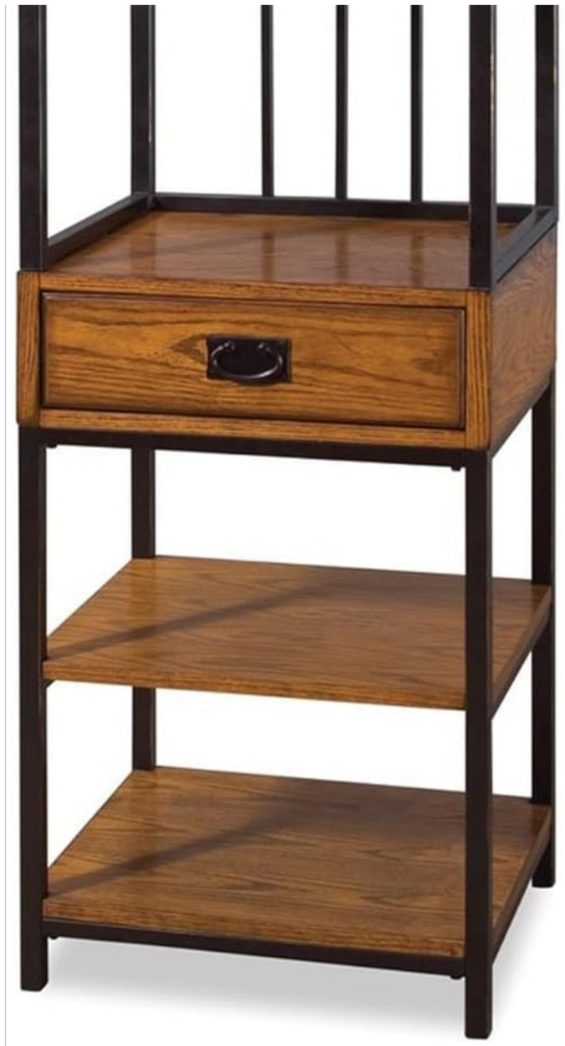
Figure 1.1: The Home Styles Modern Craftsman Distressed Oak Gaming Tower, showcasing its distressed oak finish and black metal frame.