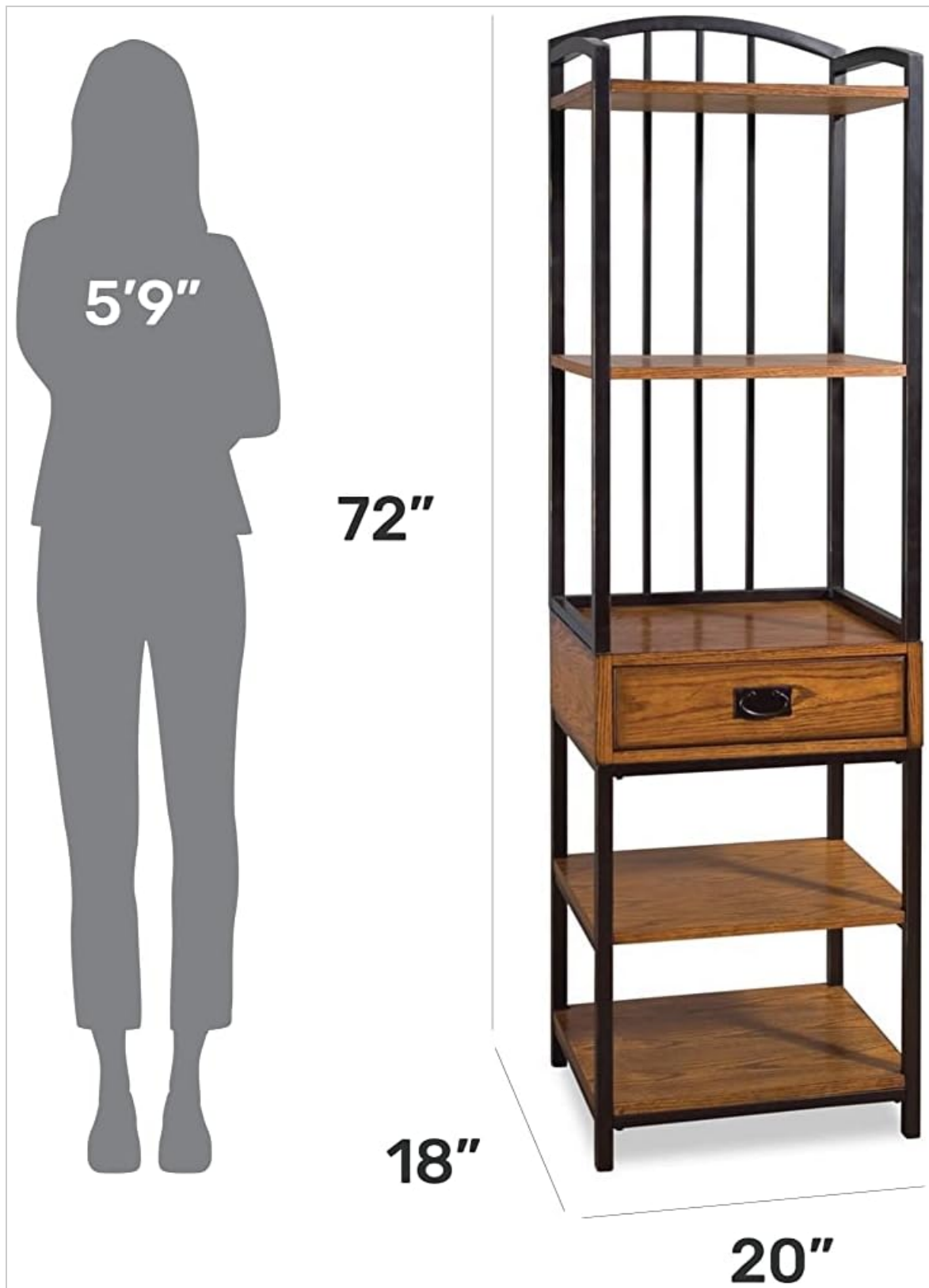
Figure 4.2: Detailed view of the drawer and lower shelves, highlighting the craftsmanship and storage options.