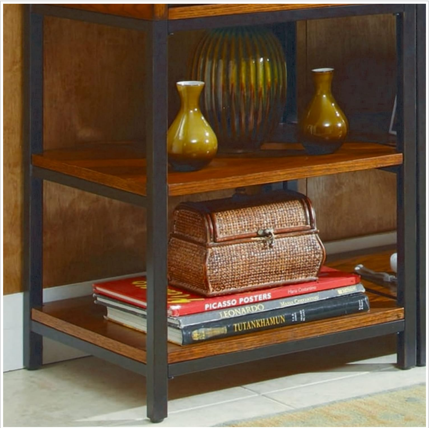
Figure 6.1: The gaming tower in use, displaying various items on its shelves and within the drawer.