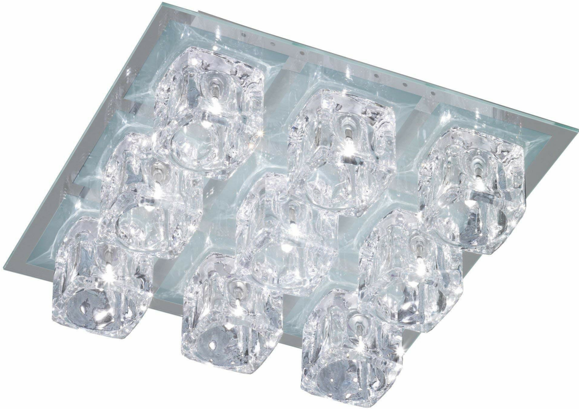
Figure 1: WOFI 992910060000 LED RGB Ceiling Light showcasing its color-changing capabilities. The fixture features a square glass base with nine crystal-like light elements.