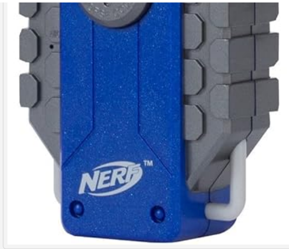
Figure 2: Side view highlighting the On/Off switch.