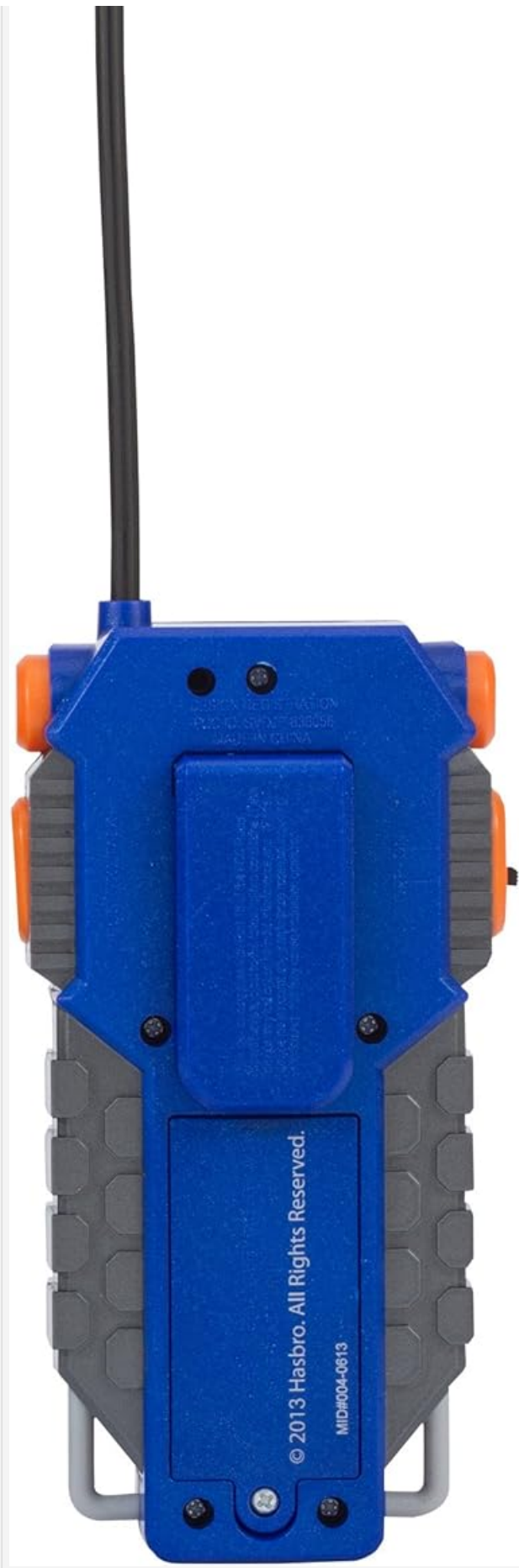
Figure 1: Rear view showing the battery compartment and belt clip.