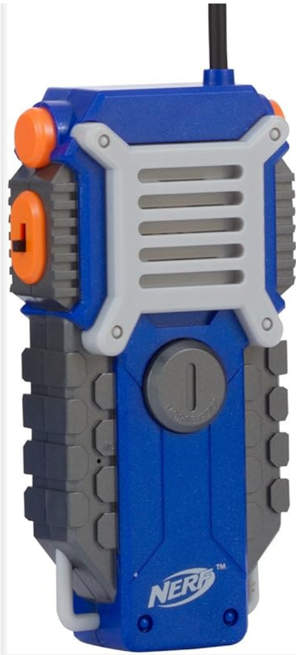
Figure 3: Side view highlighting the Push-to-Talk button.