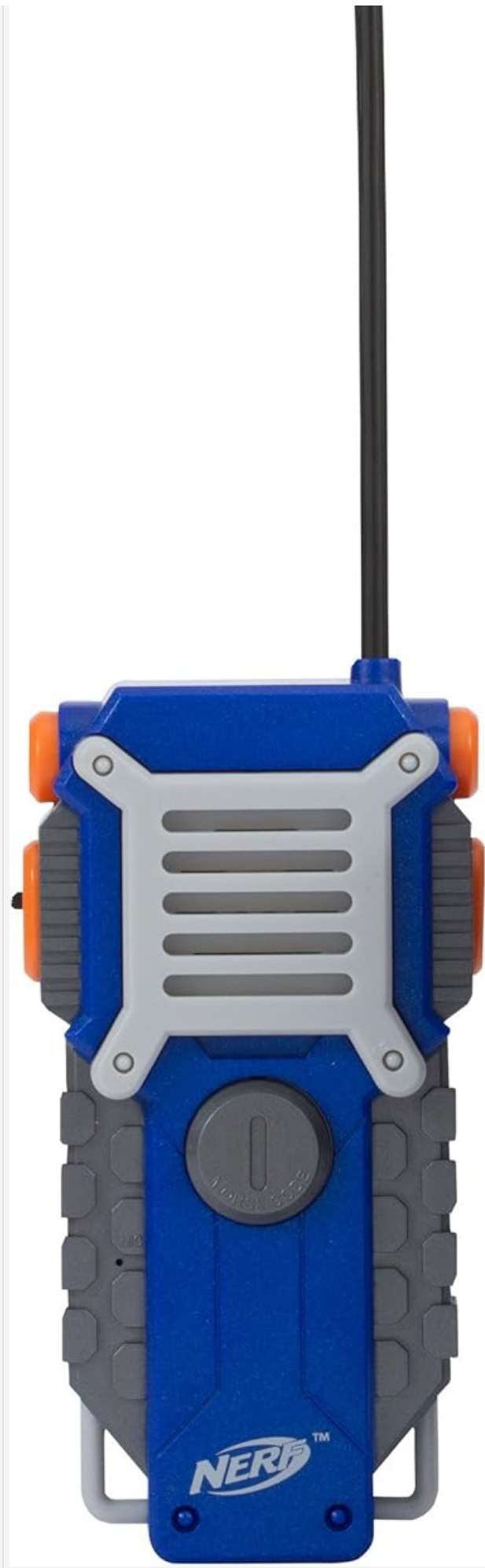
Figure 4: Front view showing the Morse code button.