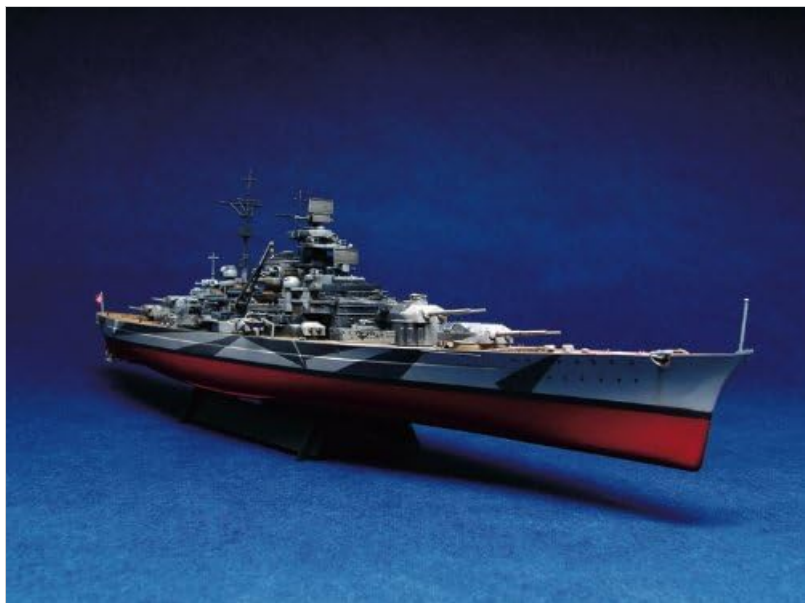
Figure 5.3: Side profile of the completed model, illustrating the full hull and camouflage pattern.