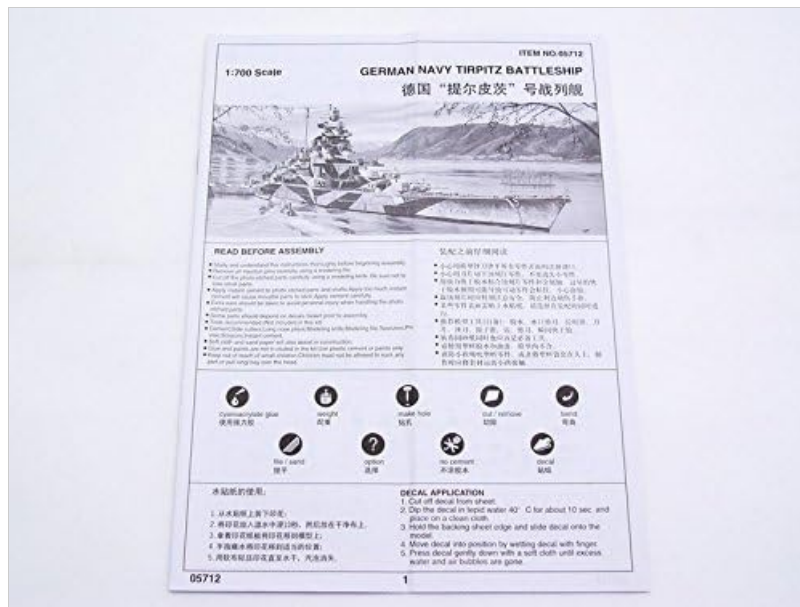
Figure 3.1: Example of the instruction manual cover, showing assembly symbols and decal application guide.

The kit also includes a decal sheet for markings. Handle decals carefully to avoid damage.