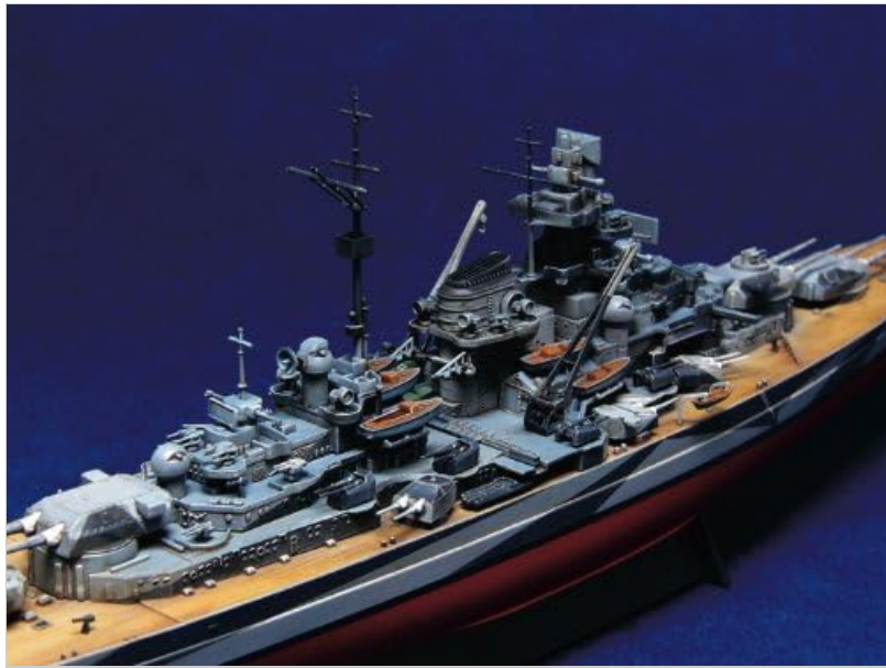
Figure 5.1: A detailed view of the completed model, showcasing the intricate deck structures and weaponry.