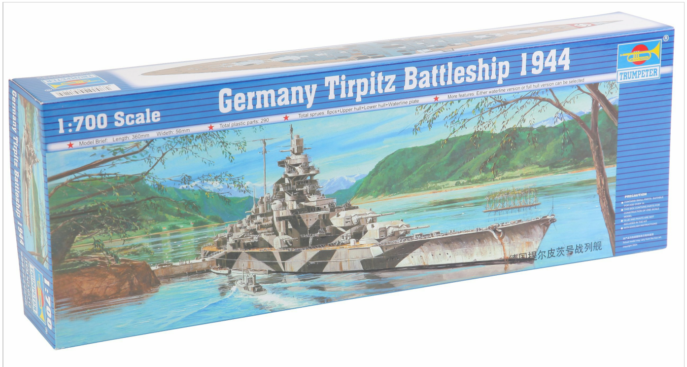
Figure 4.1: Box art illustration of the Tirpitz Battleship, depicting its camouflage and overall appearance. This image serves as a visual guide for the completed model.

Note: Some parts, particularly small anti-aircraft cannons, are very tiny and require precision. Using fine-tipped tweezers and a magnifying glass is recommended for these components.