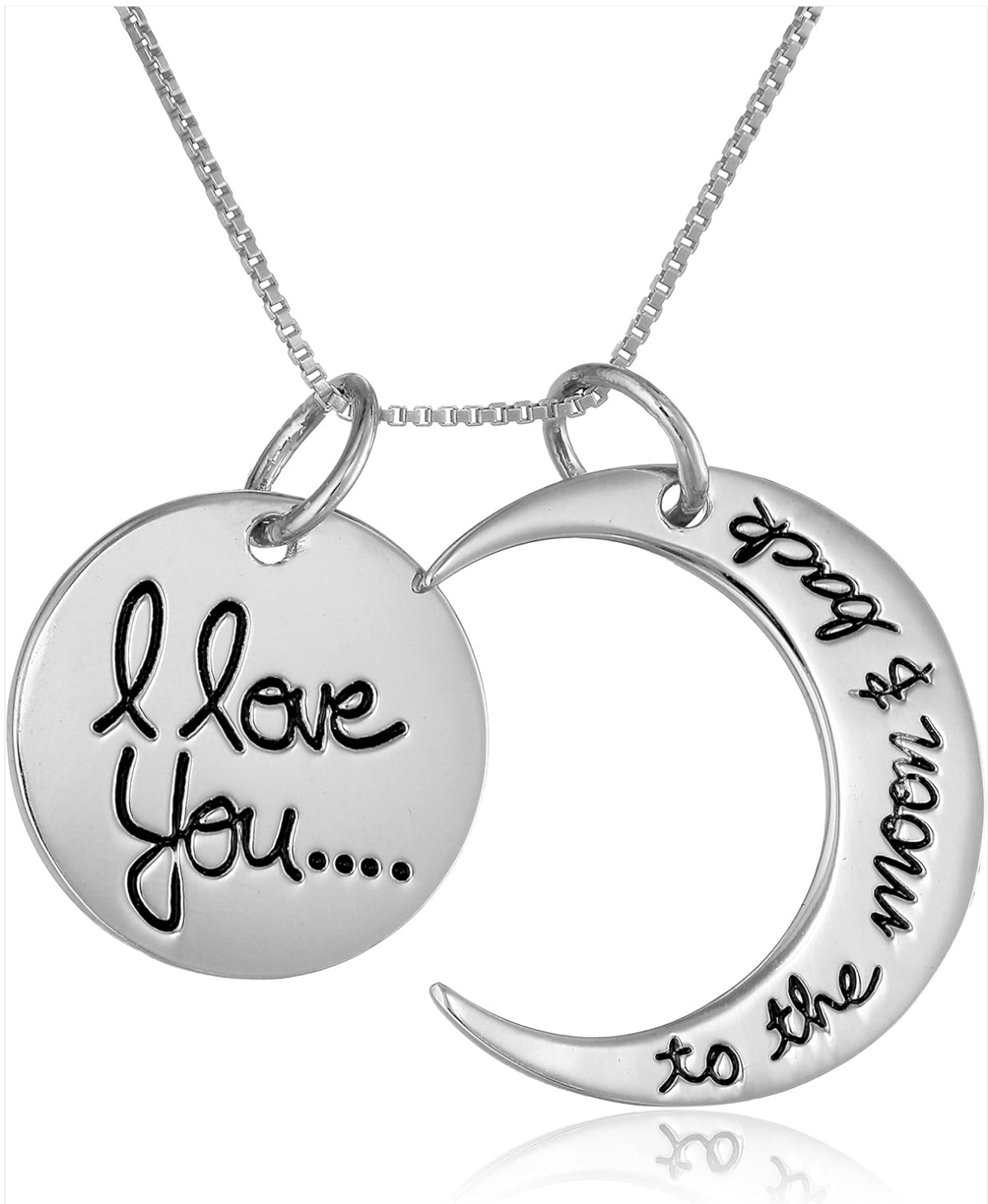
Figure 3: The two-piece pendant with the circular disc and crescent moon separated, showcasing the full engraving.