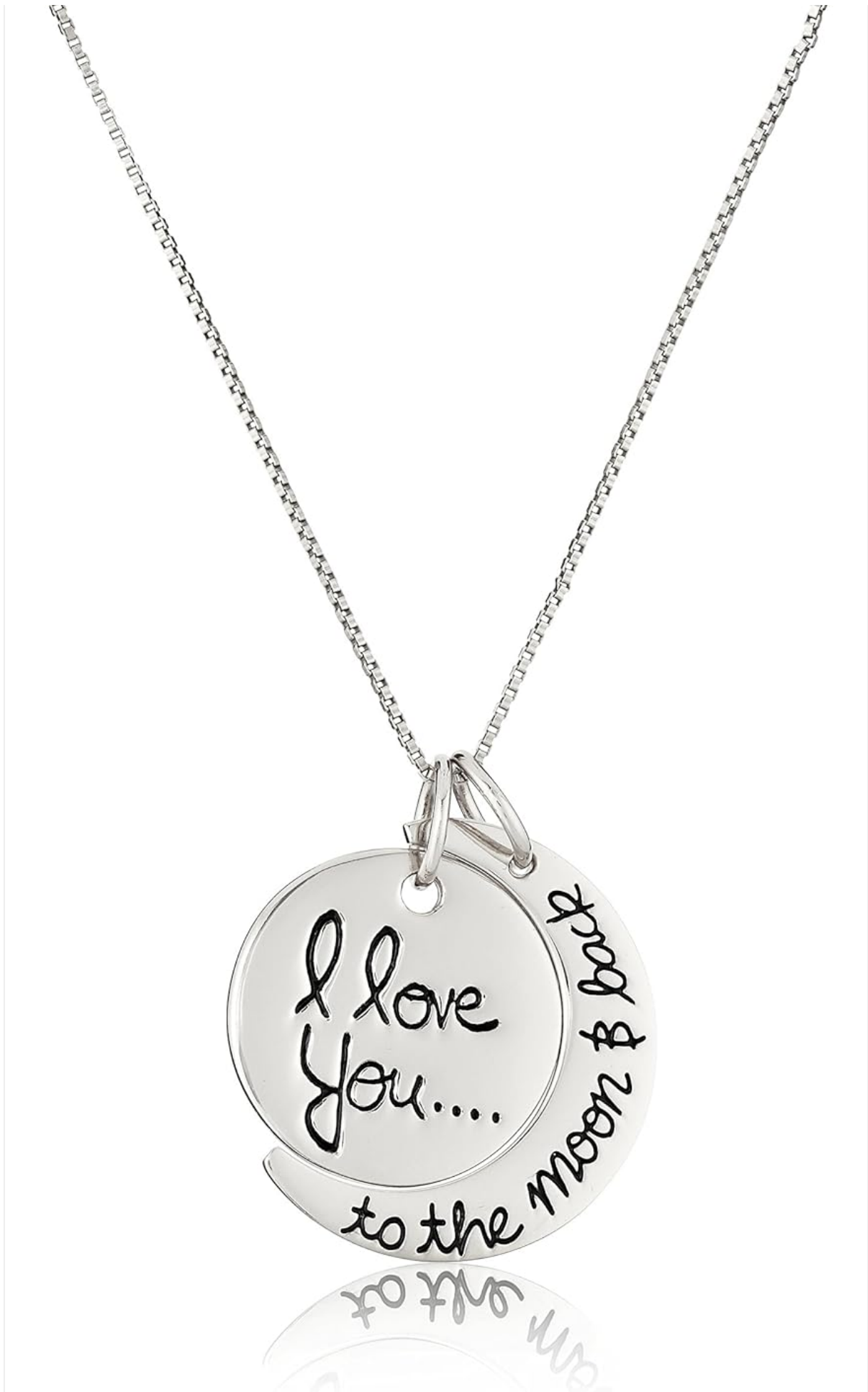
Figure 1: The Amazon Essentials Sterling Silver Pendant Necklace with the circular disc and crescent moon pendant. The engraving "I love you..." is on the disc, and "to the moon & back" is on the moon.