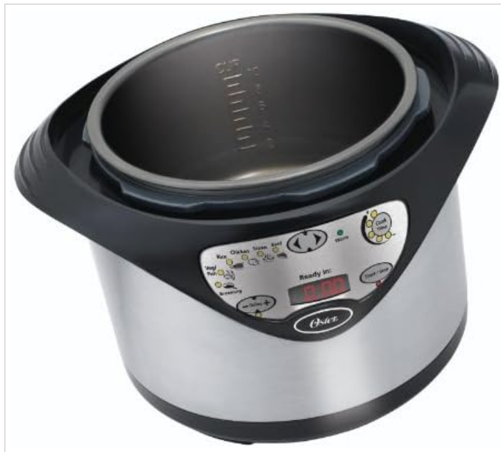
Figure 2: Top-down view of the Oster FPSTPC4801 Electric Pressure Cooker with the lid removed, revealing the non-stick inner cooking pot.