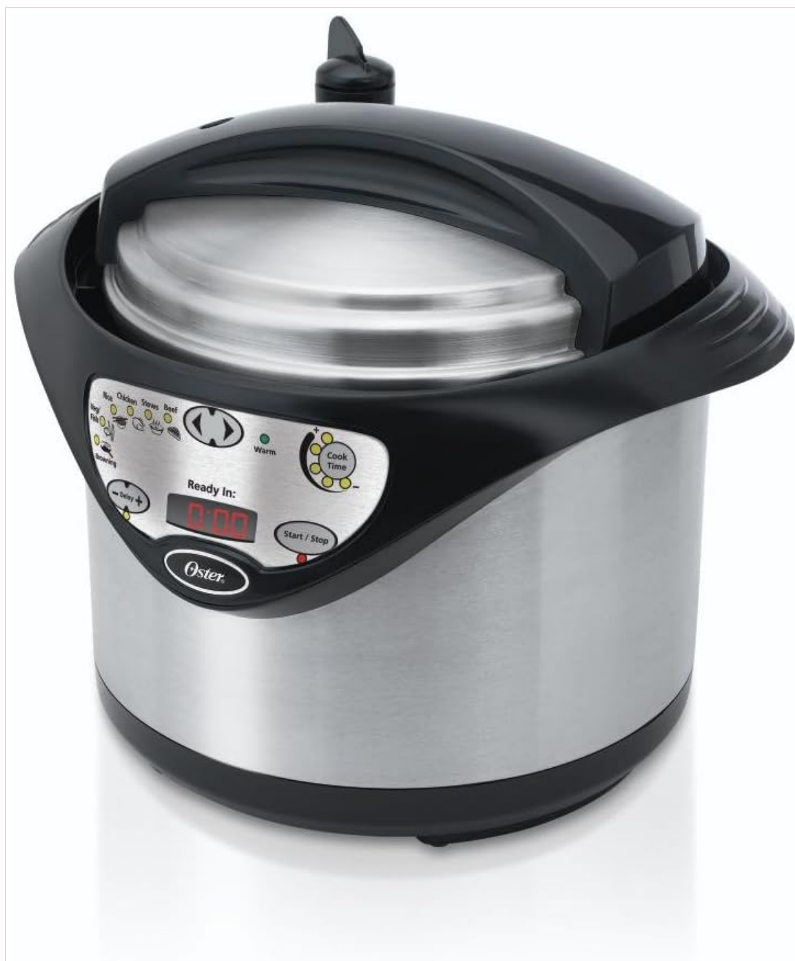
Figure 1: Front view of the Oster FPSTPC4801 Electric Pressure Cooker, showing the control panel and lid.

The Oster FPSTPC4801 Electric Pressure Cooker is designed to simplify meal preparation by cooking food quickly and efficiently under pressure. It features a 5-quart capacity, multiple cooking programs, and a non-stick inner pot for easy cleaning.