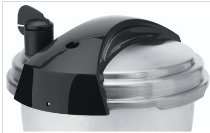
Figure 3: Detailed view of the pressure cooker lid, highlighting the steam release valve and handle mechanism.