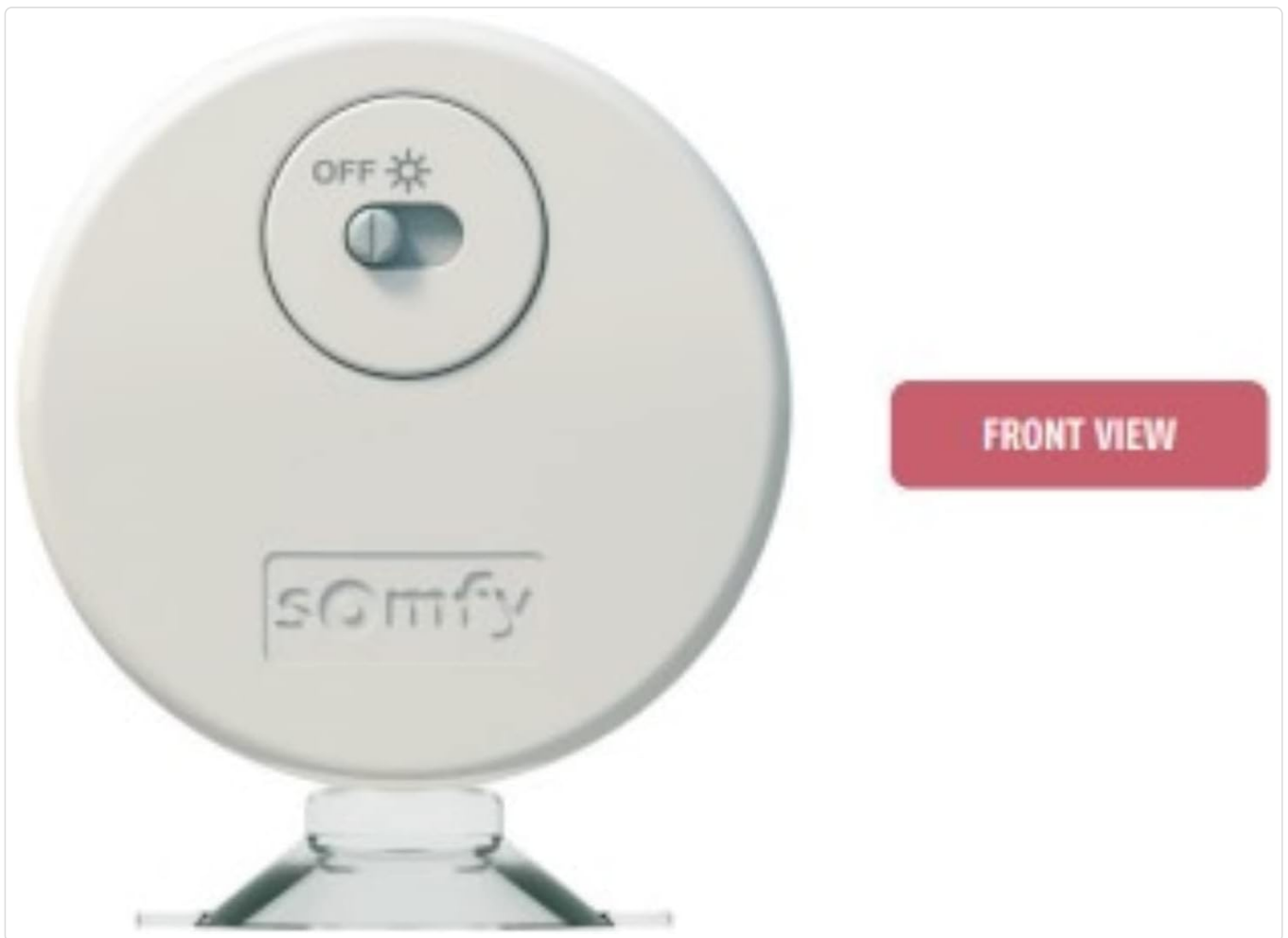
Front View: This image shows the front of the Somfy Sunis sensor, featuring the Somfy logo and the ON/OFF switch with a sun icon. This is the primary side visible during normal operation.