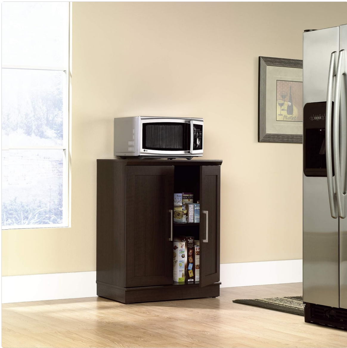
Figure 2.1: Cabinet Dimensions (L: 29.61" x W: 17.01" x H: 37.40").