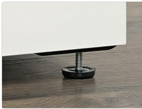
Figure 5.1: Adjustable base leveler for stability.