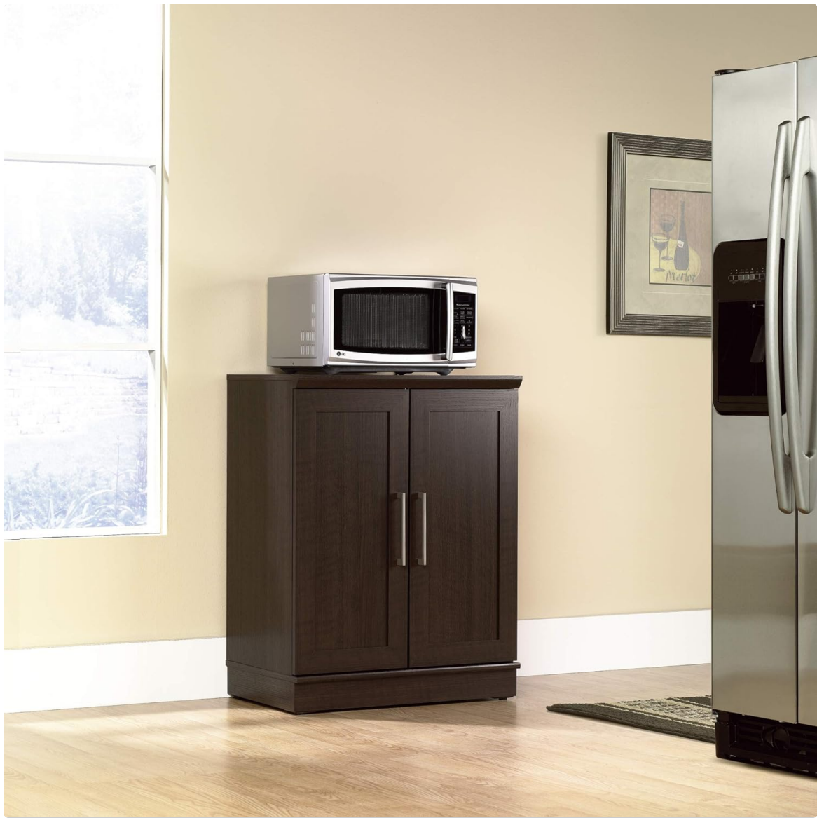
Figure 3.3: Cabinet used as a microwave cart.