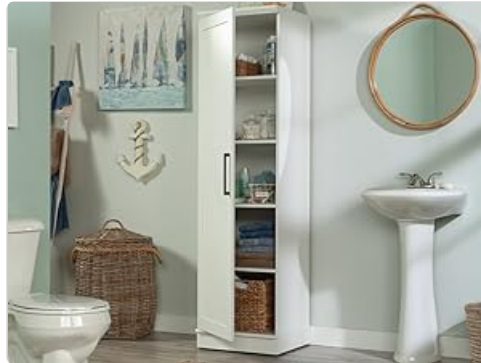
Figure 3.2: Metal handles on cabinet doors.

The cabinet features two framed panel doors with metal handles. Open and close doors gently to prevent wear on hinges. If doors appear misaligned, the hinges typically offer adjustment screws for fine-tuning.