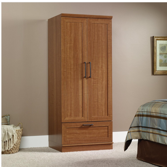
Figure 3: Cabinet in a bedroom, closed.

Explore additional views of the Sauder HomePlus Wardrobe/Storage Cabinet in various settings to understand its versatility and design.