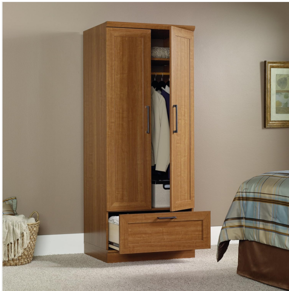
Figure 4: Cabinet in a bedroom, doors open.