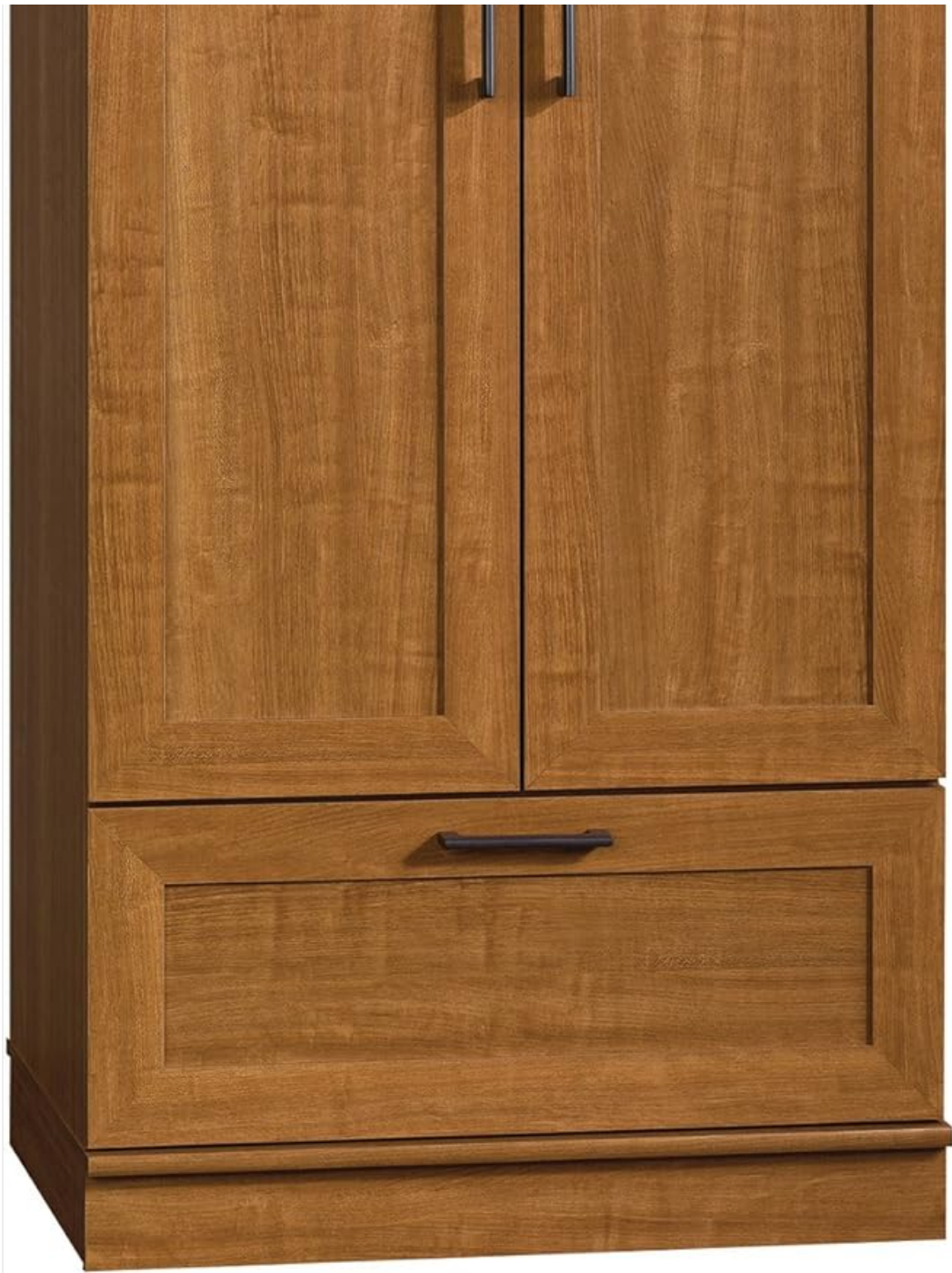
Figure 1: Sauder HomePlus Wardrobe/Storage Cabinet (Sienna Oak)