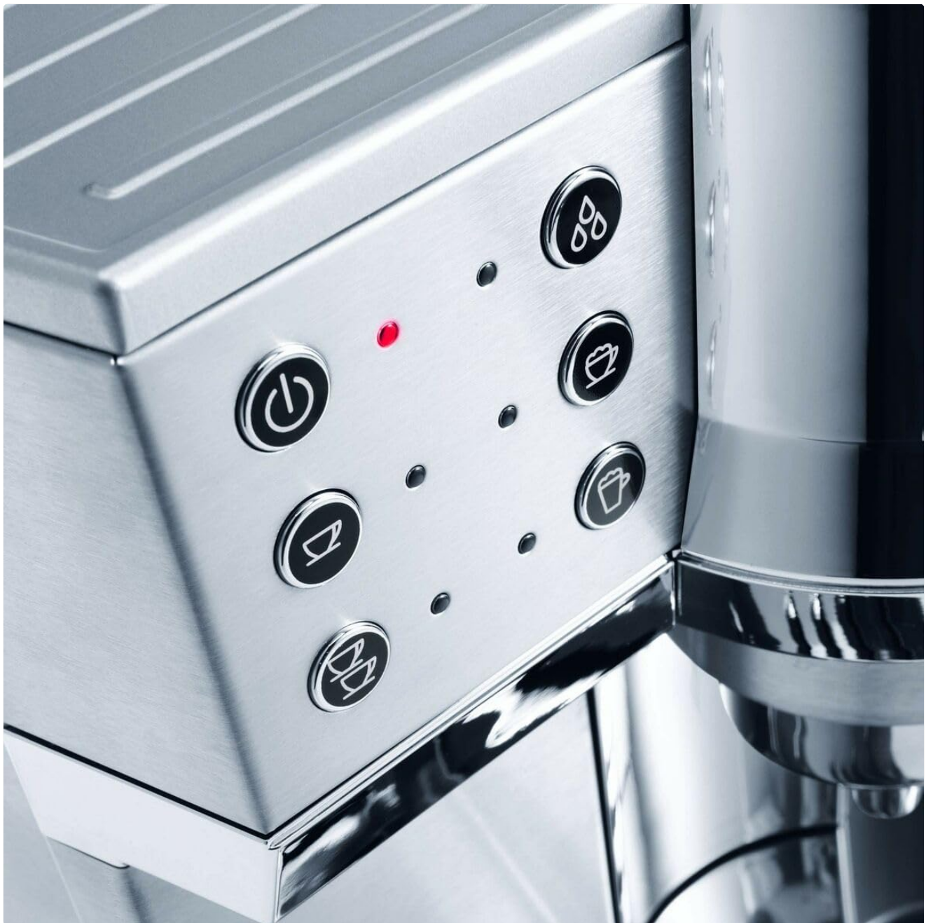
Image 1: The De'Longhi EC850.M Coffee Machine in a kitchen setting, showcasing its compact design and automatic cappuccino system.