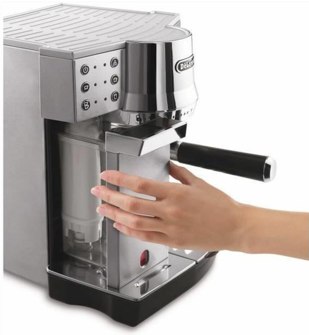
Image 2: A hand demonstrating the removal of the water tank from the side of the De'Longhi EC850.M for refilling or cleaning.

Remove the water tank from the back of the machine. Fill it with fresh, cold water up to the MAX level indicator. Reinsert the tank securely.