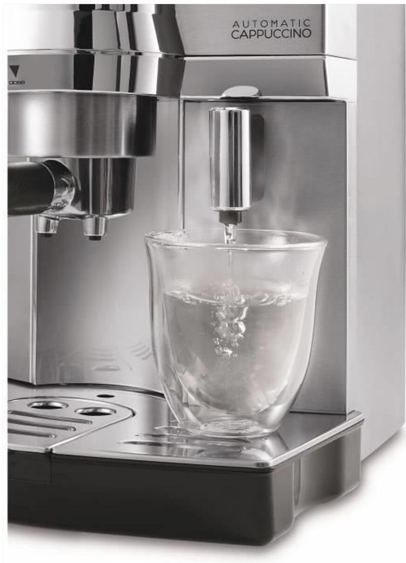
Image 4: The De'Longhi EC850.M dispensing hot water from its dedicated spout into a glass, useful for tea or Americanos.