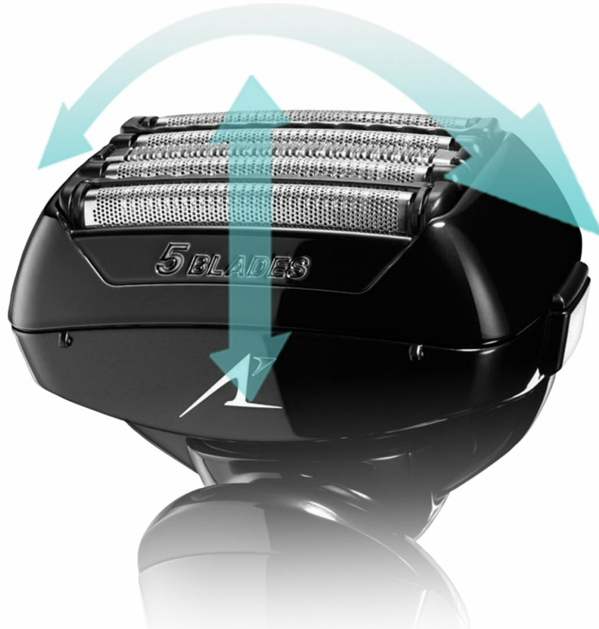
Image: A visual representation of the shaver's Multi-Flex Pivoting Head, showing how it moves to follow the curves of the face for enhanced shaving comfort.