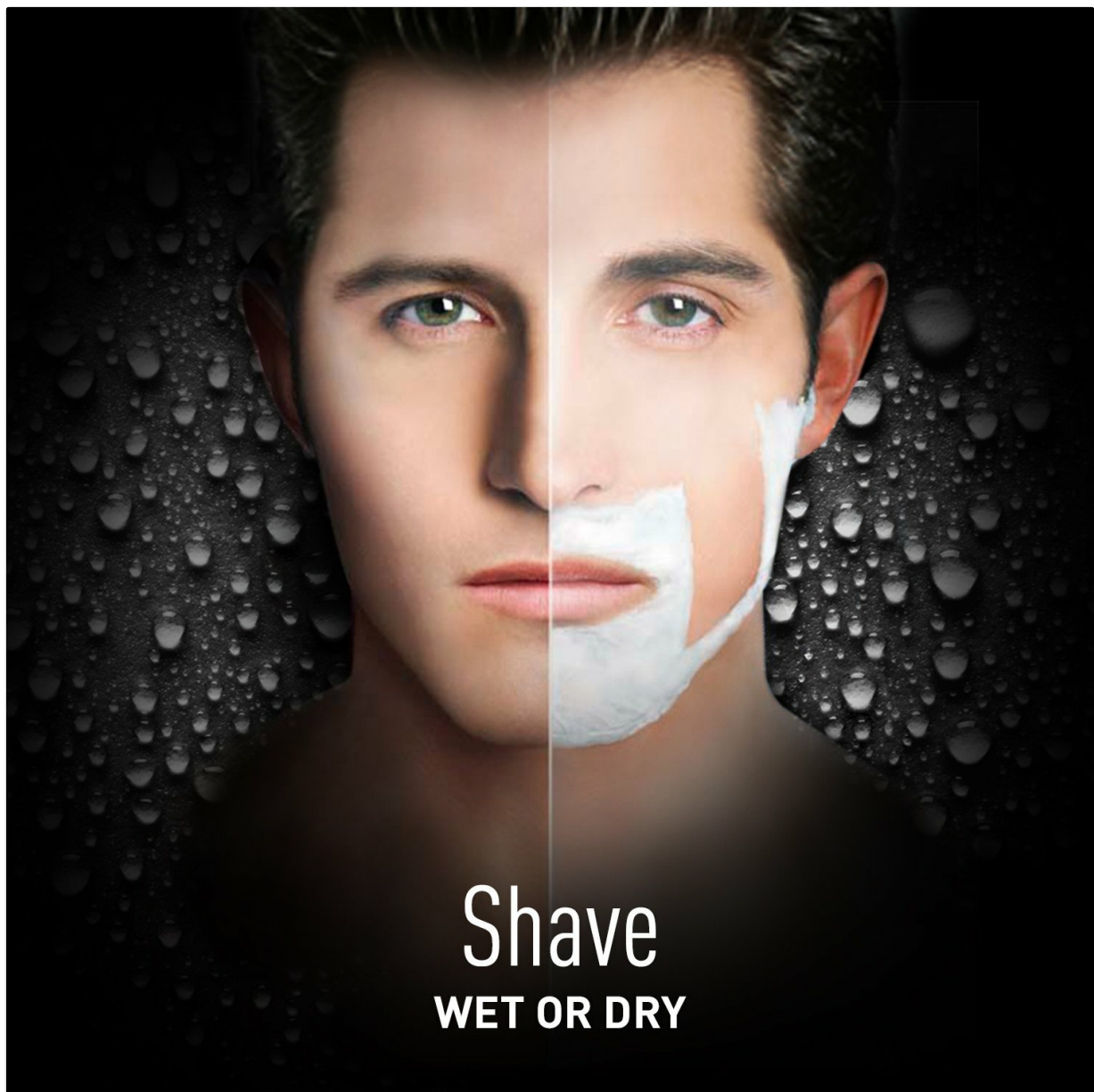
Image: A composite image demonstrating the shaver's versatility for both wet and dry shaving, showing a face with and without shaving cream.

Your browser does not support the video tag.