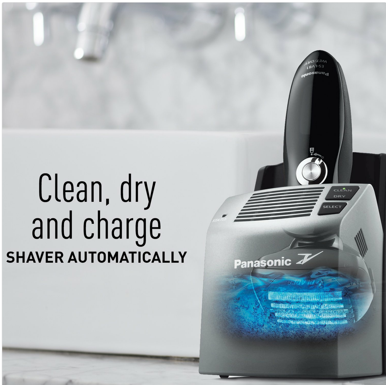
Image: The Automatic Clean & Charge Station in operation, with a blue light indicating the cleaning process for the shaver head.