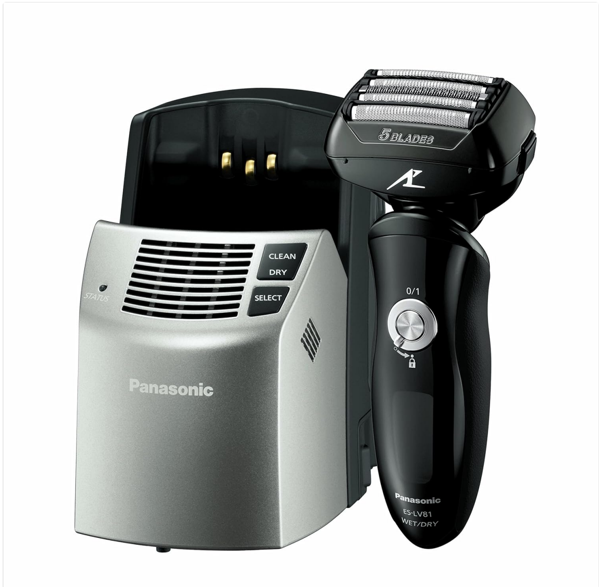
Image: The Panasonic ES-LV81-K electric shaver securely placed in its Automatic Clean & Charge Station.