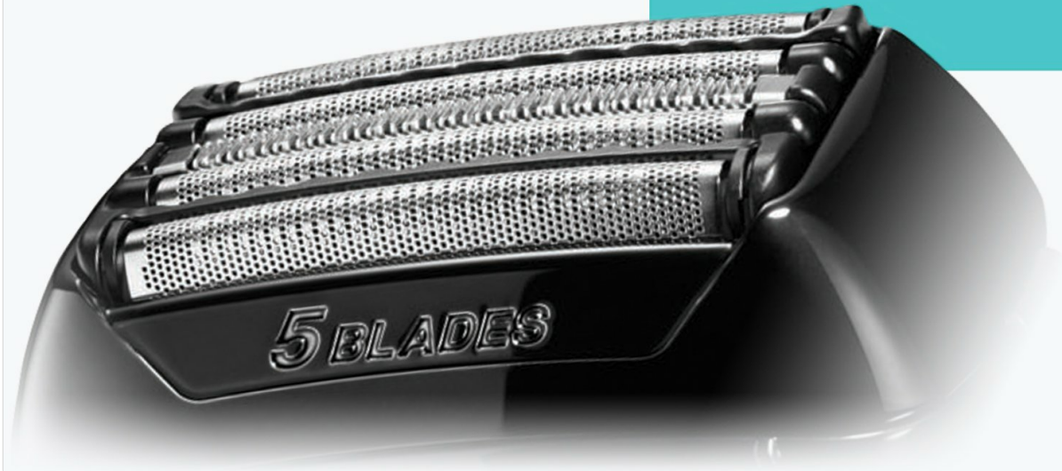
Image: A detailed view of the shaver's cutting head, highlighting the five 30-degree angled blades designed for a close shave.