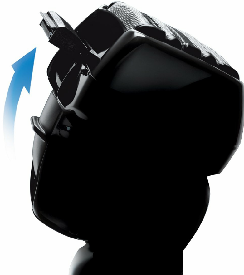
Image: The integrated pop-up trimmer extended from the shaver, ready for precise detailing and trimming.