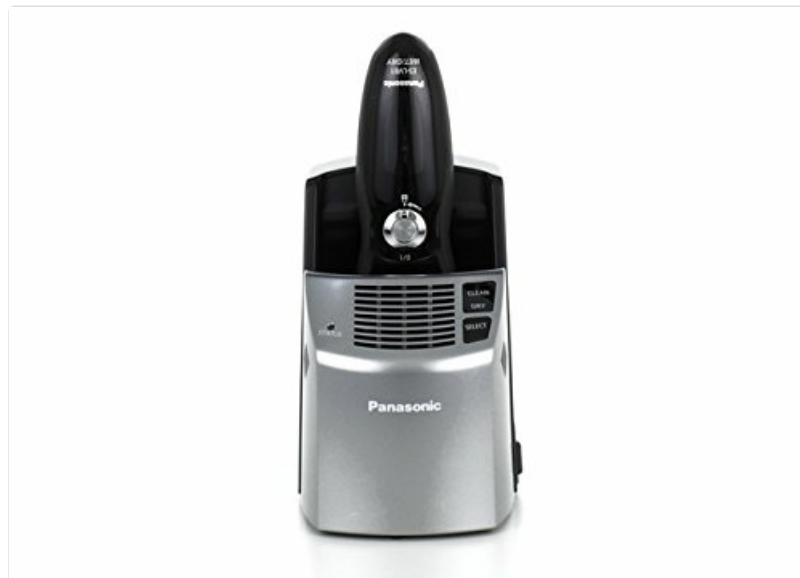
Image: A front view of the Automatic Clean & Charge Station, showing the control buttons for clean, dry, and select functions, with the shaver docked.