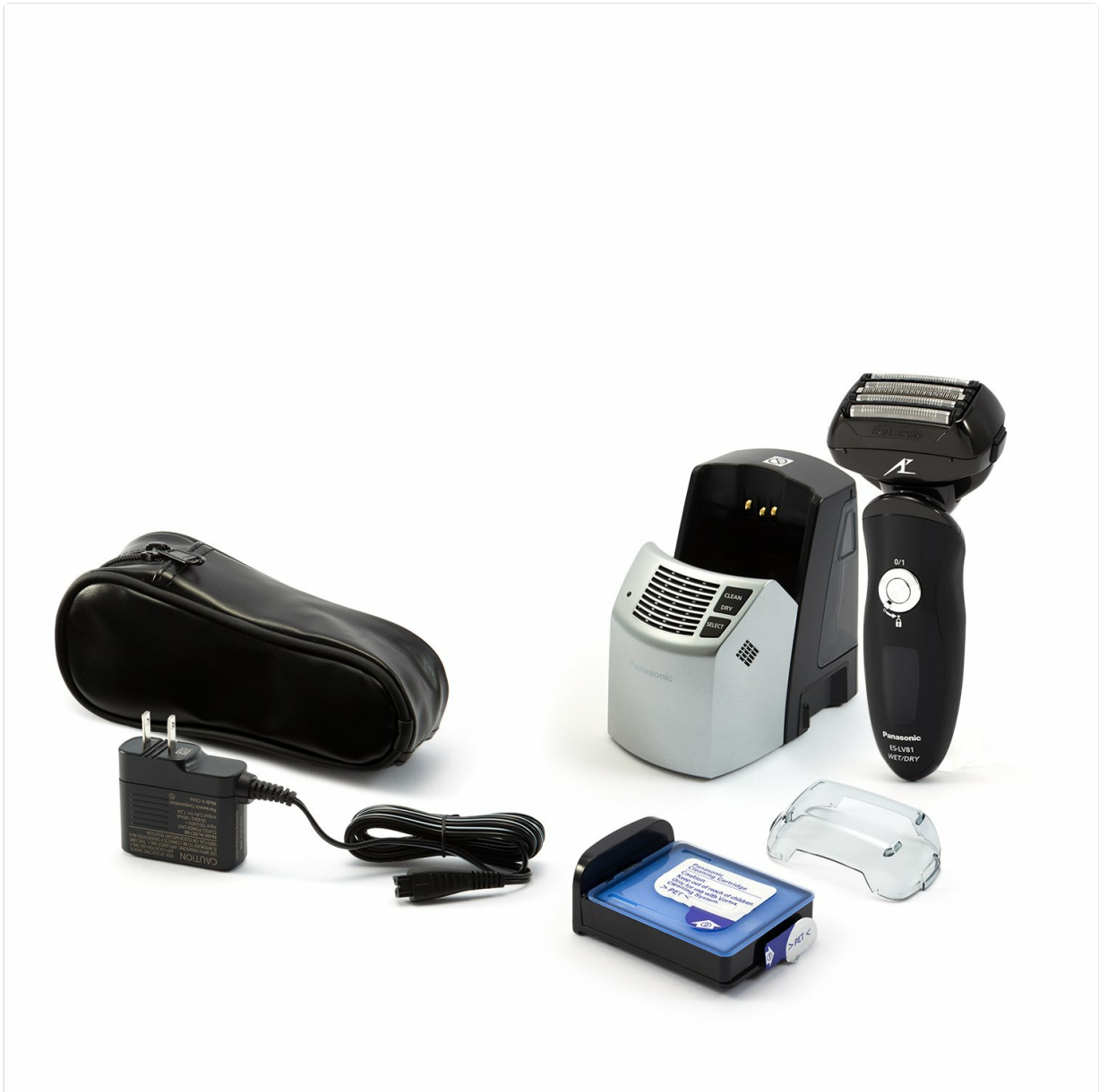
Image: The complete package contents, including the shaver, cleaning station, power adapter, travel pouch, and cleaning cartridge.