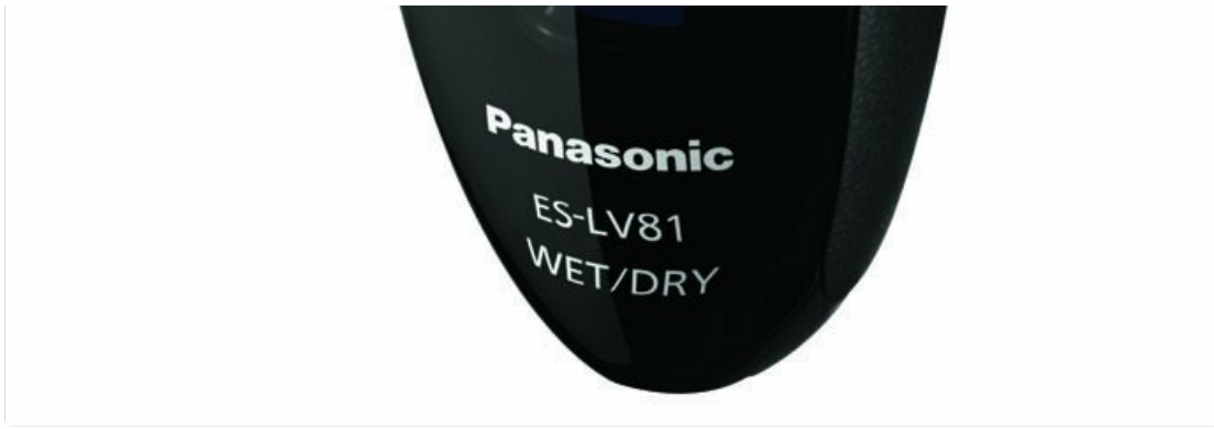
Image: The Panasonic ES-LV81-K shaver displaying its LCD screen with battery charge status.

Five 30° angled blades cut hair at THE BASE FOR A CLOSE SHAVE