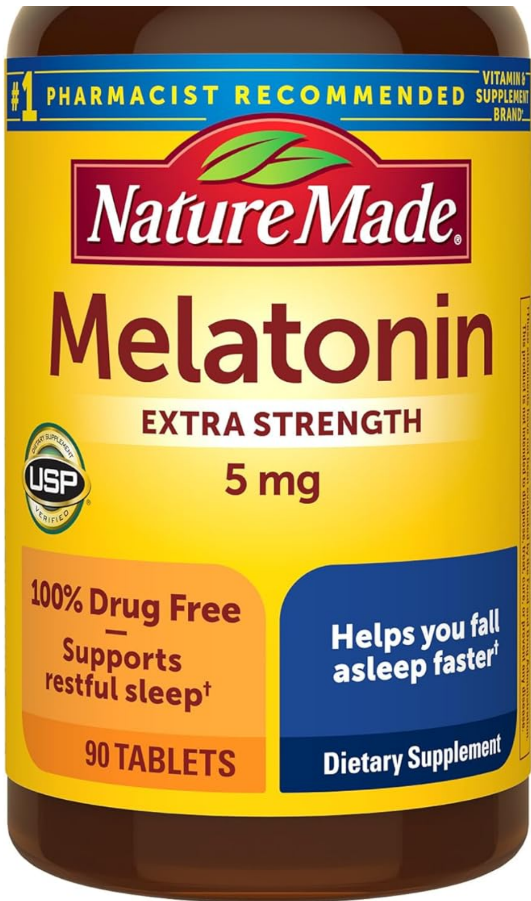
Image: Front view of the Nature Made Melatonin 5mg Tablets bottle, showing the brand, product name, dosage, and key benefits.