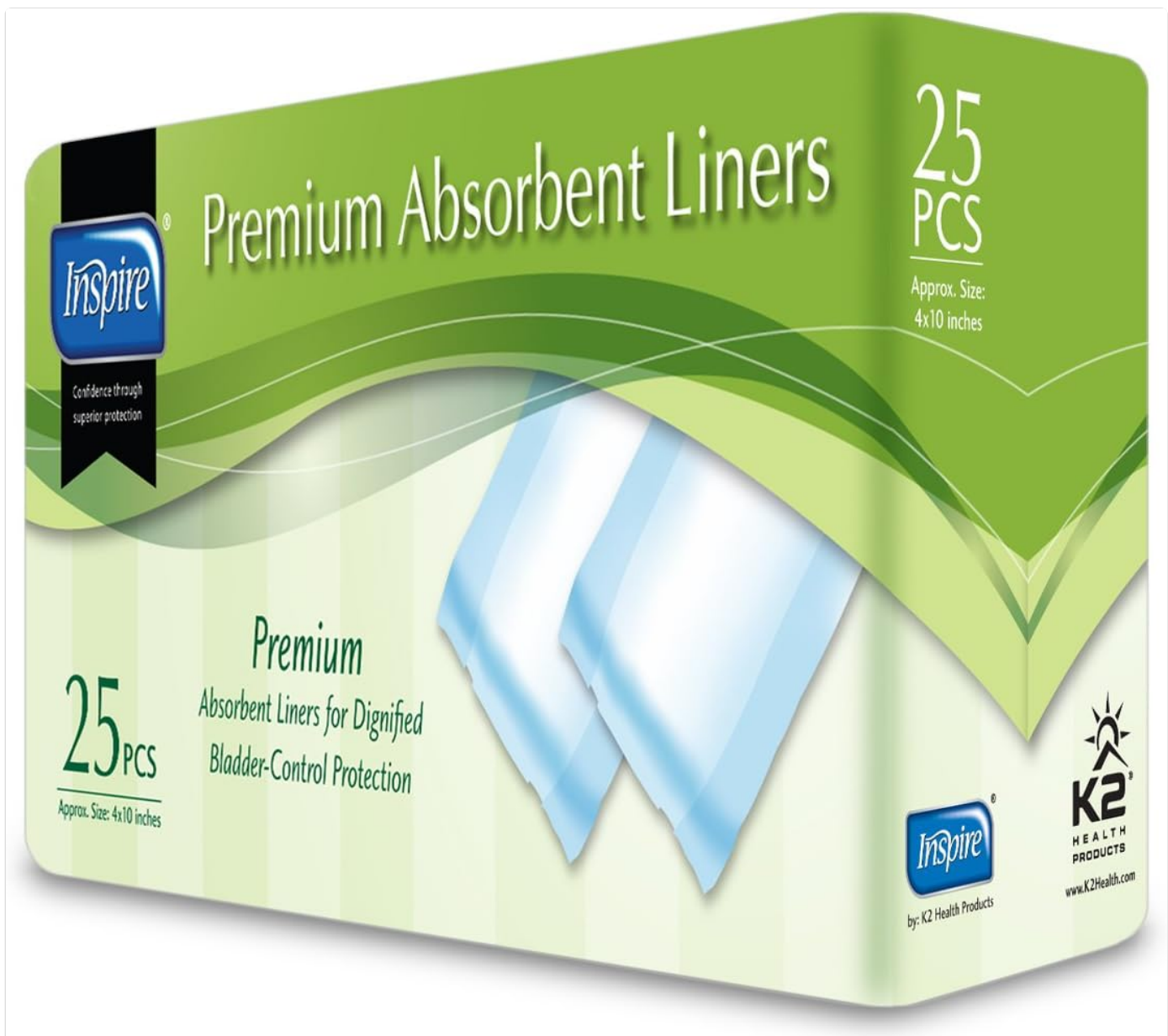
Image: Packaging for Inspire Premium Absorbent Liners, showing the brand name, product type, and count.