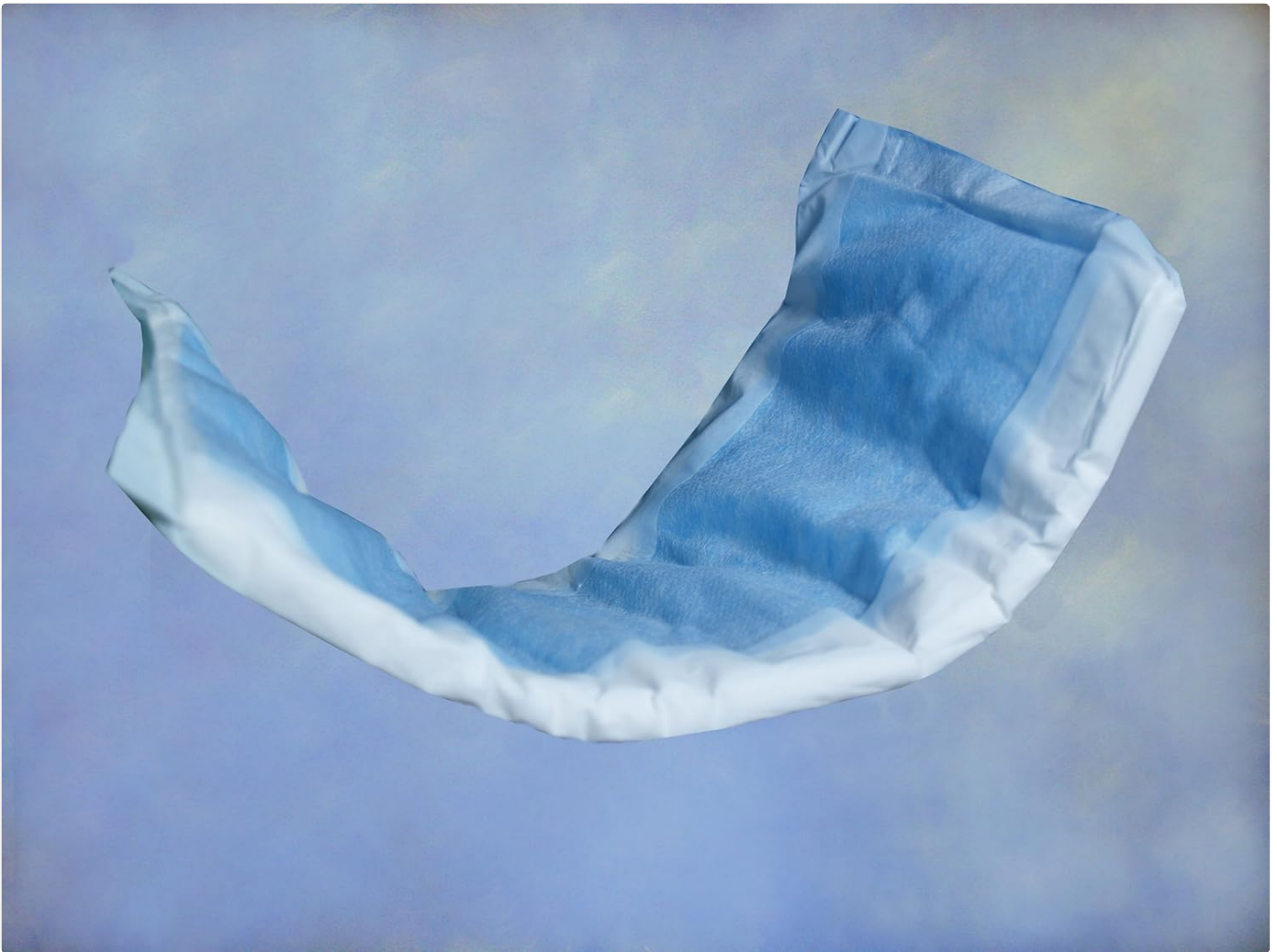
Image: A single Inspire Premium Absorbent Liner, showcasing its contoured shape and thickness.