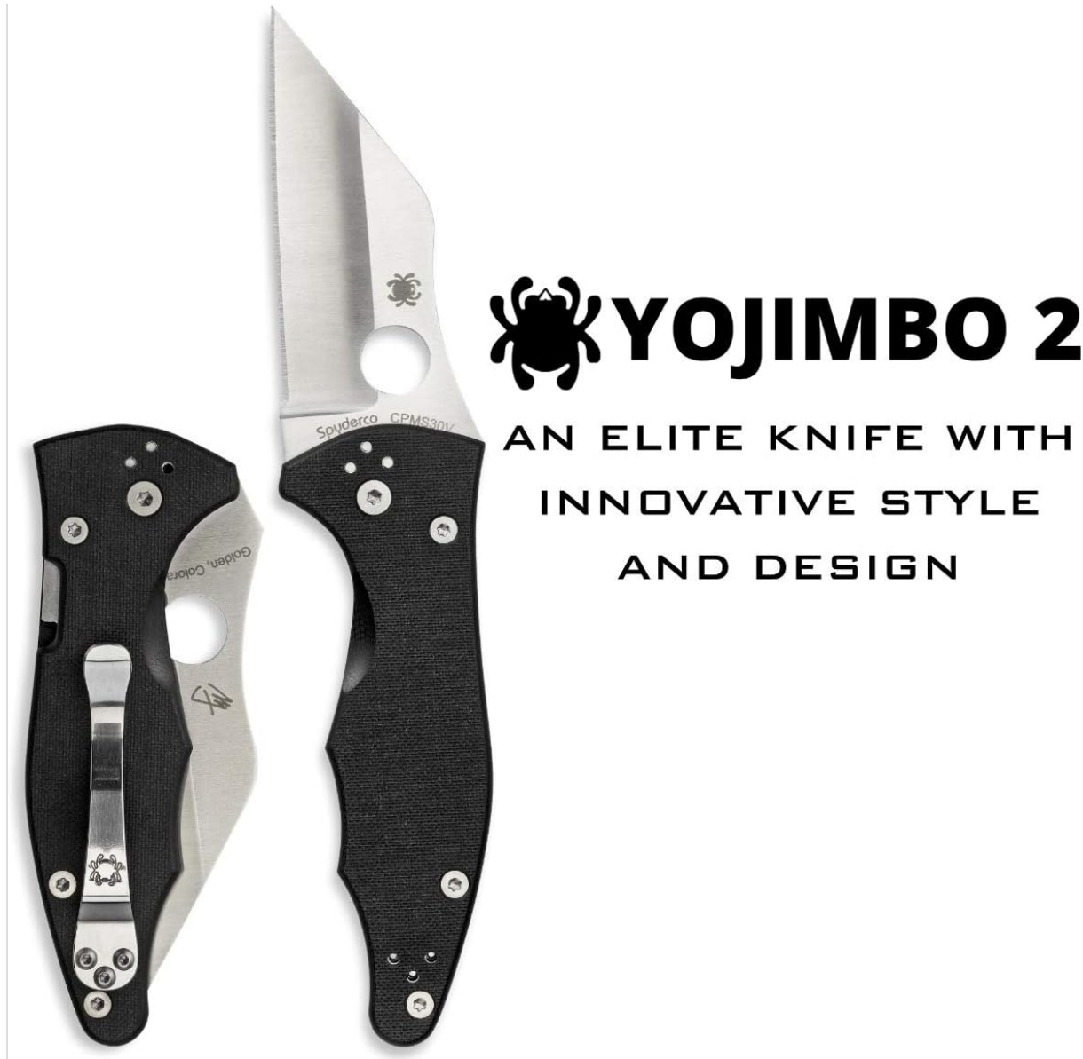
Image: The Spyderco YoJimbo 2 knife, showing both its open and closed positions, highlighting the blade and handle design.