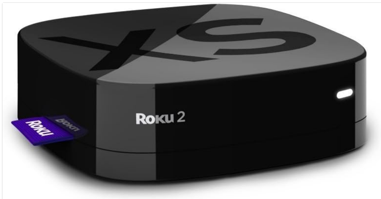
Image: The Roku 2 XS 1080p Streaming Player, a compact black device with the Roku logo, shown with a purple Roku tag on its side.

The Roku 2 XS is a streaming player designed to deliver high-definition entertainment to your television. It supports 1080p HD streaming and includes features for motion-based gaming. This device provides access to a wide array of streaming channels, including popular services like Netflix, Hulu Plus, and Amazon Instant Video. It also offers a free mobile application for iOS and Android devices, enhancing control and content browsing. Connectivity options include Ethernet for wired connections and a USB port for playing local media.