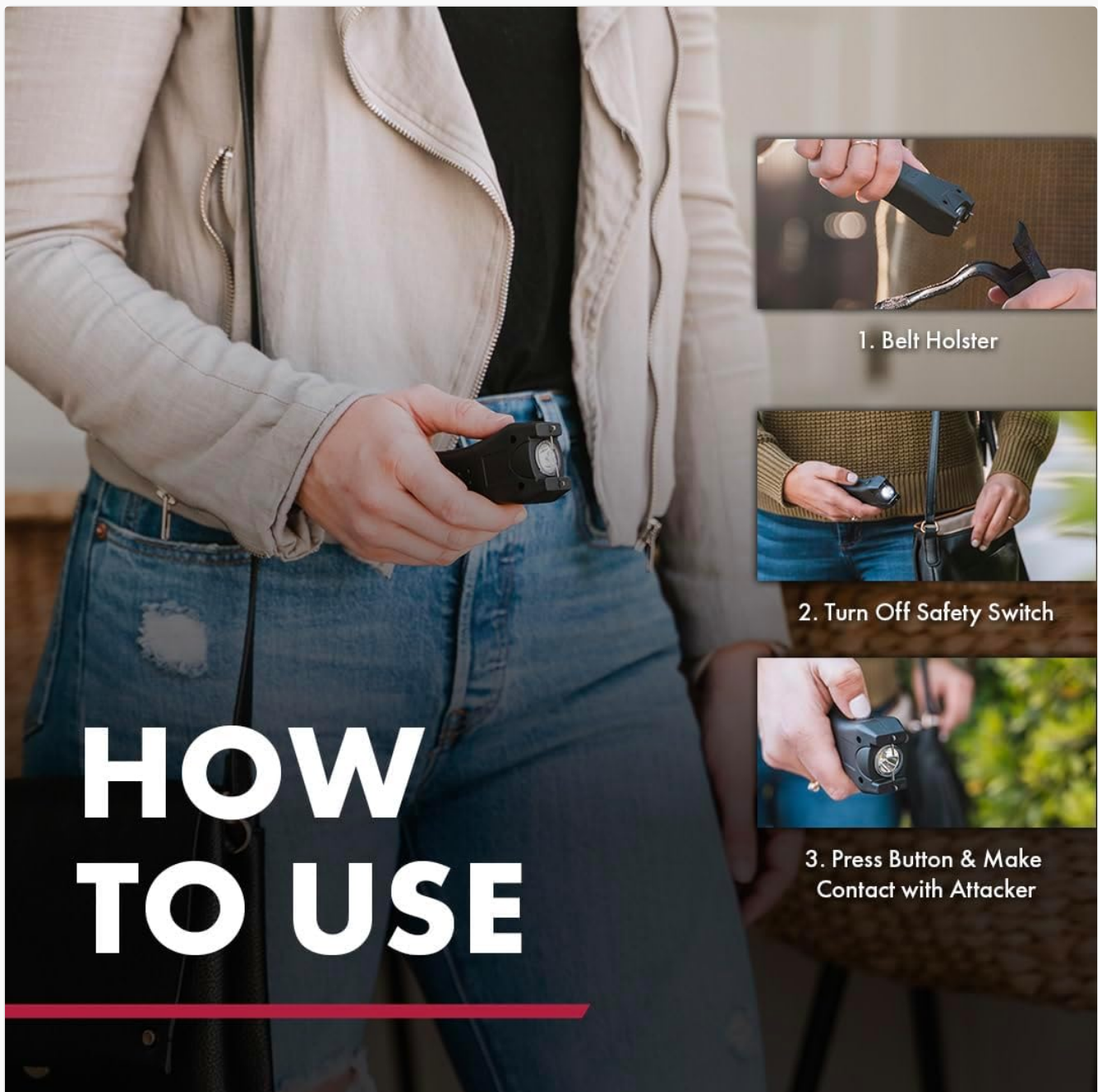
Figure 3: Steps for using the stun gun function.

The stun gun function is intended for self-defense only. Always ensure you are familiar with its operation before an emergency arises.