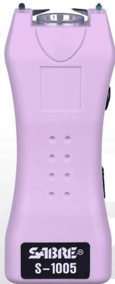
Figure 2: Overview of SABRE S-1005 features.