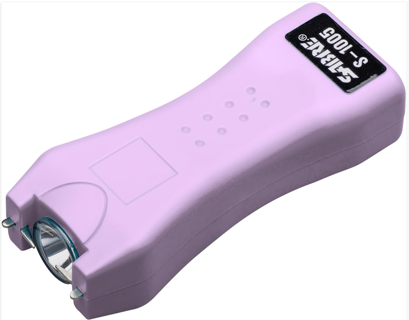
Figure 1: SABRE 2-in-1 Stun Gun and Flashlight (Purple model shown).

The SABRE 2-in-1 Stun Gun and Flashlight is a compact and powerful personal safety device. It delivers a 1.60 \mu\text{C} (Microcoulombs) charge, designed to produce 'intolerable pain' for effective self-protection. Additionally, it features a 120-lumen LED flashlight for illumination in dark environments or emergencies. The device is designed with a comfortable, rubberized grip and includes a belt holster for convenient and discreet carrying.