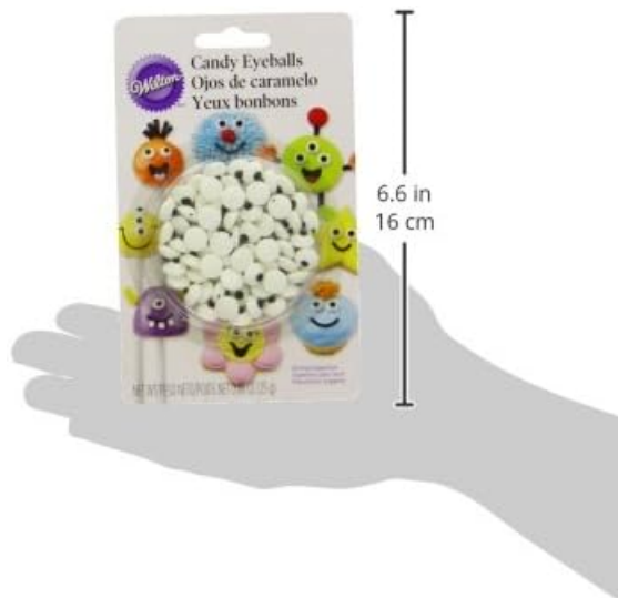
A close-up image showing the size of the Wilton Candy Eyeballs in comparison to a hand, highlighting their small dimensions.