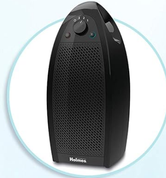
HAP9412B, HAP9412BF HEPA Type Air Purifier