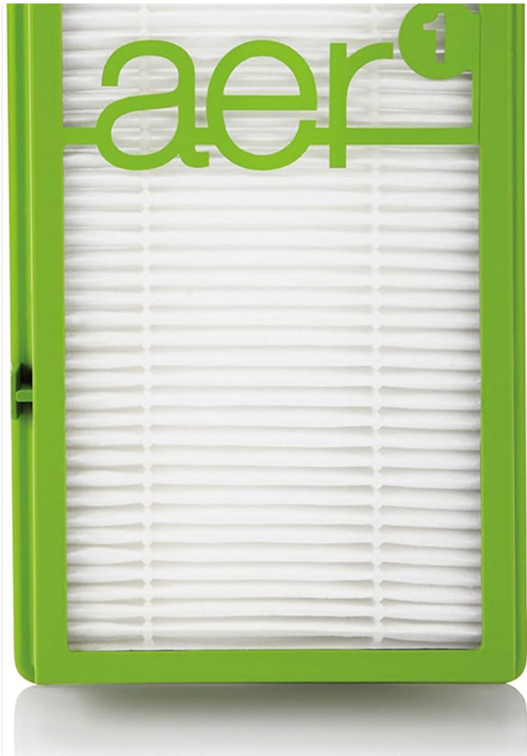
Image 1: Holmes True HEPA Allergen Remover Filter. This image displays the front view of the filter, highlighting its pleated design and green frame with the 'aer1' logo.