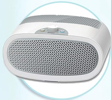
HAP9240-NWU-1 Aer1 Desktop Air Purifier