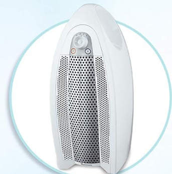
HAP9414 HEPA Type Air Purifier