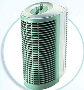
HAP412N-NU-1 HEPA Type Tower Air Purifier