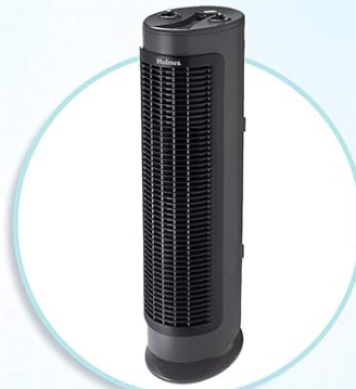
HAP424-NU-1 HEPA Type Tower Air Purifier