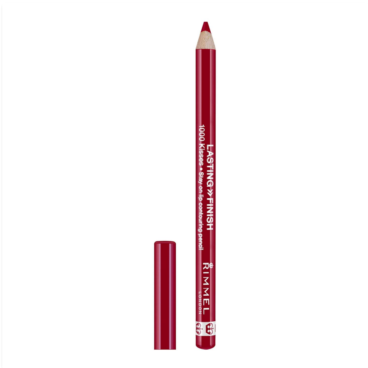
Image: Rimmel 1000 Kisses Lip Liner in Cherry Kiss, with its cap removed, showcasing the vibrant red pencil.