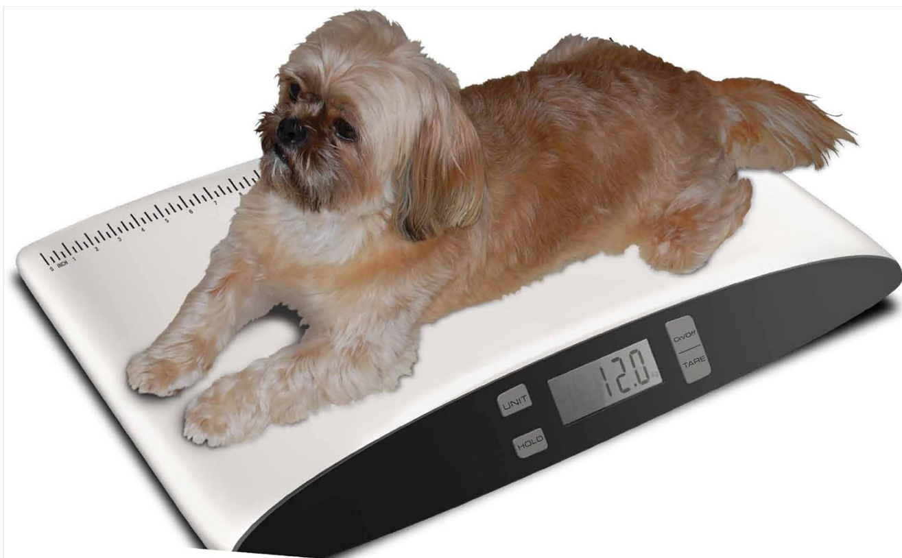
Image: A small dog comfortably lying on the REDMON Precision Digital Pet Scale during a weighing session.

Ensure the scale is on a flat surface and displaying "0.00". Gently place your pet on the center of the scale. Wait for the weight to stabilize on the display. If your pet is moving, use the HOLD function.