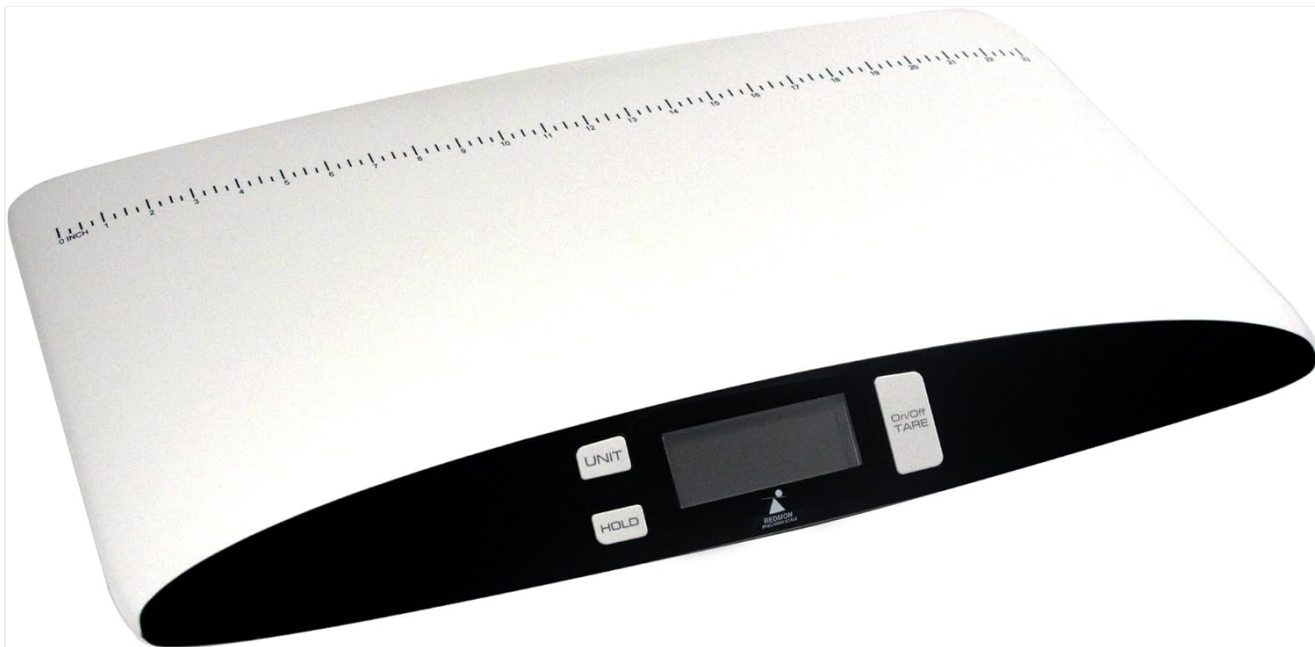
Image: Top view of the REDMON Precision Digital Pet Scale, showing the flat weighing surface and control panel.

Place the scale on a hard, flat, and stable surface. Uneven surfaces can affect accuracy. Avoid placing it on carpets or soft flooring.