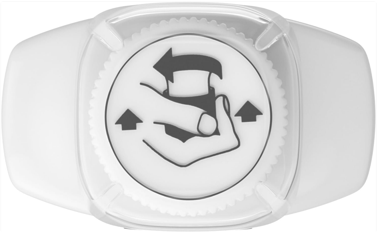
Image 4: Top view of the bottle cap illustrating how to open the child-resistant cap.